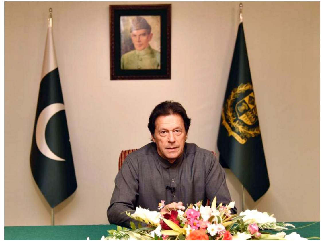
ISLAMABAD: Prime Minister Imran Khan addressing the nation, on Sunday.