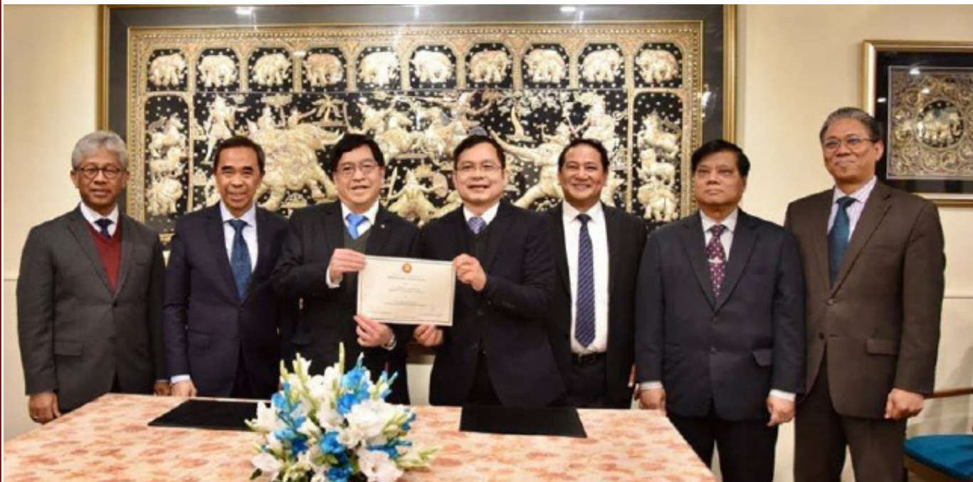
Handover ceremony of the ASEAN Countries in Islamabad (ACI) Chairmanship 2020 from The Ambassador of Thailand to Ambassador of Vietnam. ASEAN ambassadors attended the ceremony.