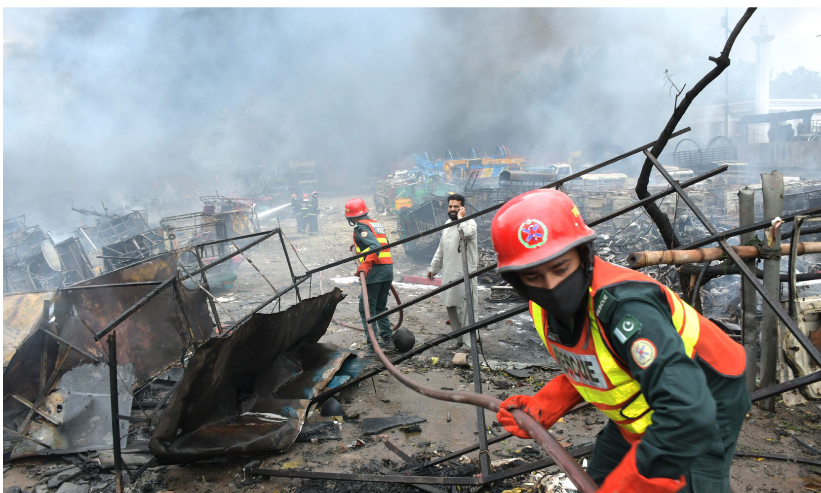
LAHORE: Firefighters extinguishing fire after an LPG container caught fire in Lahore's Shahdara on Wednesday morning.

BEIJING: Beijing reported two new confirmed cases of novel coronavirus disease (COVID-19) from Canada and France, respectively, over the past 12 hours by Wednesday noon, according to the municipal health commission. The latest reports have brought the total number of confirmed imported cases in Beijing to 145 as of Wednesday noon. In addition, 416 confirmed indigenous cases have been reported in the city, of which 392 have been discharged from hospital after recovery.