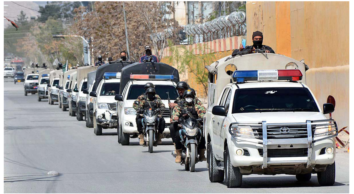
QUETTA: Security forces including Police, Levies Force and Balochistan Frontier Corps patrolling the areas of during lockdown as people restricted their movement to prevent COVID-19 outbreak.