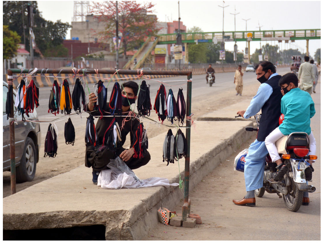
LALALMUSA: A vednor selling masks.

He further stated that total 123 were confirmed cases out of 704 reported cases. "People only need to maintain social distance to stay safe from the novel