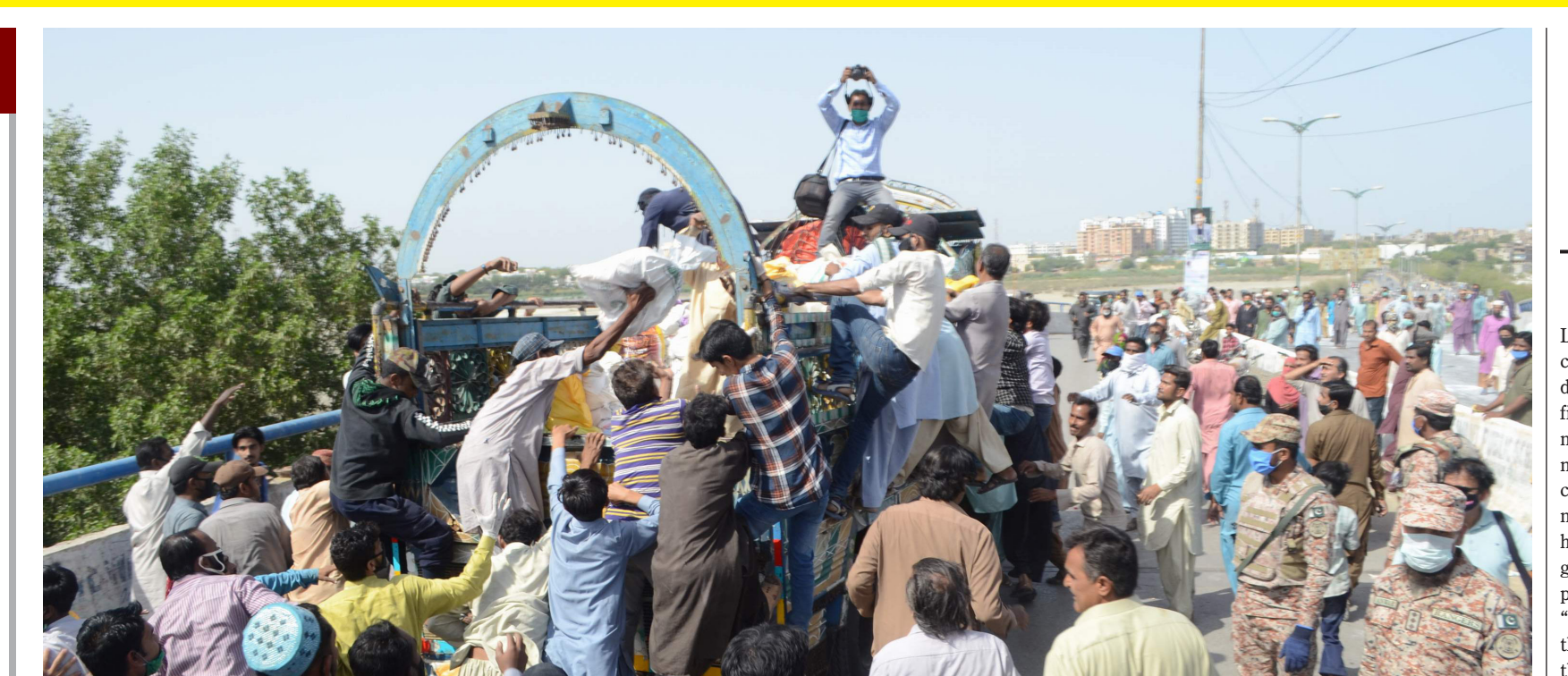
HYDERABAD: People pounce upon a ration truck on Monday.

PCDMA has requested to waive all notices including income tax, sales tax, WHT and all proceeding in this regard for 2 months due to the worst economic crisis, as due to coronavirus pandemic. all the business activities have stopped and commercial importers are already facing huge financial crises.