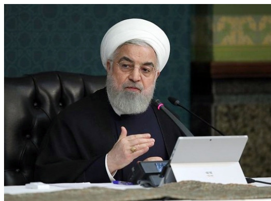
on Iran, Hassan Rouhani said in a televised cabinet meeting. "The sanctions have failed to hamper our efforts to fight against the coronavirus outbreak."

It was a great opportunity for Americans to apologize ... and to lift the unjust and unfair sanctions