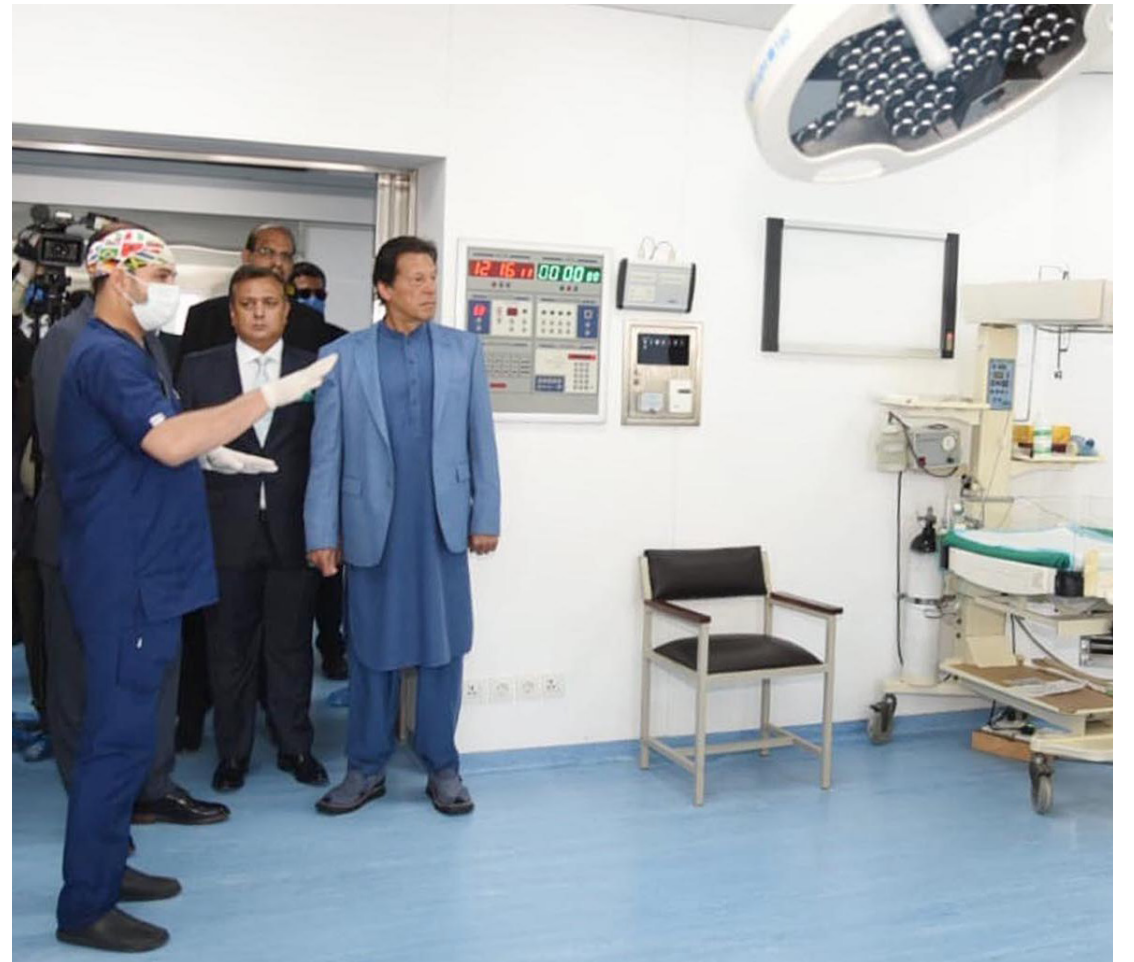
ISLAMABAD: PM Imran Khan being briefed during his visit to Cantt General Hospital.

munity to take necessary steps to address this disease. The Government of Japan always stands with Pakistan to fight against such viruses, referring to Japanese Assistance of 229 Million USD in total provided to Pakistan for polio eradication since 1996. Simultaneously the Government of Japan would like to cooperate with the Government of Pakistan to fight against the Novel Coronavirus (COVID-19) Infection.