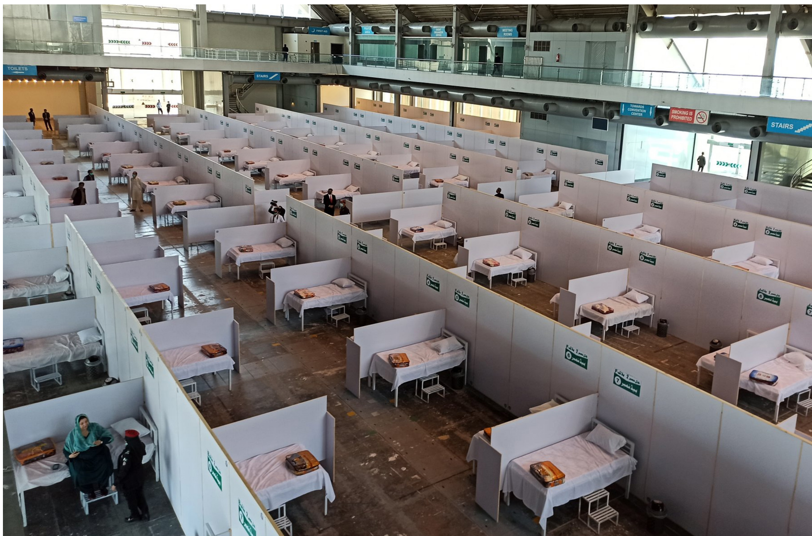
LAHORE: A view of isolation facility established by Punjab govt.

While chairing a video conference attended by Information Ministers of all four provinces, Azad Jammu and Kashmir and Gilgit-Baltistan, she said it was responsibility of the federal and provincial governments to provide correct and timely information to the media as hiding facts would tantamount to harming the interest of the country. She appreciated the media for fulfilling its national responsibility at this critical juncture as this was not the time of point-scoring or improving ratings. APP