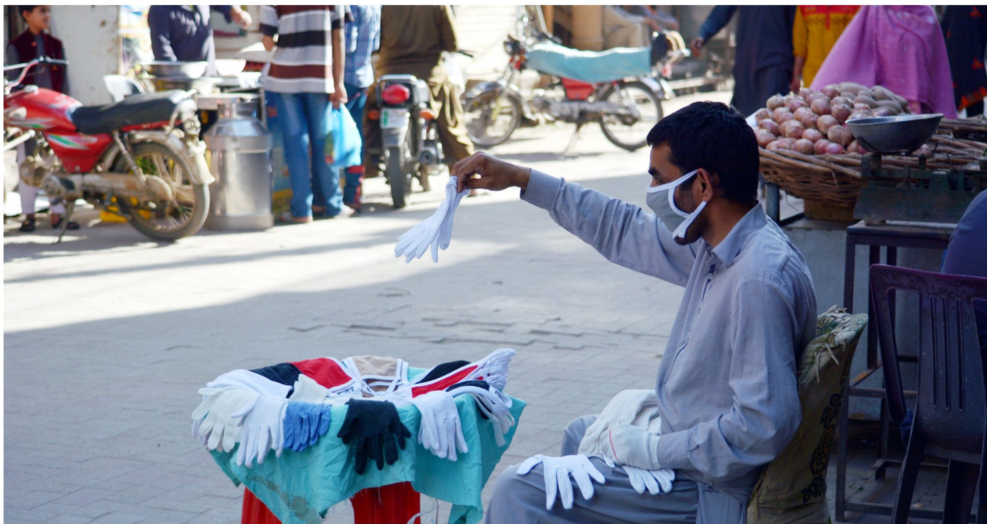
LALAMUSA: A man selling face masks at his roadside set up.