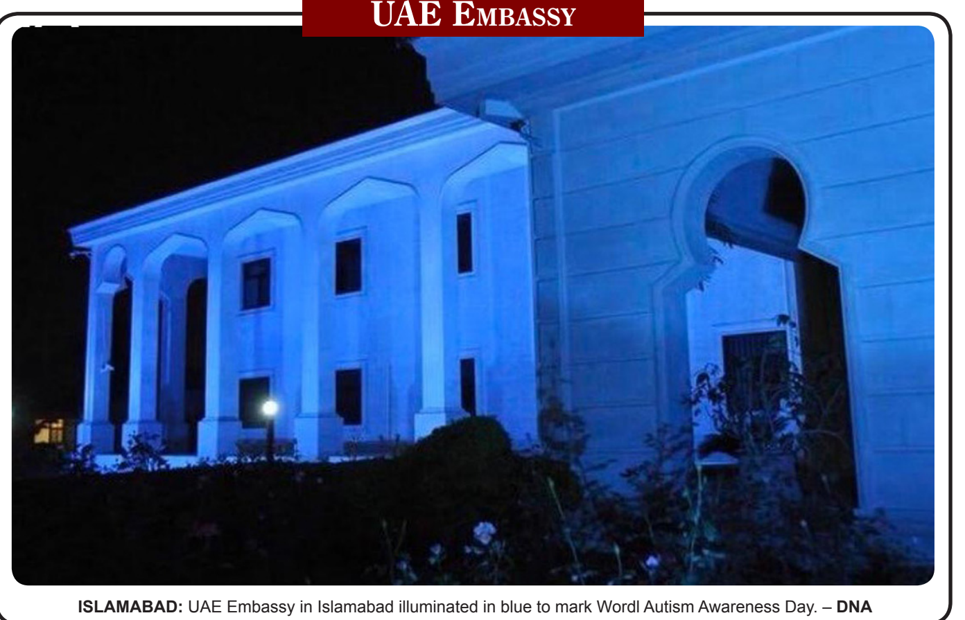
ISLAMABAD: UAE Embassy in Islamabad illuminated in blue to mark World Autism Awareness Day.

Despite financial constraints, huge amounts have been dedicated to upgrade medical facilities. Equally importantly, significant steps have been taken to shore up the economy and a mega relief package has been initiated to alleviate the difficulties being faced by the most vulnerable in society. In order to reach out to every household in far flung areas, a volunteer 'Tiger Force' is being raised as a special initiative of the Prime Minister. They will assist state representatives with relief activities at this hour of need. Similarly, a special fund has been created to accept donations to assist our more needy brethren. He requested those able and desirous to contribute generously in response to this appeal.