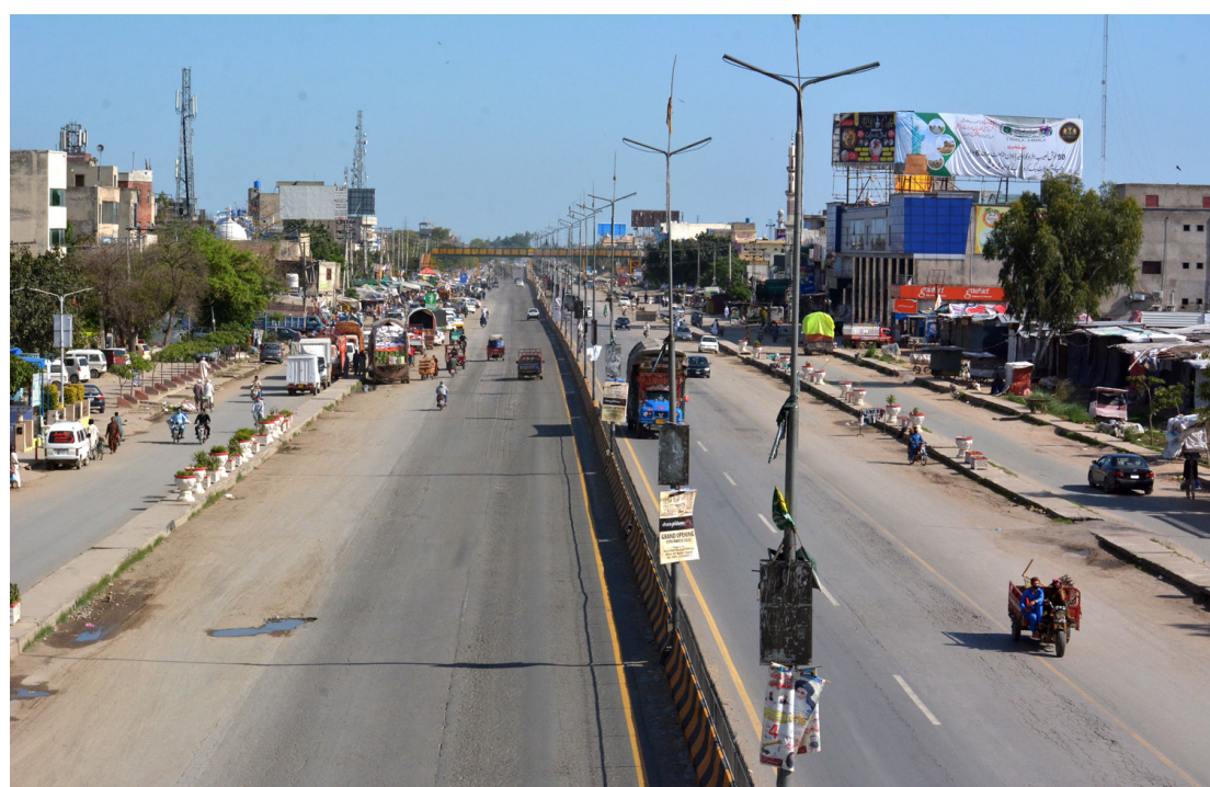
LALAMUSA: City wears a deserted look due to lockdown. - Khurshid Nadeem

and said that this was a part of the well-hatched conspiracy of the Indian rulers designed to turn the Muslim majority of the occupied territory into a minority and an abortive attempt to suppress the struggle of Kashmiri people for the realization of their inalienable right to self-determination. - APP