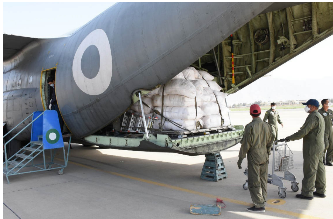
A PAF C-130 aircraft carrying medical equipment for the people of Baluchistan lands at PAF Base Samungli, Quetta.