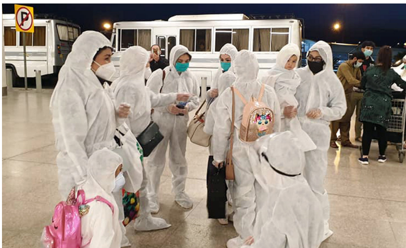
Uzbek citizens leaving for Tashkent via PIA special flight.

twenty-eight stranded Pakistanis in Uzbekistan were brought back to the country through a special flight of Pakistan International Airlines (PIA). These stranded Pakistani nationals included tourists who came to Republic of Uzbekistan on short-term visa and could not return to Pakistan due to suspension of international flights following COVID-19 outbreak. During their stay in Uzbekistan, the Embassy of Pakistan, Tashkent took all necessary steps to ensure complete wellbeing of these Pakistanis.