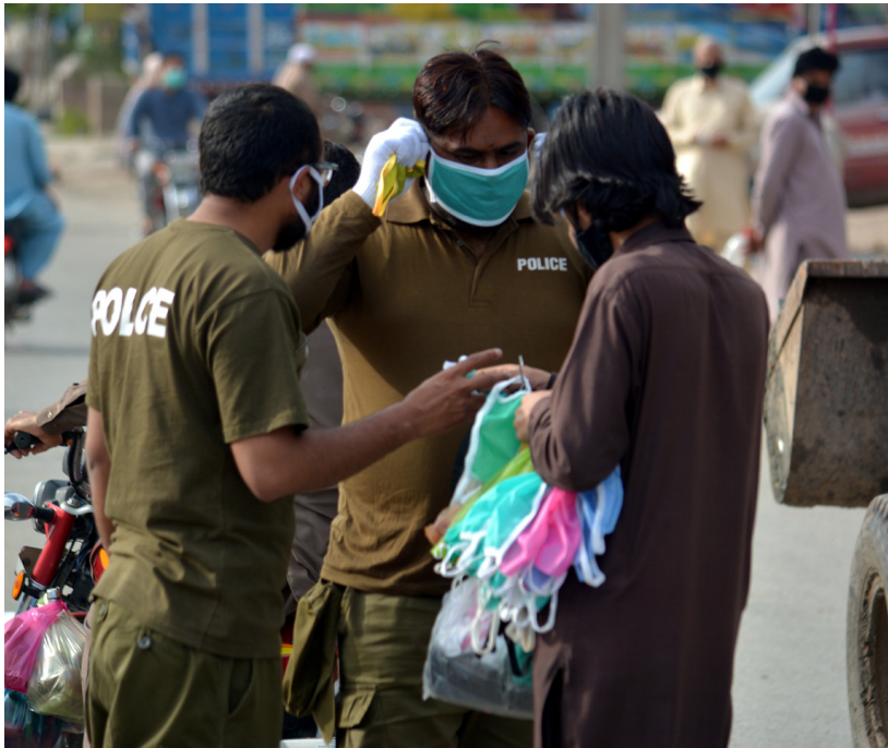
LALAMUSA: Police cops buying face masks to protect themselves against virus. — Khurshid Nadeem

A spokesman said here on Monday that the Foundation shifted 174 bodies and 397 injured persons to various hospitals. It also shifted 2,548 and 7,172 injured persons to their houses from hospitals. As many as 224 persons were admitted into Bilquees Edhi Home Gulberg. — APP