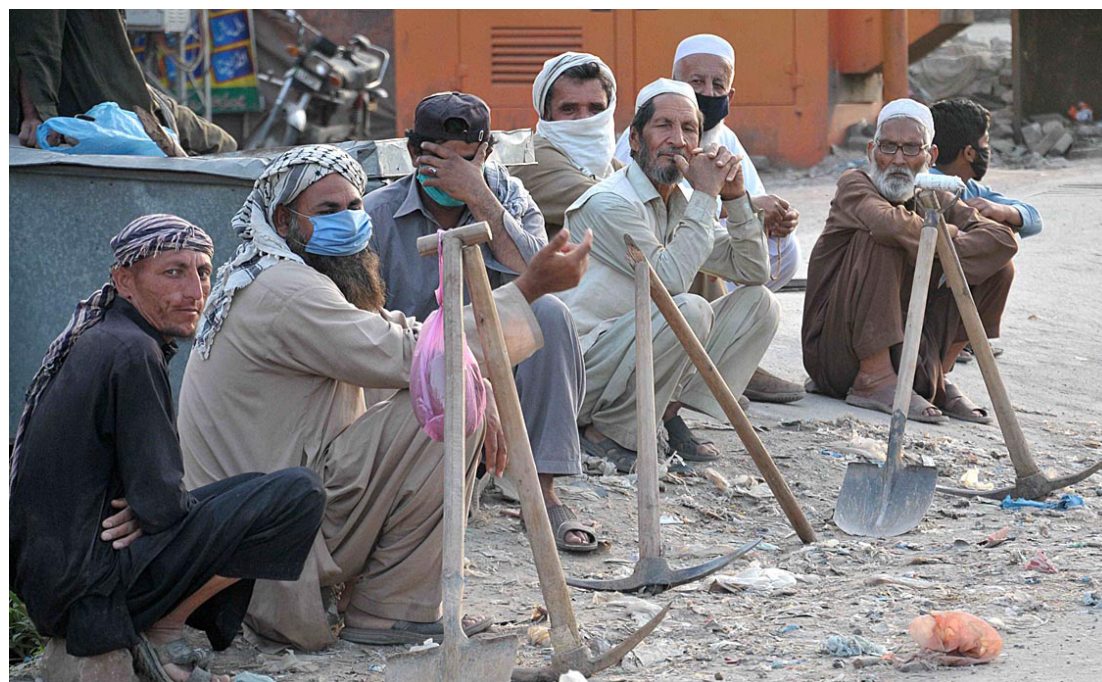
ISLAMABAD: Daily wagers sitting at a roadside waiting for job to earn for livelihood.