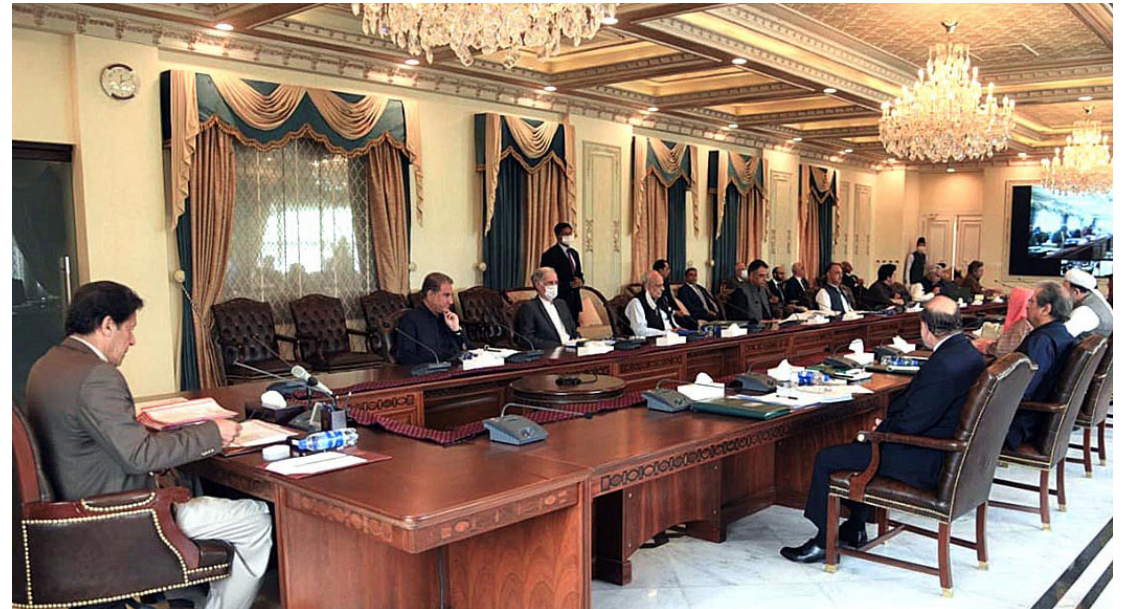
ISLAMABAD: Prime Minister Imran Khan chairing Cabinet meeting.

ing and reorganizing Evacuee Trust Property Board, giving nod to utilize its properties in Health, Education and Housing sectors. Special Assistant on National health Services Dr. Zafar Mirza gave briefing to the cabinet about ongoing Coronavirus cases and government's measures to provide relief to Corona-hit labour population. The Cabinet was told that 39,000 personal protective kits have been dispatched to all provinces for protection of paramedical staff engaged in Coronavirus-hit patients. Special Assistant on Youth Affairs Usman Dar informed the cabinet that 7,17,119 youth have so far been registered with Corona Relief Tigers Force, which is working in district, tehsil and Union Council-level across the country. Special Assistant on Social Protection Dr Sania Nishtar gave detailed briefing to the cabinet on Ehsaas Emergency Cash Programme.