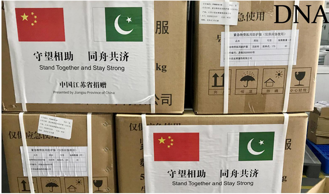
ISLAMABAD: More medical supplies arrive from China.

ISLAMABAD: The United Arab Emirates has announced suspension of prayers at all places of worship including mosques and churches amid the Coronavirus epidemic, Emirates News Agency (WAM) said Friday. The decision has been taken in coordination with the UAE's National Crisis Emergency and Disasters Management Authority and the General Authority of Islamic Affairs and Endowments and will remain in force until further notice. — APP