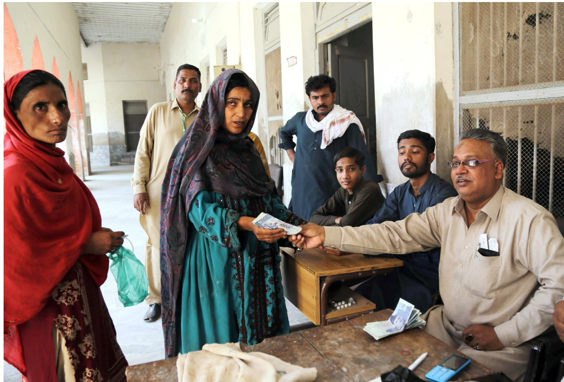
HYDERABAD. Needy women getting compensation.

information. He said South Asians have long suffered from intraregional tariff and nontariff barriers that make it difficult to move goods and people across borders. "Home to one-fourth of the world's poorest people, the region has disproportionately high trade costs, poor logistics infrastructure, and inefficient trade facilitation. He said the promise of regional trade in South Asia estimates that the trade within the region could be worth $67 billion rather than its recent value of $23 billion. South Asia also has significant constraints on its services trade, even though the services sector accounts for more than half of the economies in Bangladesh, India, Pakistan, and Sri Lanka.