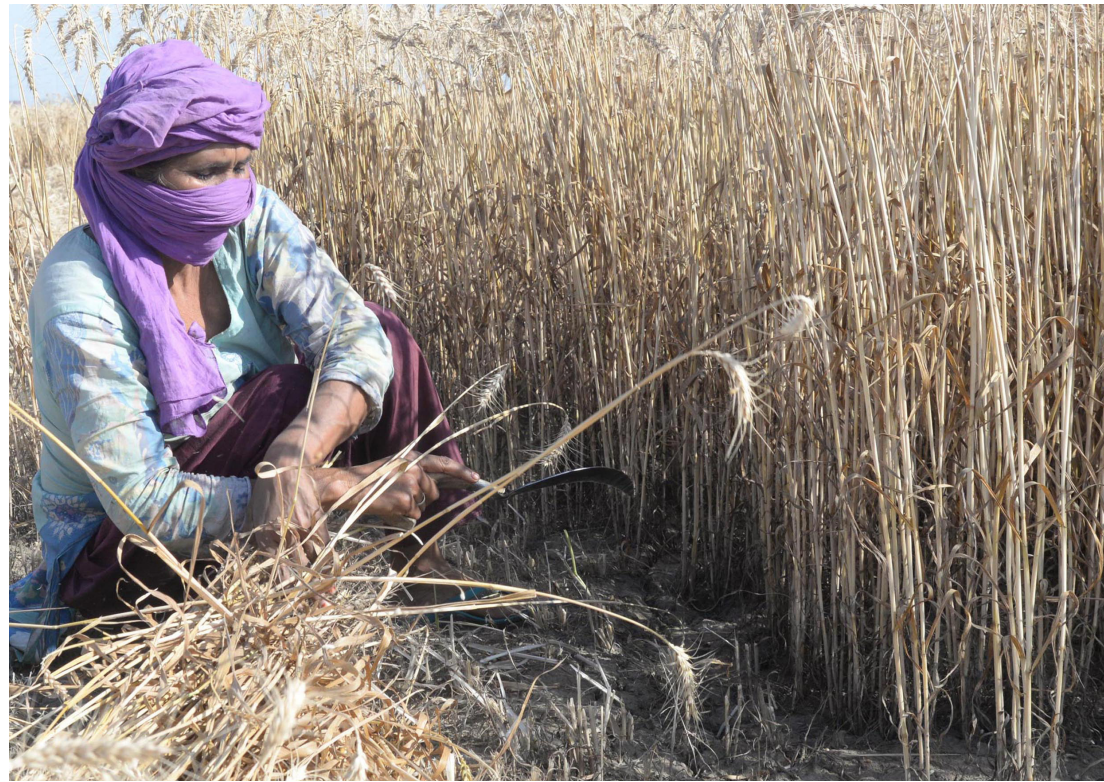
LAHORE: A woman busy in wheat harvest in the outskirts of Lahore.

vailing situation. AGP assured the bench that he will convey the court's concerns to the PM who is holding a high-level meeting on COVID-19 today (Monday). The bench has also set aside Punjab government's directive for obtaining corona clearance certificate before entering the province. The court has also sought details from Sindh government regarding the expenditure of Rs80 million to distribute ration.