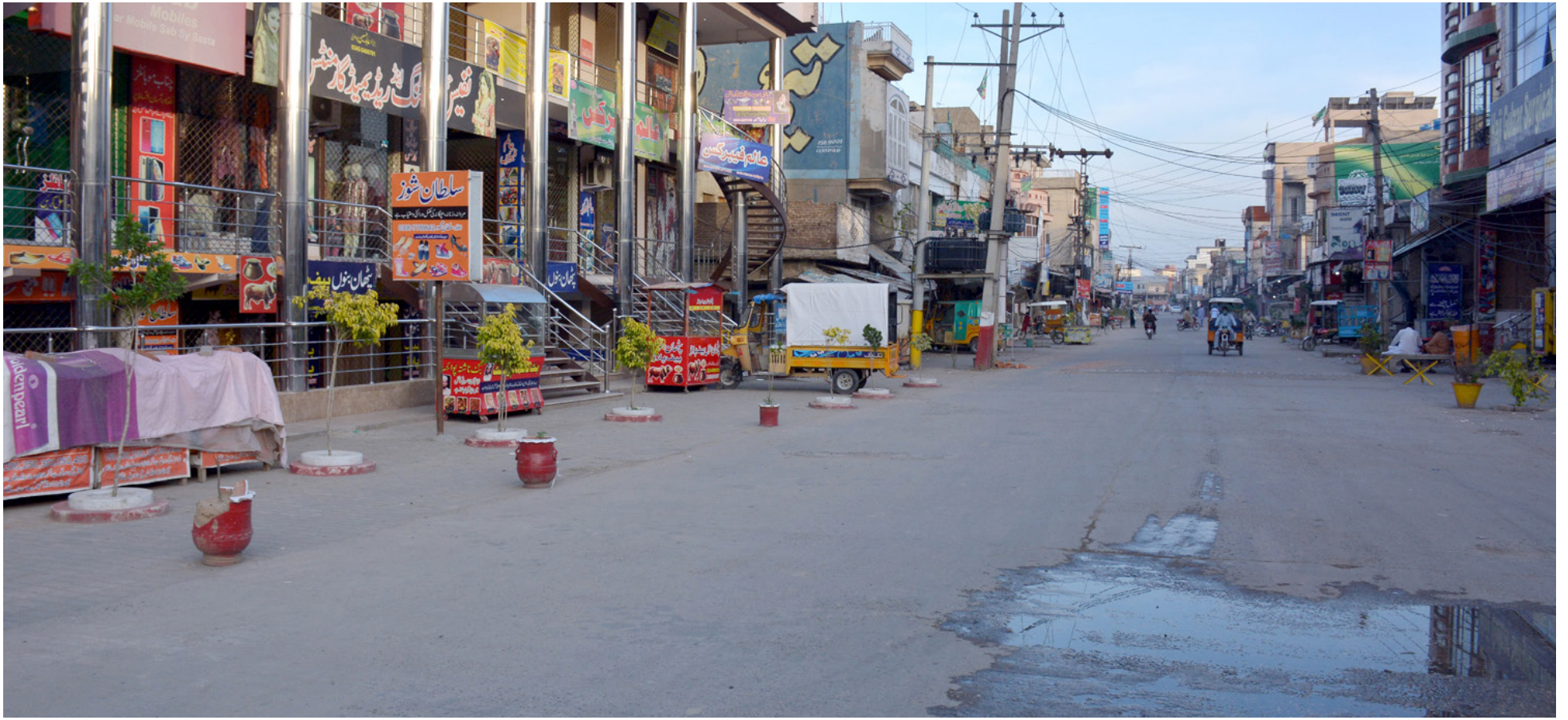
LALAMUSA: A view of main bazar closed due to lockdown.

PESHAWAR: The federal government has made all necessary arrangements for the safe return of Pakistanis stranded in Afghanistan via Torkham border. Officials in KP government told APP that initially 1,000 Pakistanis would be returned back from Afghanistan and would be quarantined in Landi Kot and Jamrud in Khyber district. They would be provided foods, healthcare and other necessary facilities in these centres upon their return to the home country.