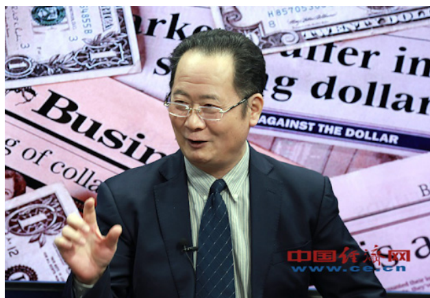
While implementing the lockdown measures, the government has been seriously considering and taking effective

He noted that about 40% of Pakistan's population lives below the extreme poverty line. A large number of poor people flock into cities, resulting in the increasing number of slums in major cities. Karachi, for example, is the most populous city in Pakistan, with an annual population increase of 800,000 and most of the new arrivals live in slums. The Pakistani government and the whole society have been making great efforts to cope with the pandemic and solve the problems of poor people's livelihood.