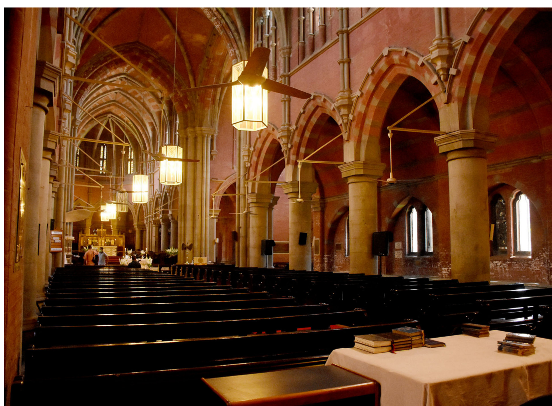
LAHORE: A view of Church a Christians stayed at home on the occasion of Easter.