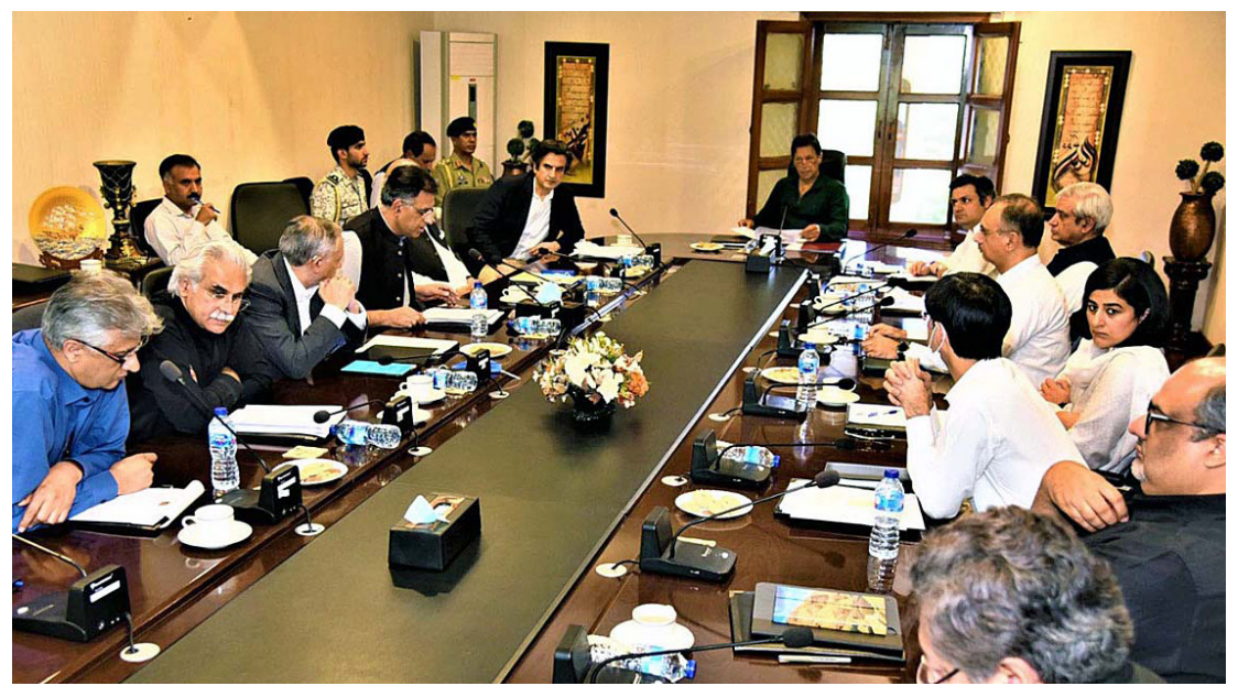
ISLAMABAD: PM Chairs meeting on COVID-19.

Noting the United Nations Secretary-General's call for action, the Prime Minister also urged world leaders to step up measures to help developing countries to overcome disastrous impacts of COVID-19. He proposed that the developing countries be provided with fiscal space and financial relief through enhanced debt relief and restructuring and other additional measures that could help them manage the unfolding crisis.