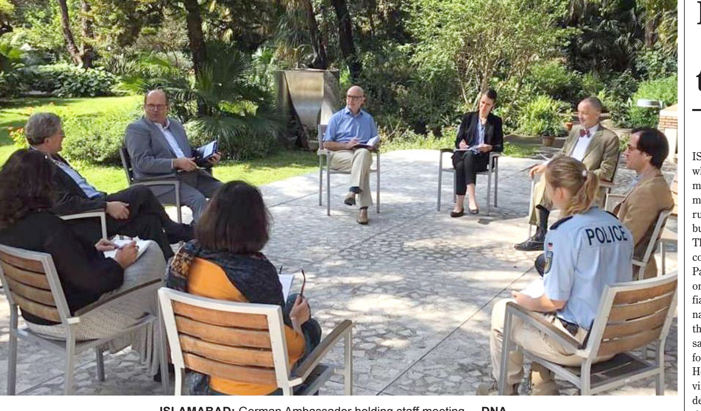
ISLAMABAD: German Ambassador holding staff meeting.