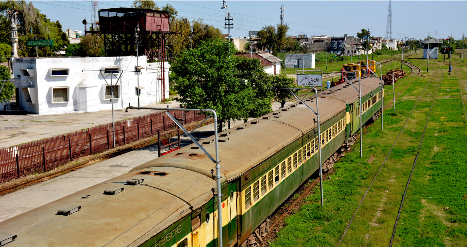
LALAMUSA: A view of Lalamusa railway station presenting a dreary look due to lockdown.