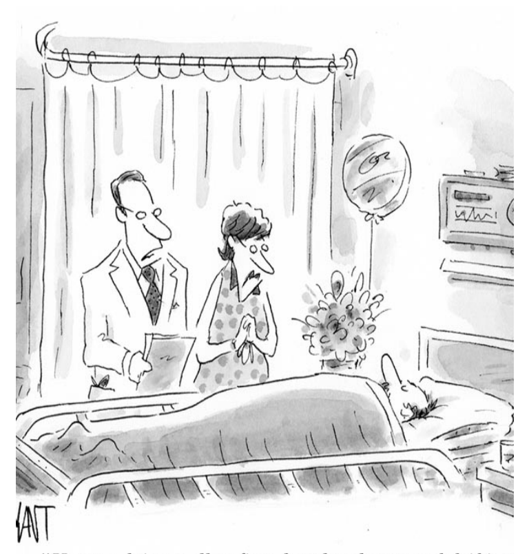
"He was doing well at first, but then he started drifting in and out of health coverage."

Email: dailyisbpost@gmail.com Phone: 051-2266165 / 051-2261960 Off: Awan Plaza, Block 18-A, G-8 Markaz Islamabad