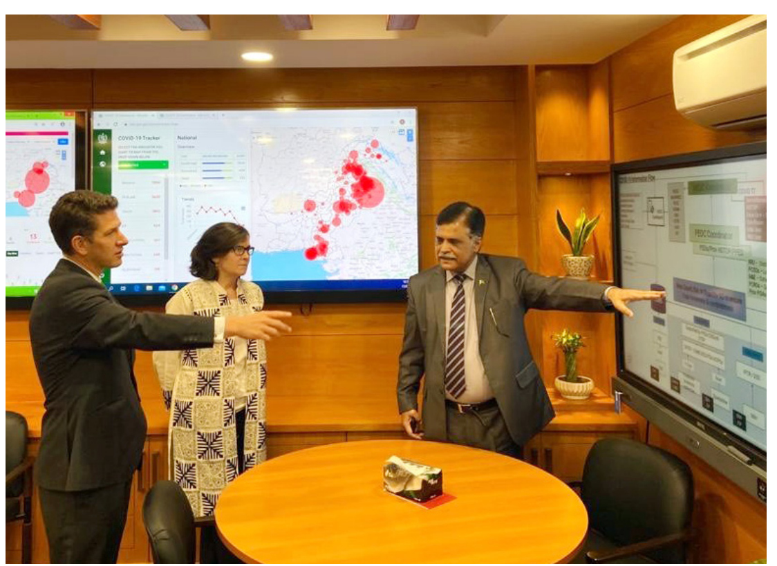
ISLAMABAD: British High Commissioner, Christian Turner CMG visited COVID-19 National Emergency Operations Centre (NEOC).

SINGAPORE: Oil prices pushed higher Friday as President Donald Trump's plan for a reopening of the virus-battered United States offset worries about a devastating supply shock triggered by the pandemic. Brent crude, the international benchmark, was up nearly three percent in Asian trade at $28.65 a barrel while US benchmark WTI rose 0.6 percent to $19.99 a barrel - but still around its lowest level since 2002.