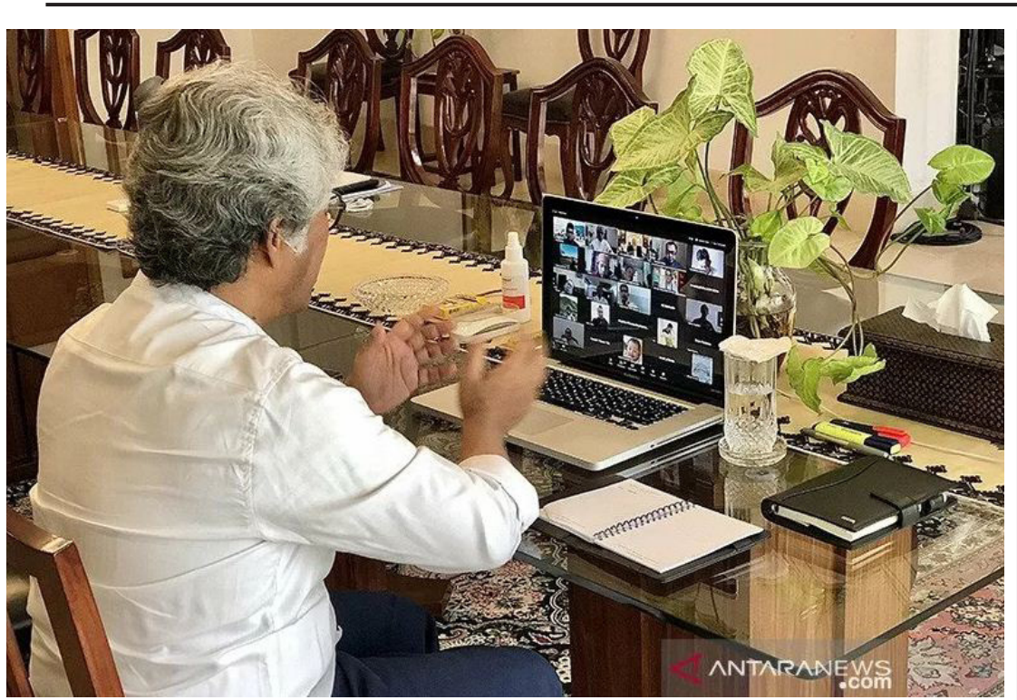
ISLAMABAD: Ambassador of Indonesia Iwan S Amri performs official duties from home.

She mentioned that Indian occupation forces recently committed 765 ceasefire violations resulting in several casualties. In 2019, India violated 3,351 times through indiscriminate firings at Line of Control and Working Boundary.