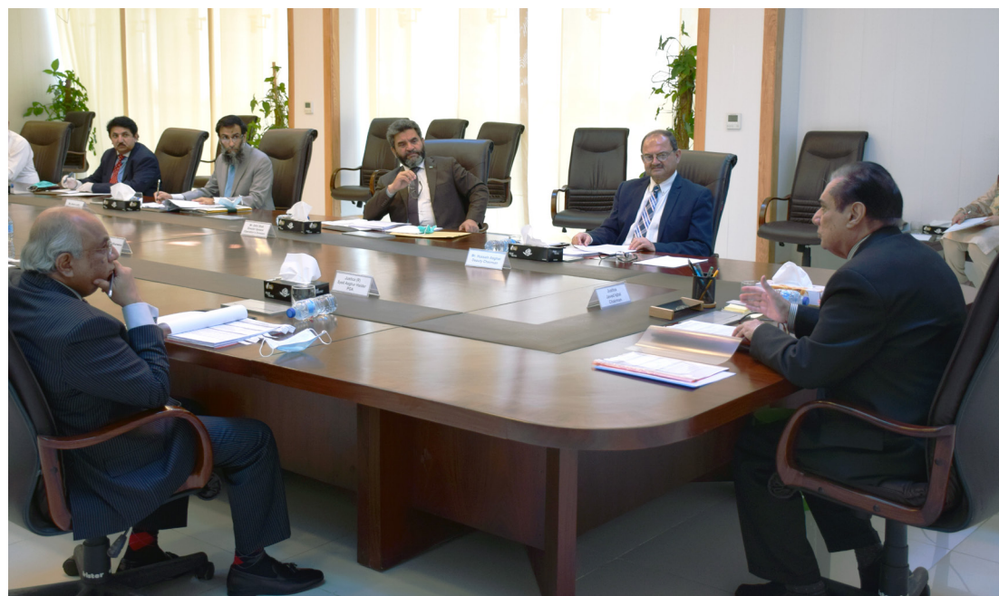
ISLAMABAD: Justice Mr. Javed Iqbal, Chairman NAB chairing Executive Board Meeting of NA at NAB Headquarters.

During the concert, which will be held with wonderful scenes of Istanbul in the background, works from both Classical Turkish Music and Classical Western Music will be performed, while the music will be accompanied by messages of love and unity belonging to important thinkers of the Eastern and Western world ranging from Yunus Emre, Mevlana, Hacı Bektaş-ı Veli and Pir Sultan Abdal to Immanuel Kant, Thomas Aquinas, and Alphonse de Lamartine.