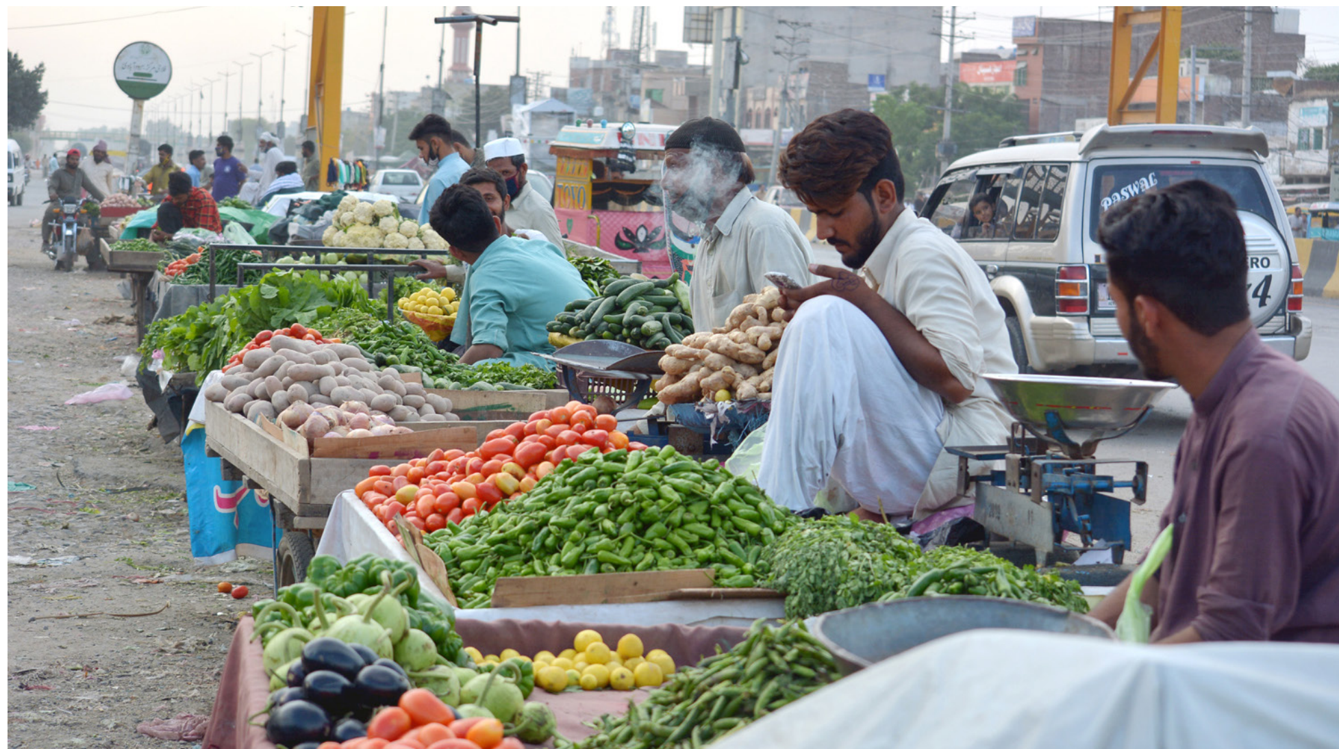
LALAMUSA: Vendors selling vegetables in Lalamusa Sabzi Mandi.

ISLAMABAD: The meeting of Development Working Party (DWP) of Indus River System Authority will be held on April 30 for the consideration and approval of PC-1 for installing telemetry system at seven key sites. Earlier, the meeting was scheduled to be held here on Tuesday. However, now the meeting has been rescheduled for April 30, sources told APP here. The meeting was convened to accord approval to PC-1 of the telemetry system for ensuring water distribution among the provinces in transparent manner, they said. — APP