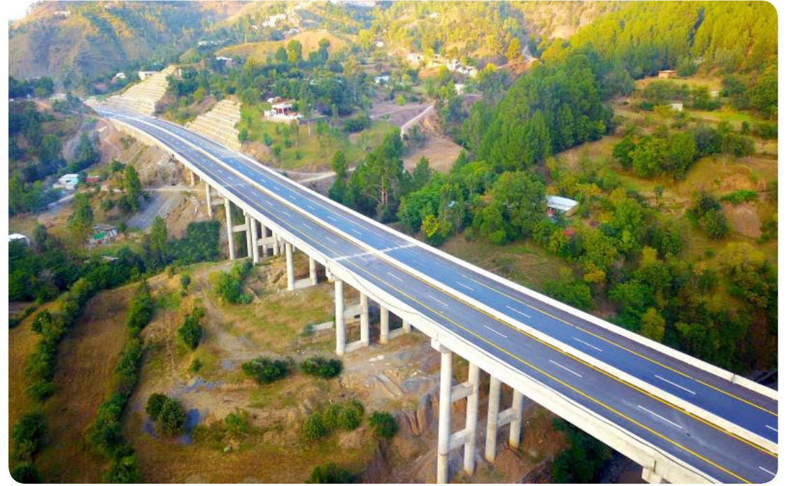
ISLAMABAD: A view of CPEC highway Havelian Thakot section which has been completed.

ISPR DG said that India is promoting the ideology of Hindutva and Rashtriya Swayamsevak Sangh (RSS) by breaking the international laws. Talking about lockdown he said smart lockdown shall remain in place. He said only those areas shall be closed where virus cases shall be reported. He made special mention of Chinese support and thanked Chinese authorities for extending whole hearted support to Pakistan in this difficult time. He told that China had already sent huge quantities of medical supplies adding Chinese doctors were also in Pakistan to help Pakistani doctors fight against this disease.