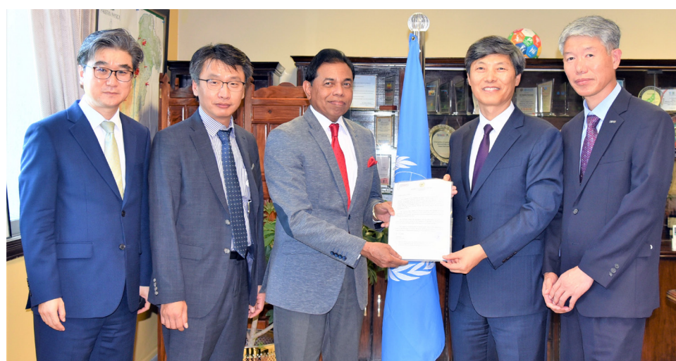
extraordinary burden on existing healthcare facilities in Pakistan and support from countries like South Korea are necessary to strengthen the country's existing response capacity in pri-