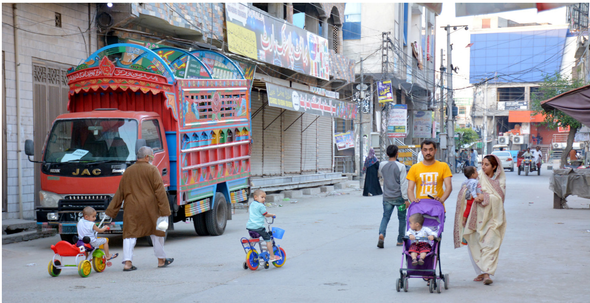
LALAMUSA: A family walks through the main bazar that presents a dreary look because of lockdown.

He said under the PM's reforms programme Rs4000 would be given to each farm owner for breeding and protection of calves from slaughtering so that healthy meat could be made available in abundance in market. The minister said the programme would continue for four-year under which farm owners in 16 districts of the province would be benefited, adding that farm owners would be encouraged to feed the calves till the age of slaughtering so that meat production could be increased. - APP