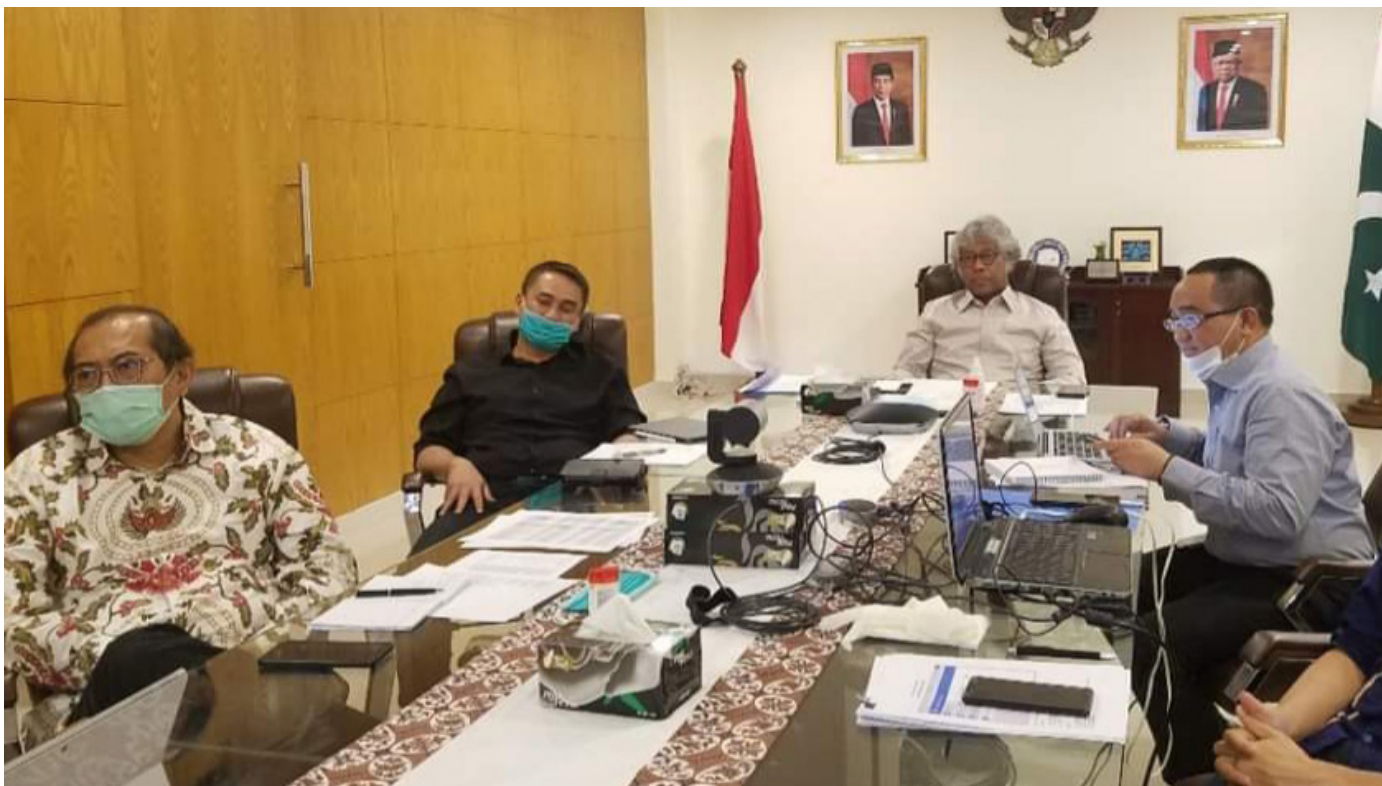
ISLAMABAD: Ambassador of Indonesia Iwan Amri and his staff holding a video conference. - DNA

ISLAMABAD: The standard operating procedures (SOP) of Social Distancing was fully implemented in Taraweeh and other prayers at mosques in Wana, South Waziristan district with the support of ulema. In pursuance with instructions of provincial government and following the directions of Deputy Commissioner South Waziristan HameedUllahKhan, AC Wana AmirNawaz held meetings with Ulema at Wana for implementation of SOPs for Taraweeh and prayers. - APP