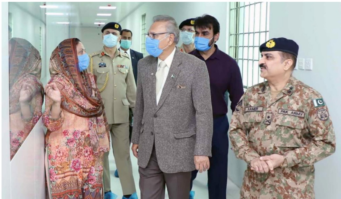
ISLAMABAD: President of Islamic Republic of Pakistan, Arif Alvi visited the National Institute of Health (NIH), on Monday.