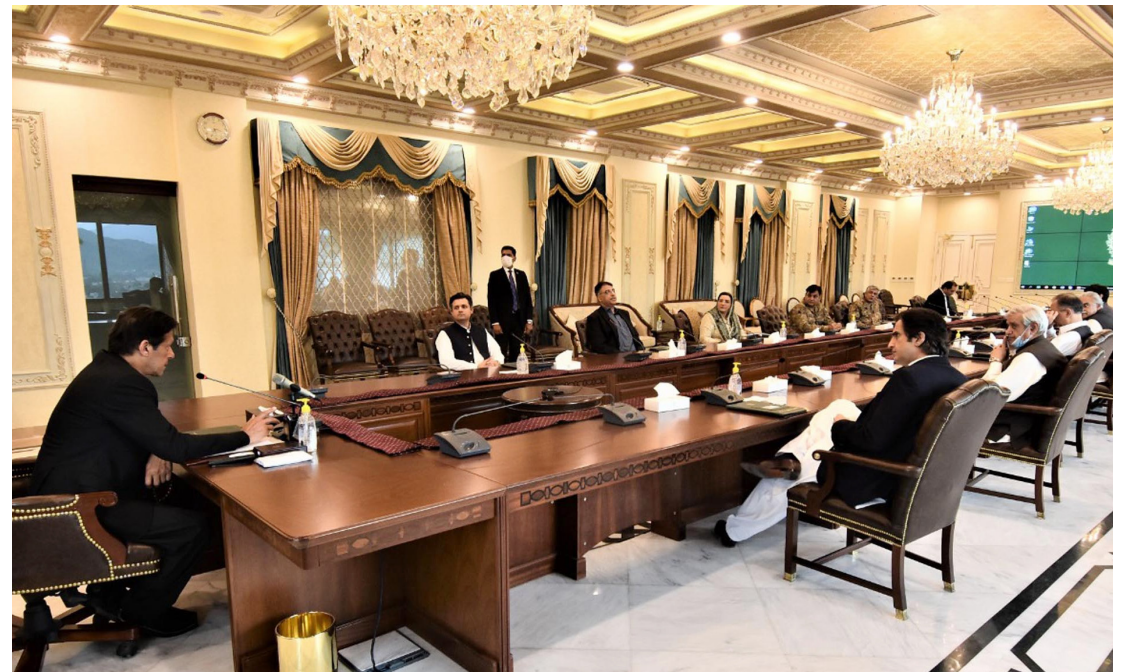
ISLAMABAD: Prime Minister Imran Khan chairs a briefing on COVID-19.

heavy losses because thousands of trucks of Pakistani traders, carrying perishable consignment of rice, potatoes, vegetable medicines and table eggs, cattle & poultry feeds, small chicks, paints and other miscellaneous items have been stucked up the on Pak Afghan borders for which advance payments have already been deposited in the bank.