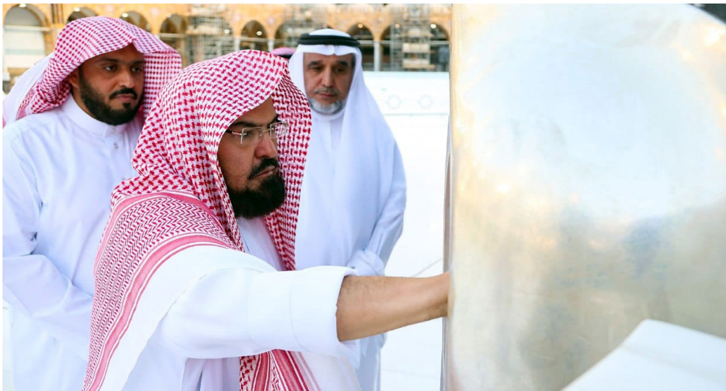
MAKKAH: Imam e Kaaba, Sheikh Sudais putting traditional perfume on Hajr-e-Aswad.

MAKKAH: Dr. Abdulrahman Al-Sudais, the president of the General Presidency of the Two Holy Mosques, on Monday joined workers at the Grand Mosque in Makkah as they washed and sterilized the Kaaba and Maqam Ibrahim before the call to night prayer. In line with recommendations and instructions from the health authorities, a range of precautionary measures are in place at the mosque to prevent the spread of COVID-19, including maintaining a safe distance between worshippers. The cleaning is one of a number of operations organized by the General Presidency, which also include the preservation of the black stone and the Kiswa cloth.