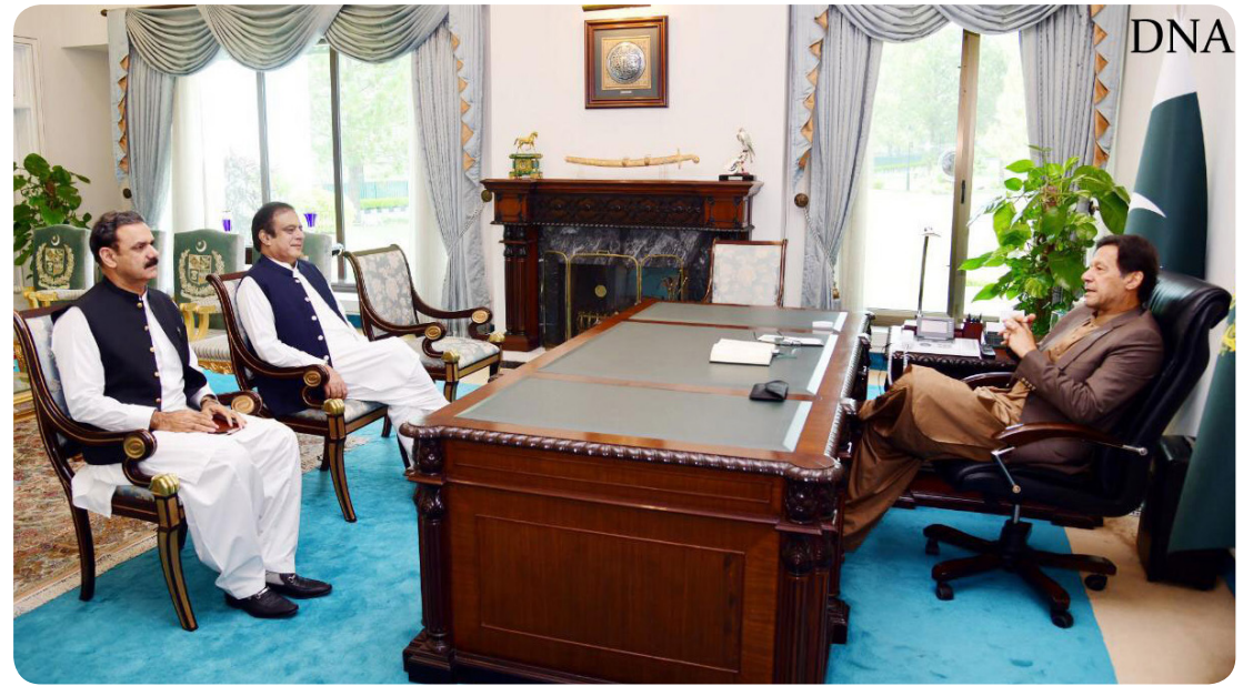
ISLAMABAD: Newly appointed Federal Information Minister Senator Shibli Faraz and SAPM Lt. Gen (R) Asim Saleem Bajwa called on PM Imran Khan.

ical supplies to Pakistan on April 2. On April 5, the second batch of 11 metric tons of medical supplies provided by the UAE arrived in Islamabad. To date, the UAE has provided more than 320 metric tons of aid to over 30 countries, supporting nearly 320,000 medical professionals in the process.