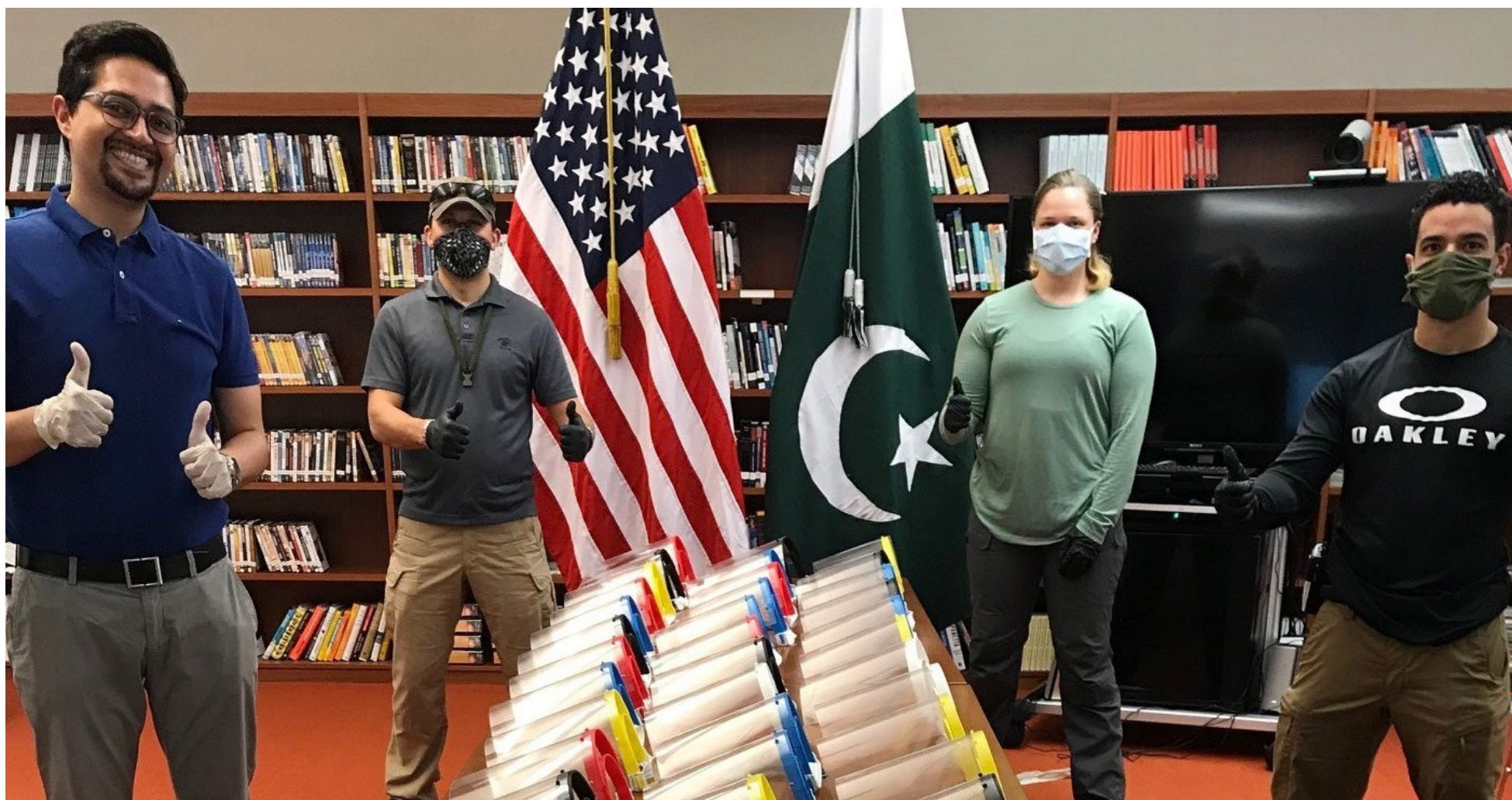
ISLAMABAD: American Center has prepared 3D printed 50 face shields to protect Islamabad's medical workers from coronavirus.

ISLAMABAD, Apr 28 (APP):The footwear exports witnessed an increase of 15.86 percent during the first three quarters of current financial year (2019-20) as compared to the corresponding period of last year. Pakistan exported footwear worth US $104.351 million during July-March (2019-20) against the exports of $90.069 million during July-March (2018-19), showing a growth of 15.86 percent, according to the latest data of Pakistan Bureau of Statistics (PBS). Among the footwear products, the exports of leather footwear increased by 11.29 percent as it surged from $79.282 million last year to $88.232 million during the current year. The canvas footwear exports of the country stood at just $ 0.344 million during the current year against $ 0.078 million during last year, showing increase of 341.03 percent. — APP