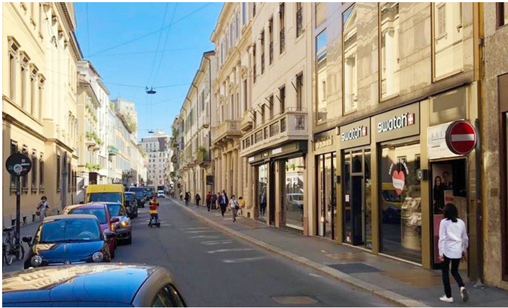
MILAN: Most of the shopping centers in Milan, Italy have reopened.

countries including Saudi Arabia, Turkey, Iran, Azerbaijan, Qatar, Malaysia and Egypt welcomed Pakistan's proposal and need for a concerted OIC position on Islamophobia at the United Nations. The remarks made by the UN Secretary-General indicate that the OIC will pursue Pakistan's proposal for collective action to counter Islamophobia. As a Pakistani diplomat remarked, no Indian puppet can prevent OIC countries from condemning the rising Islamophobia of India's Hindu extremists.