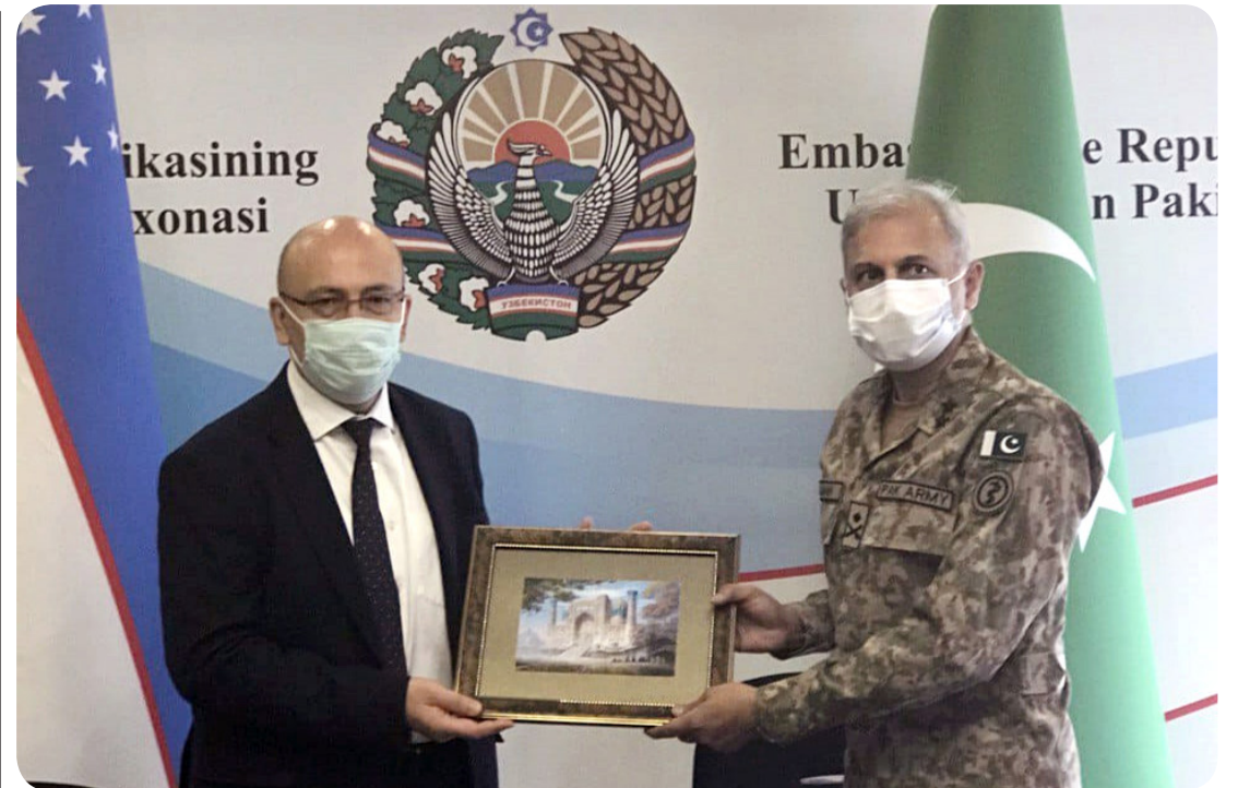
ISLAMABAD: Ambassador of Uzbekistan Furqat Sidikov presenting a souvenir to Pak Army officer on the occasion of video conference among Pakistani and Uzbek medical experts in the wake of COVID 19.

salary protection of media workers. When asked about the situation in occupied Jammu and Kashmir, the Information Minister said the government has effectively highlighted the lingering dispute at the world forums including the United Nations. Shibli Faraz expressed the commitment to transform the Information Ministry as per the modern requirements. He said our plan is to enhance its outreach to the protection of the national interests and image of the country.