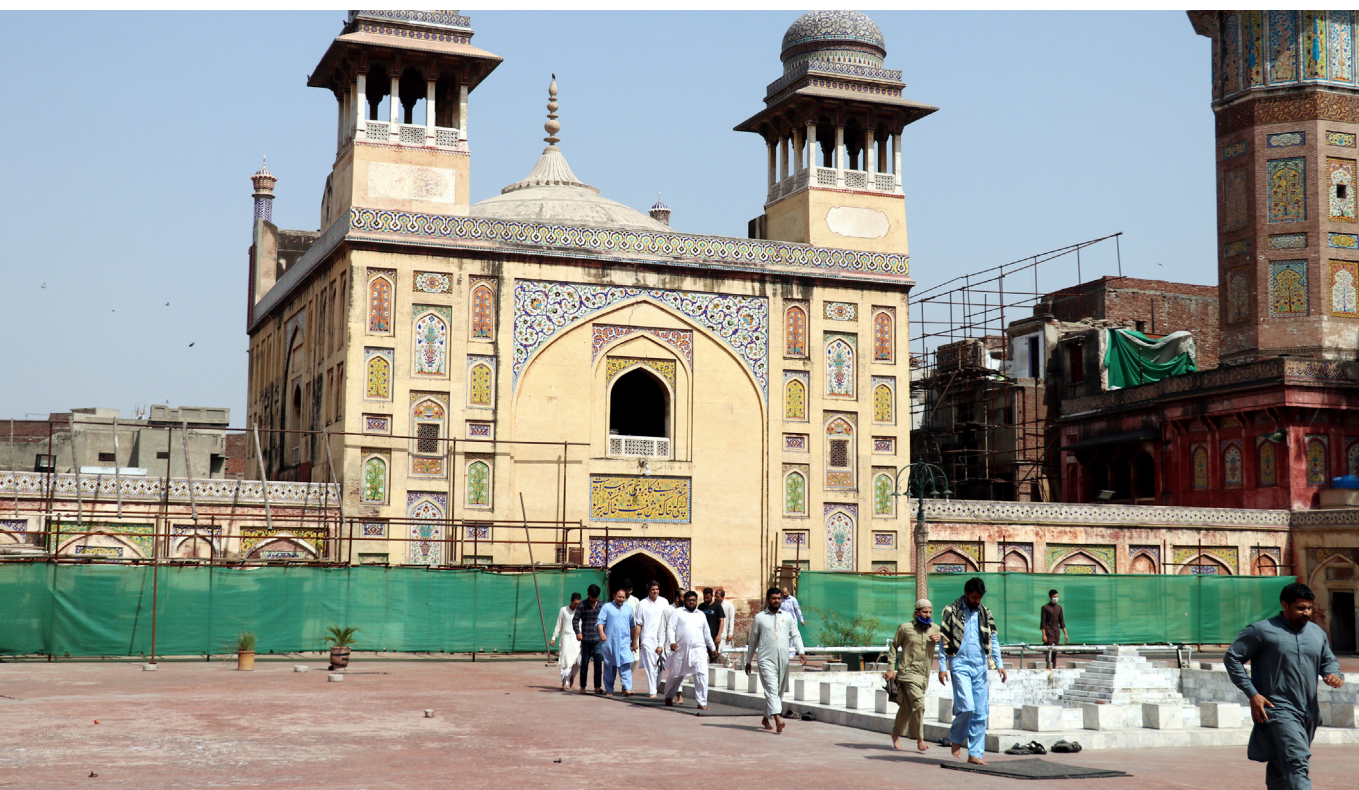
LAHORE: People leave Masjid Wazir Khan after offering Juma prayers. - Shahbaz Sindhu

Enterprises involved in production of electro-mechanical, hardware, building materials, anred epidemic prevention materials etc. have been invited to participate the cloud exhibition. A total of 84 enterprises from Shandong province rolled in the exhibition, and 28 Pakistani buyers were invited to hold "one-to-one" negotiations through precise matching, and 124 meetings have been held between the two sides.