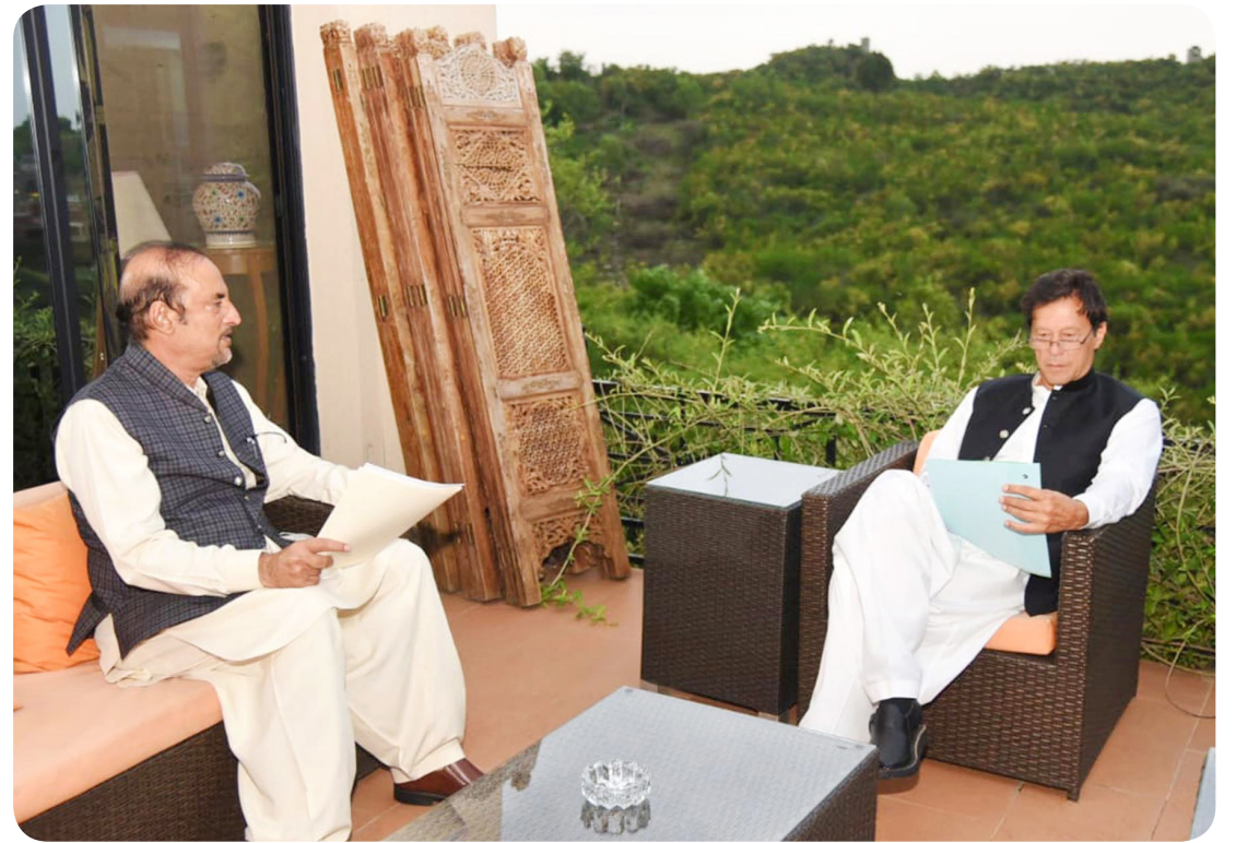
ISLAMABAD: Advisor to PM on Parliamentary Affairs Dr. Babar Awan calls on Prime Minister Imran Khan.

ers and directed the provinces to get help of district administrations to help locate those who are artificially inflating prices. He said that prices of items will be brought down under any circumstances, and strict action will be taken against those who do not comply. The premier also directed the provincial governments of Punjab and Khyber Pakhtunkhwa to take measures for reducing inflation. PM Imran said that the government, with the cooperation of district administrations, will initiate action against illegal profiteering.