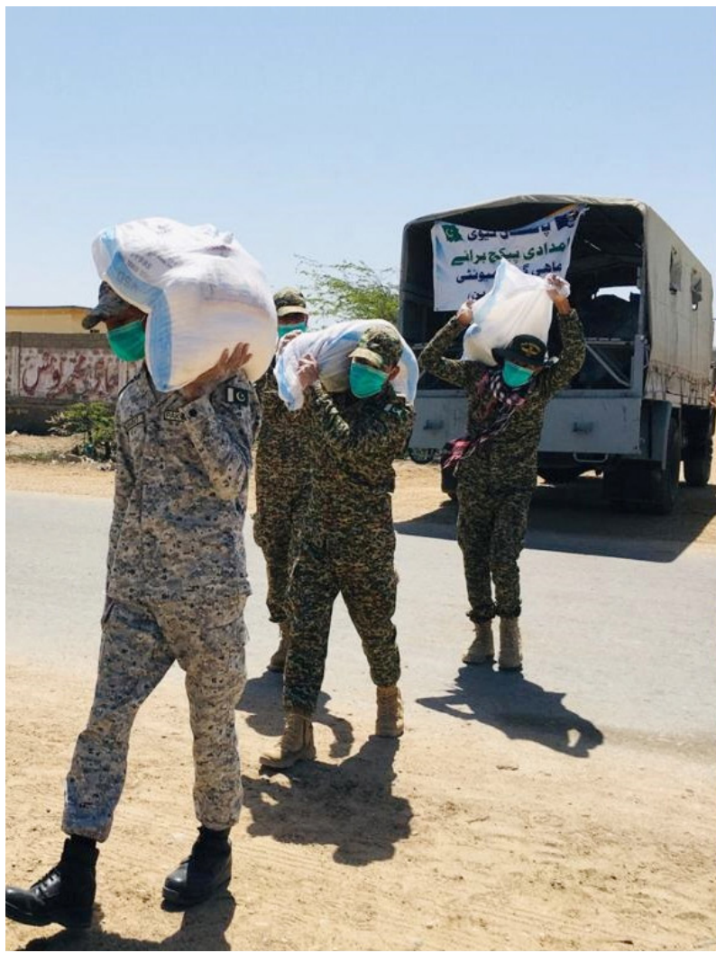
Pakistan Navy troops distributing ration bags during ongoing lockdown due to corona virus pandemic. — DNA

TEHRAN: Iran said Saturday there was a "clear drop" in the number of new coronavirus infections as it reported 802 fresh cases, the lowest daily count since March 10. The new cases brought to 96,448 the number recorded in Iran since it announced its first cases in mid-February. "This shows a clear drop in the number of new infections compared to recent weeks, despite our active testing," health ministry spokesman Kianoush Jahanpour said on state television. He added that 77,350 of those hospitalised have since been discharged, claiming it is a "one of the highest recovery percentages in the world." — APP