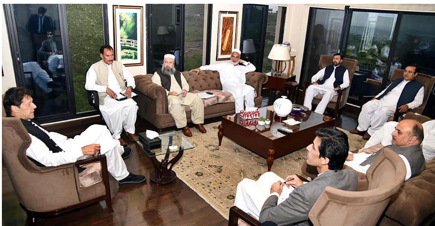
ISLAMABAD: MNAs from Malakand Division called on Prime Minister Imran Khan. - DNA

RAWALPINDI: Pak-Turk Maarif International School Junior Branch Sixth Road Rawalpindi has increased the fee of each child from four to five thousand - brazenly flouting Punjab's government's 20 percent fee cut orders. According to students, the school has also reduced the installments from 12 to 10 for the reason best known to them. The phenomenal increase has been made in the grab of shifting of child from one section to other. A number of parents talking to APP has asked the relevant authorities to take notice of the violation of Punjab orders and ensure implementation of 20 percent reduction in fee orders. - APP