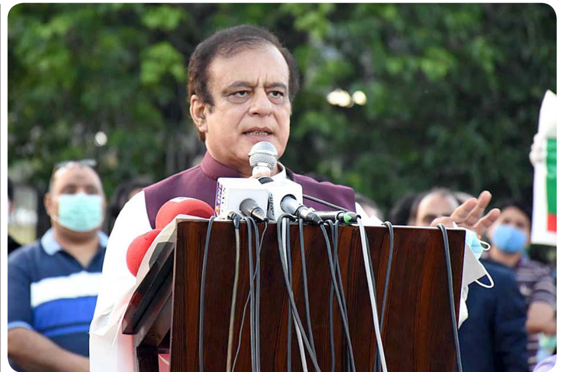
ISLAMABAD: Senator Shibli Faraz, Federal Minister for Information and Broadcasting addressing the participants of a media workers' sit-in in front of the Parliament House.

ernment sent 12,000 test kits, 300,000 masks, and 10,000 units of Personal Protective Equipment (PPE) to Pakistan along with $4 million to build a separate hospital for coronavirus patients. Pakistan has so far reported more than 19,000 confirmed cases and 340 deaths from the virus. China, on the other hand, has seen a reduction in the number of cases in the country with just two cases reported on May 2. Overall, the country has reported 82,877 confirmed cases of the virus and 4,633 deaths.