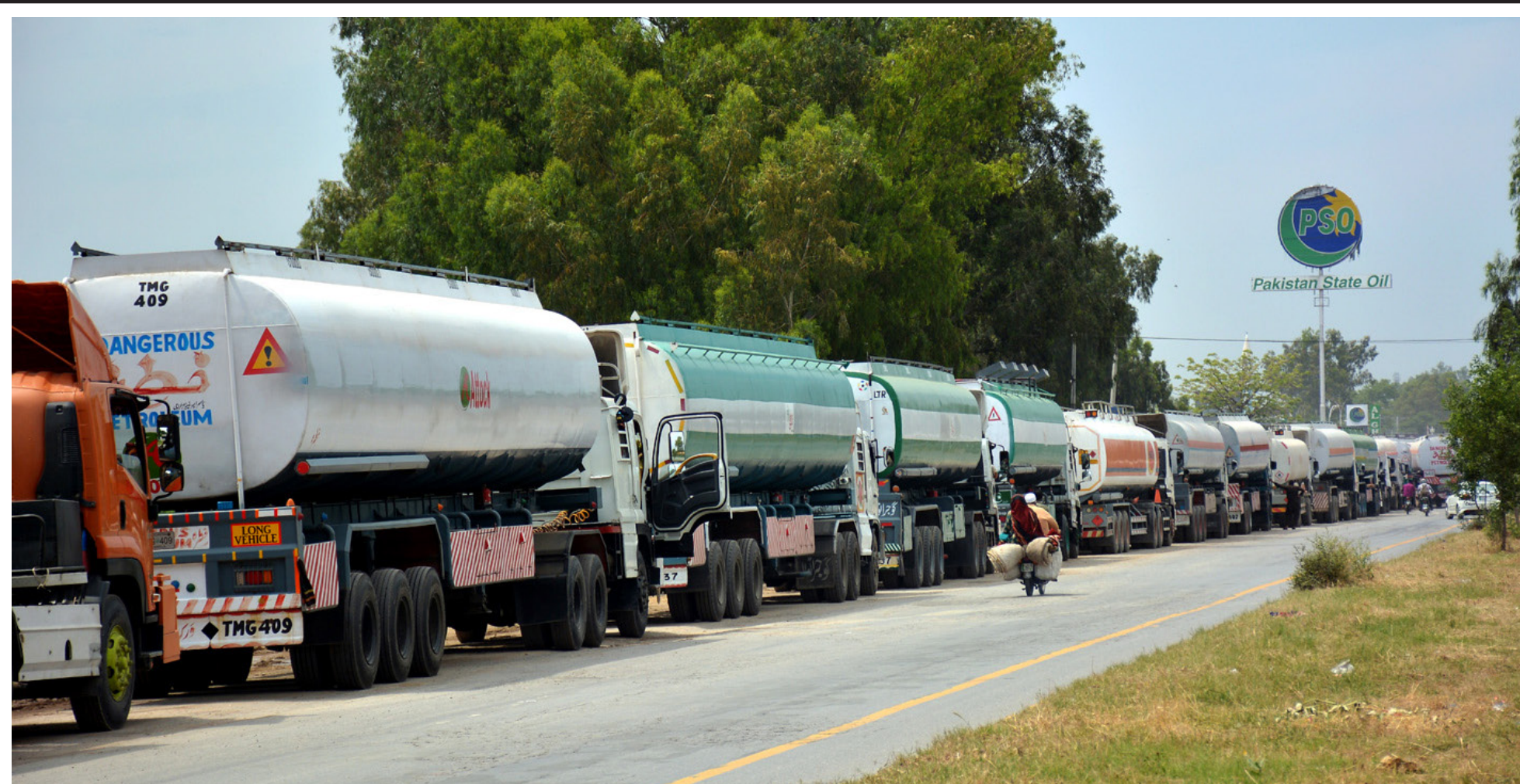
LALAMUSA: Oil tankers stand in queue to unload oil at various filling stations. - Khurshid Nadeem

ATTOCK: Marking International Fire Fighters Day, district emergency