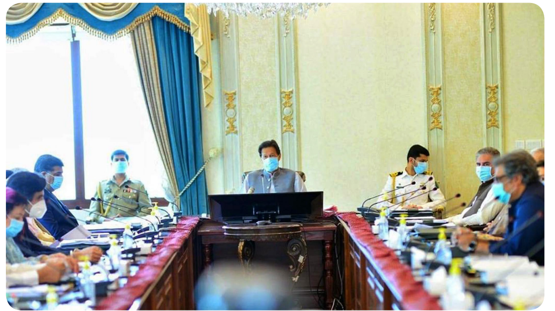
ISLAMABAD: Prime Minister Imran Khan chairs meeting of the Federal Cabinet in Islamabad.