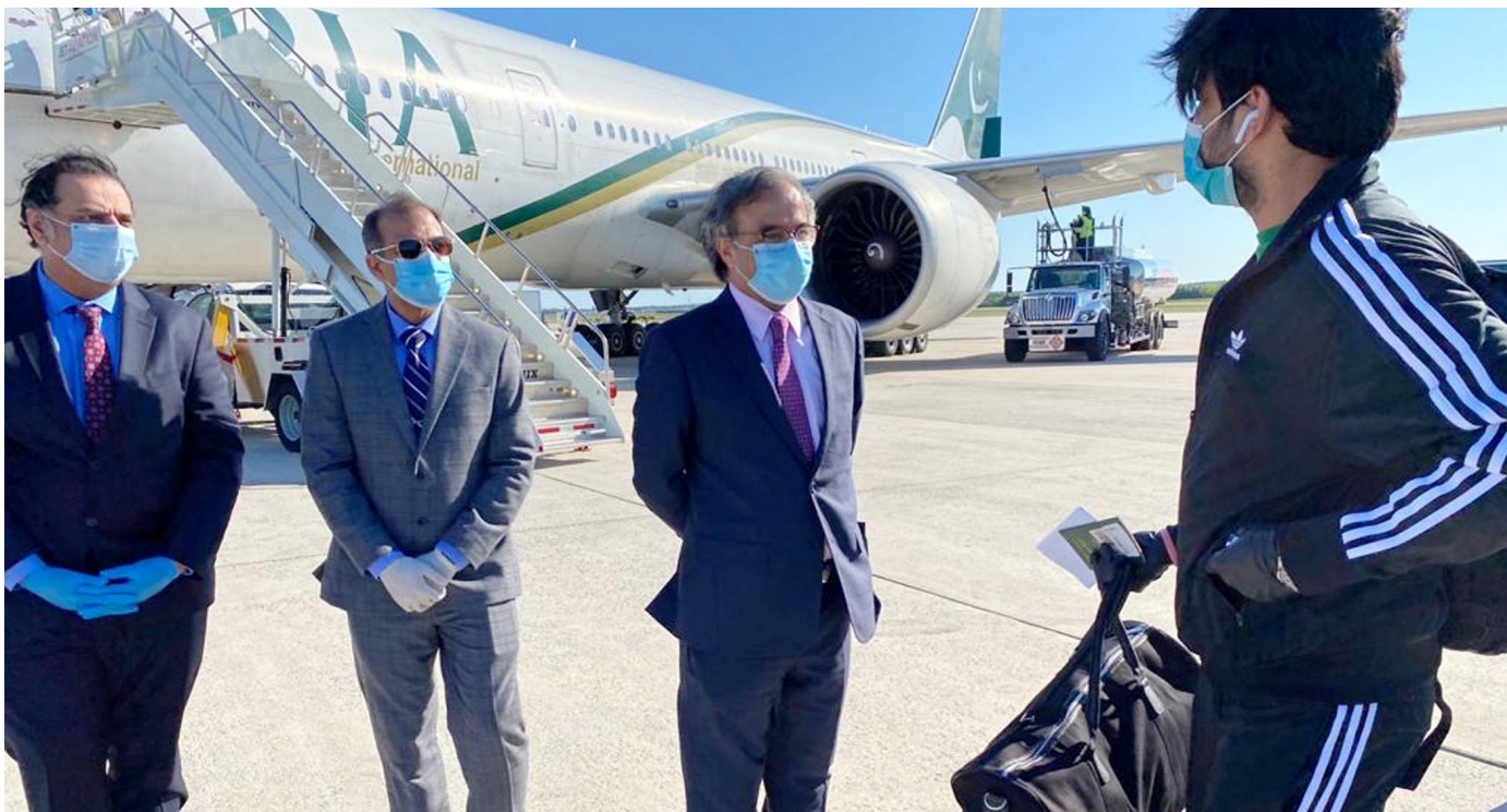
WASHINGTON: A special charter flight arranged by the Govt of Pakistan in collaboration with the Pakistan International Airlines (PIA) for repatriation of stranded Pakistanis from Dulles Intl Airport.

PARIS: Millions of people in France and Spain were set to embrace a relaxation of stay-at-home rules on Monday, but Britain extended its lockdown as countries plot their way tentatively through the coronavirus crisis. Fears of a second wave of the pandemic, which has killed more than 280,000 people worldwide and wrecked the global economy, stalked much of Europe and the world. With millions out of work and economies flatlining — including in the United States, where 20 million people lost their jobs in April — governments are desperate to reopen, but most are choosing a gradual approach. In France, people from Monday morning were able to walk outside without filling in a permit for the first time in nearly eight weeks, teachers will start to return to primary schools, and some shops — including hair salons — will reopen. — APP