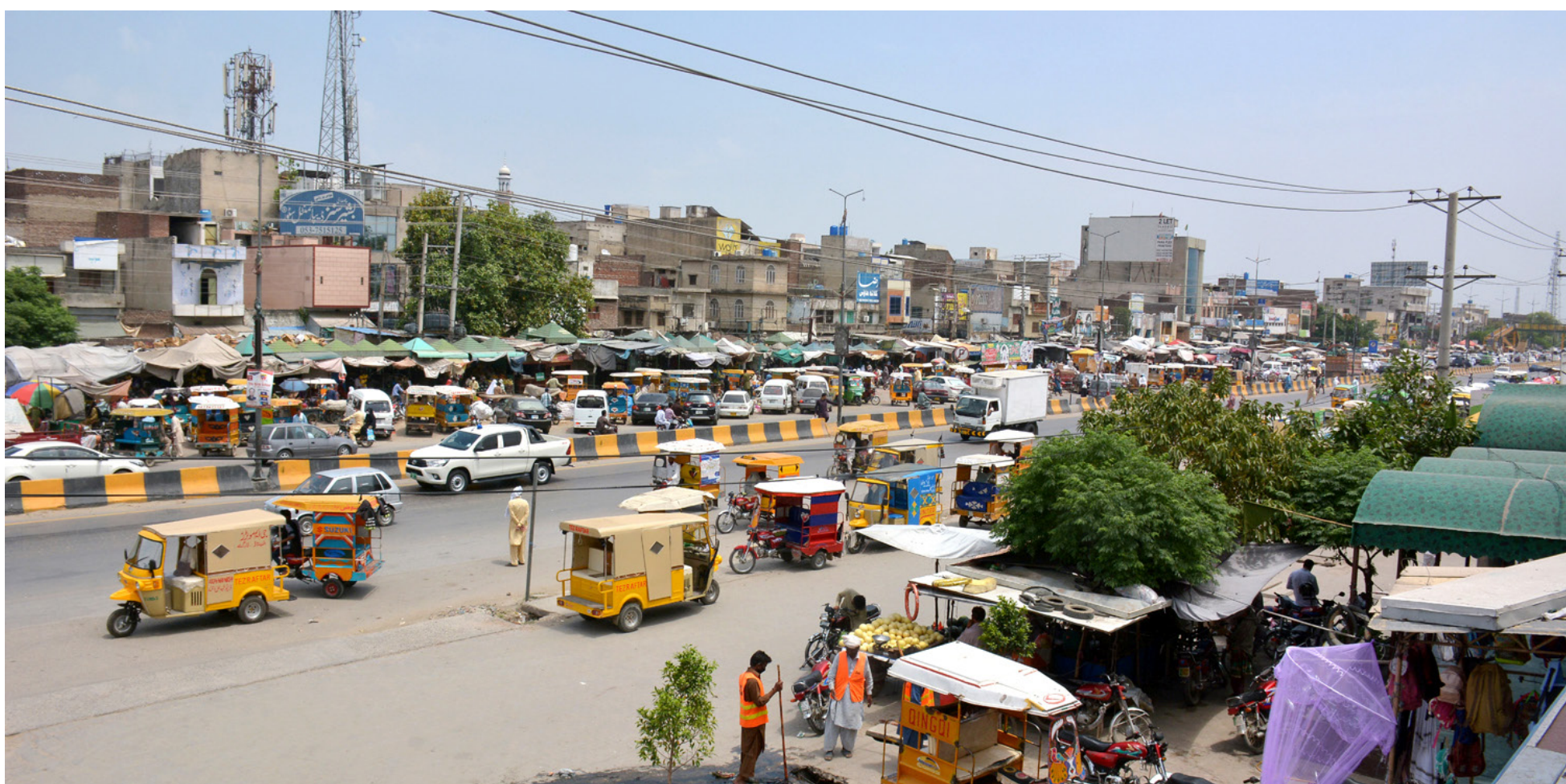
LALAMUSA: An aerial view of GT Road Lalamusa where hustle and bustle is seen after easing of lockdown. - Khurshid Nadeem

SEOUL: South Korea reported 27 more cases of the COVID-19 compared to 24 hours ago as of 0:00 a.m. Tuesday local time, raising the total number of infections to 10,936. After hitting the bottom at two on May 6, the daily caseload continued to rise to 12 on Friday, 18 on Saturday, 34 on Sunday and 35 on Monday respectively. It came as a cluster infection was found from clubs and bars at a multicultural neighborhood of Itaewon in Seoul. Of the new cases, five were imported from overseas, lifting the combined figure to 1,138. Two more deaths were confirmed, leaving the death toll at 258. The total fatality rate stood at 2.36 percent. - APP