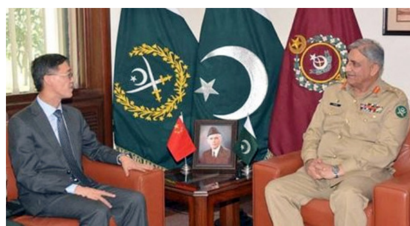
RAWALPINDI: Ambassador of China Yao Jing in a meeting with Army Chief General Qamar Javed Bajwa.