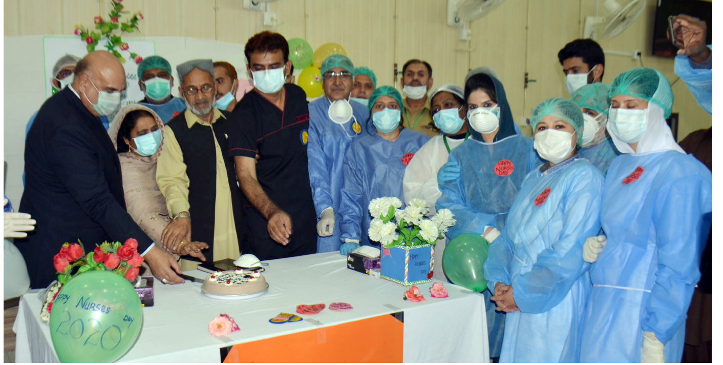
ISLAMABAD: Nurses cutting cake to celebrate Nurses Day.