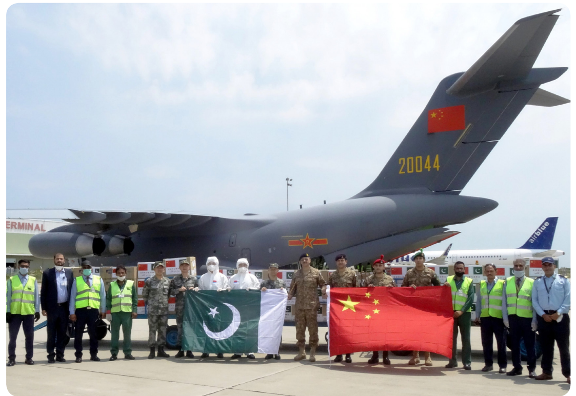
ISLAMABAD: 2nd batch of Chinese military aid arrived on Tuesday. - DNA