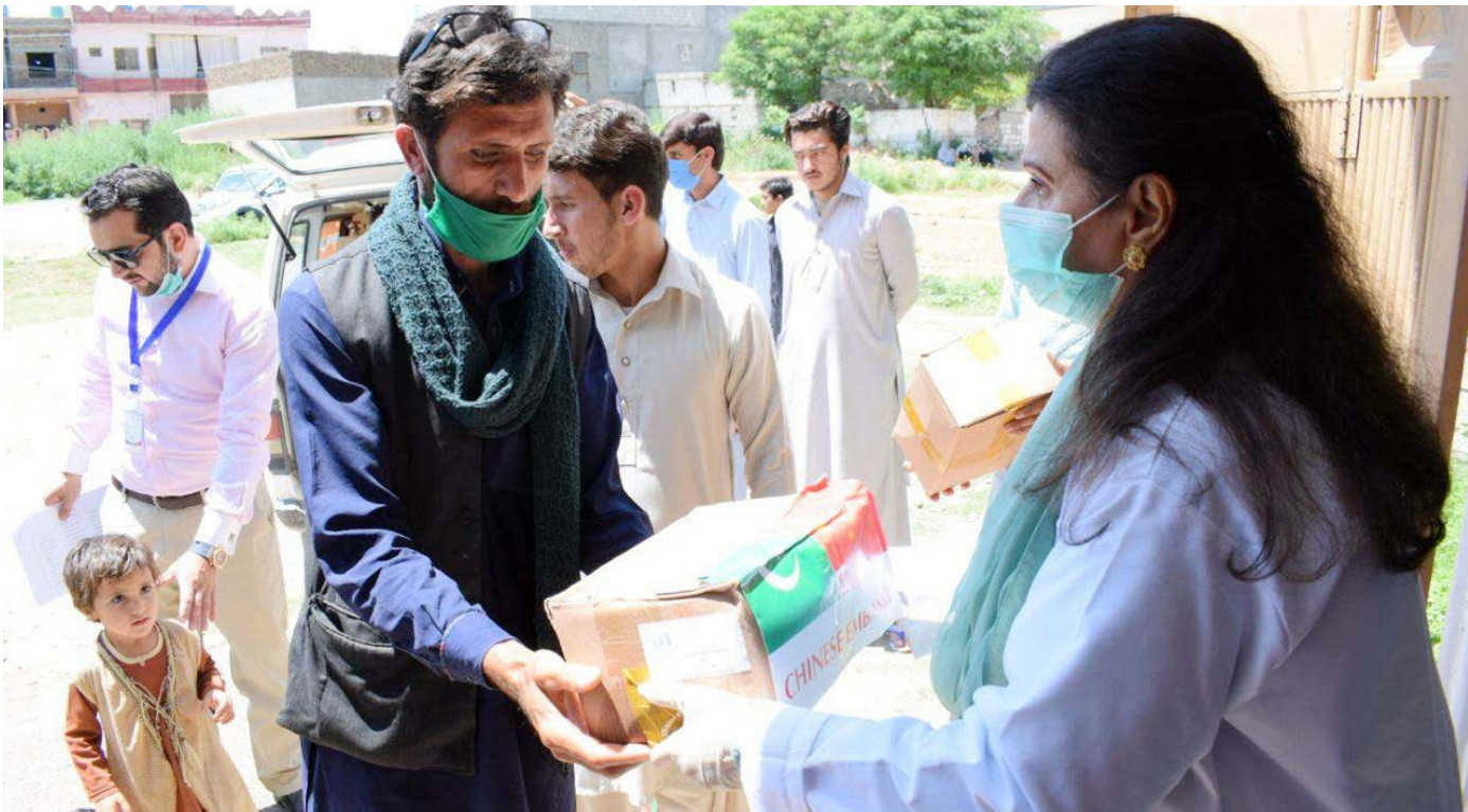
ISLAMABAD: Chinese embassy staff distributing relief goods among needy people.