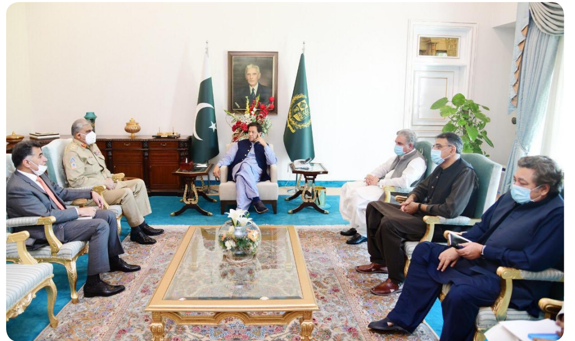
ISLAMABAD: Chief of Army Staff General Qamar Javed Bajwa, DG ISI and others in a meeting with Prime Minister Imran Khan.

of its commercial loans/borrowings. He also informed that Pakistan has the means and will to honor its commercial commitments. ECC also assigned the role of Chairman, to Mr. Hammad Azhar, being the Federal Minister for Industries and production, of the Committee to oversee the effective utilization of subsidies, Ramadan relief package and PM's relief Package of 50 billion by Utility Stores Corporation.