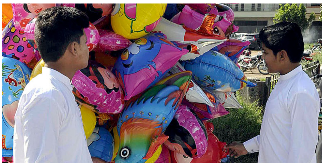
RAWALPINDI: A vendor displaying different kind of colourful balloons to attract the customers outside a Masjid.

The business leader informed that efforts to document the economy sucked a large portion of liquidity out of the economy that the package aimed to bring back through sweeping tax incentives, waivers and subsidies and the fixed-tax regime.