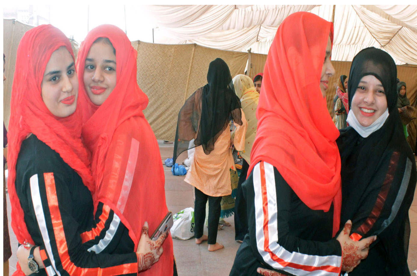
LAHORE: People hugging one another on Eid thus violating rules of social distancing.