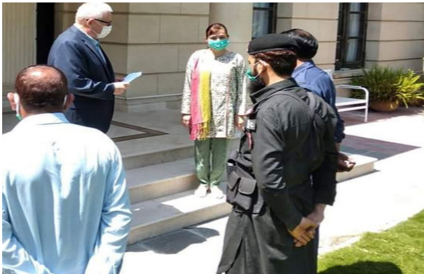
ISLAMABAD: Ambassador of Ukraine extending Eid greetings to the Pakistani staff of the Embassy.