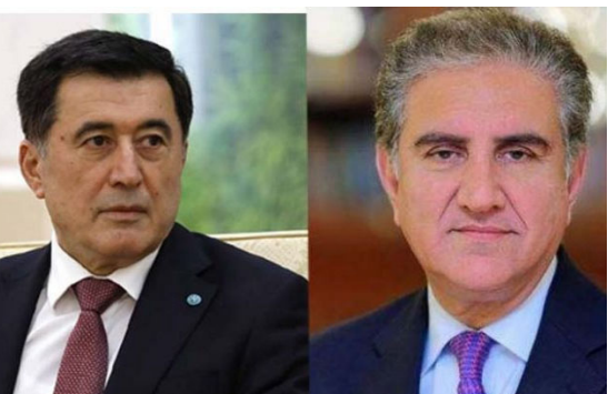
ister of Foreign Affairs of the Islamic Repub-

BEIJING: Following the Pakistan International Airlines aircraft crashed in densely populated area near Karachi's airport on Friday afternoon, the Secretary-General of Shanghai Cooperation Organizations Vladimir Norov has expressed condolences to the Min-