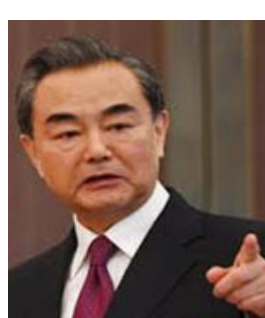
Afghan talks. About the peace and reconciliation process, he said that China viewed that the process should be Afghan-led

The Chinese foreign minister called on all factions to immediately cease hostility and reach an early agreement on the arrangements for intra