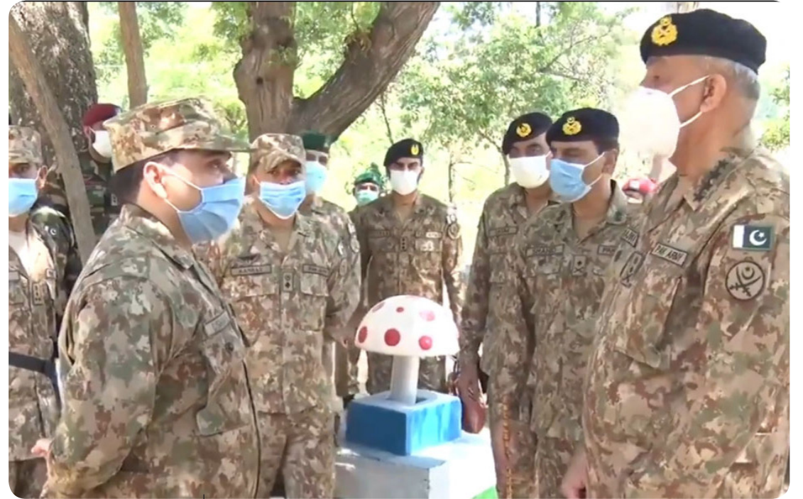
LOC: Army Chief General Qamar Javed Bajwa interacting with troops at Line of Control (LoC) on Eid day.

targeting innocent civilians across the Line. Kashmir is a disputed territory and any attempt to challenge the disputed status including any political cum military thought related to aggression will be responded with full national resolve and military might. Disturbing the stability matrix in South Asia can lead to dire consequences. Pakistan Army is fully alive to the threat spectrum and will remain ever ready to perform its part in line with national aspirations, COAS reiterated. Indian occupying forces can never suppress valiant spirit of Kashmiris who rightfully await plebiscite under UN resolution. Regardless of ordeal their struggle is destined to succeed, InshaAllah, COAS concluded.