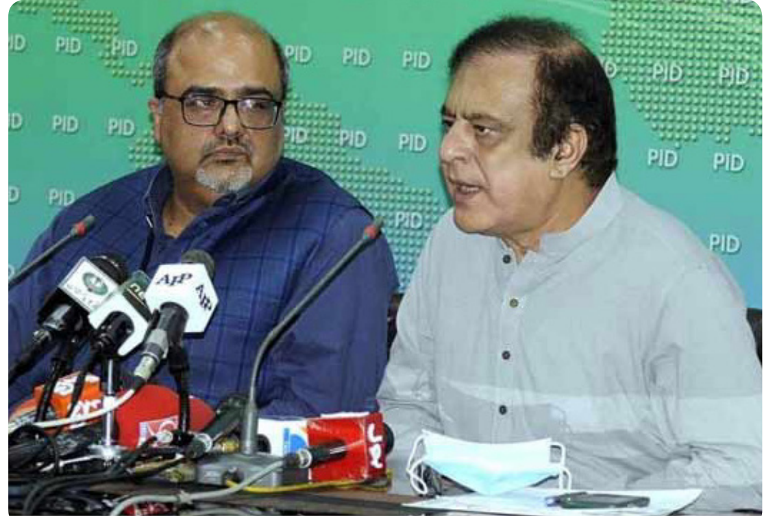
ISLAMABAD: Federal Minister Shibli Faraz and Shahzad Akbar giving details of findings of sugar inquiry commission.

owners pay amount to sugarcane growers even less than the support price. In addition, all sugar mills make cuts in the weight of sugarcane from 15 to 30 percent. Shahzad Akbar said Commission also found irregularities in the form of giving advance payments to farmers in the form of cash or commodity, which is akin to unregulated banking. He said PM Imran Khan also directed all government advisors to declare their assets to ensure transparency.