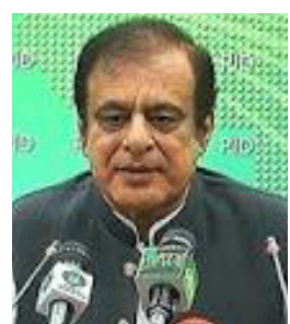
government took several steps to mitigate their sufferings.

emony organized by Pakistan Bait ul Mal in connection with distribution of ration packages amongst newspaper hawkers. He lauded Pakistan Baitul Mal for taking an active part in provision of relief to poor segments of the society. He said that daily wage earners and the working class were most affected by the lockdown and the