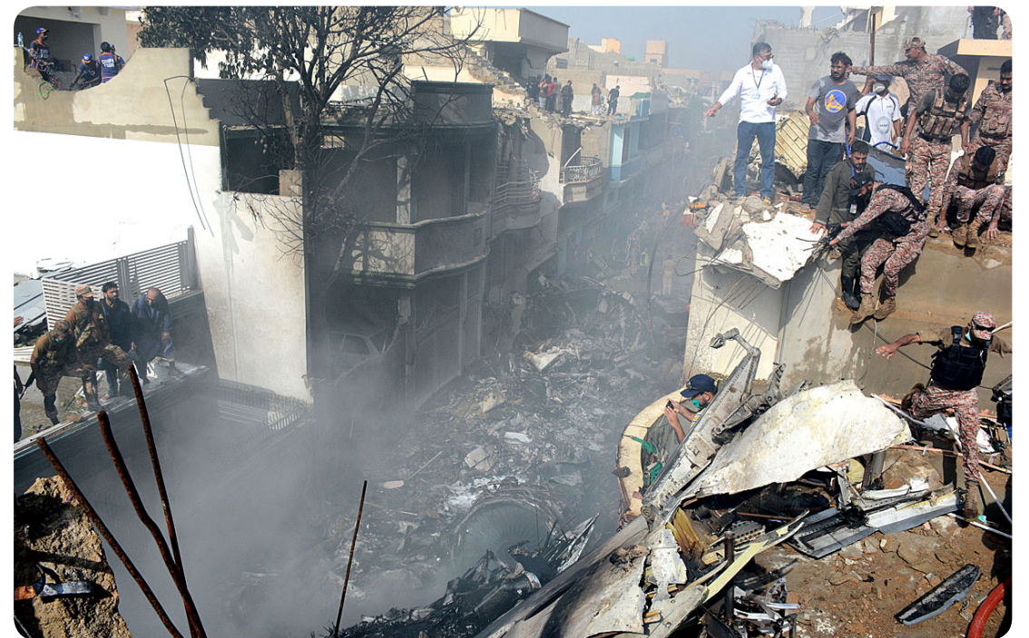
KARACHI: A view of damages near the spot as a Pakistan International Airlines (PIA) passenger flight PK-303 carrying 91 passengers and eight crew members crashed near the Jinnah International Airport just before landing.

debt. Moreover, the public debt obtained from China has a maturity period of 20 years and the interest is 2.34 percent. If grants are included, the interest value slides down to about two percent. The claims made by some of the commentators and public officials on Pakistan's debt obligations relating to CPEC are contrary to facts". It is reiterated that CPEC, a long-term project, has helped address development gaps in energy, infrastructure, industrialization, and job creation.