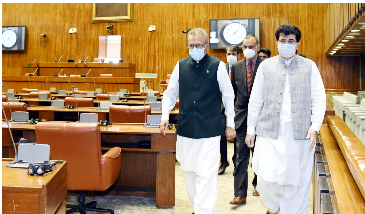
ISLAMABAD: President Dr. Arif Alvi visiting Parliament House to review arrangements for the forthcoming session on June 01, 2020.

War-ravaged Yemen, whose malnourished population has among the world's lowest immunity levels to disease, is divided between the Saudi-backed government based in Aden and its foe, the Houthi group in the north. The war has left tens of thousands of people dead, most of them civilians, and the UN says around 24 million Yemenis - more than two-thirds of the country's population - rely on some form of aid.