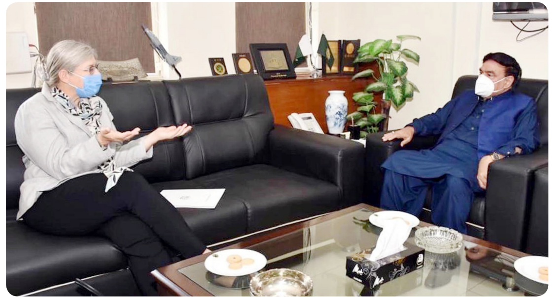
ISLAMABAD: Canadian High Commissioner Wendy Gilmour meets Federal Minister for Railways Sheikh Rashid at Ministry of Railways.

to his tweet while expressing gratitude to the stranded Pakistanis for their endurance amid the global pandemic (COVID-19). The SAPM also shared number of flights, arranged in previous and current phases to bring back the nationals from Saudi Arabia. According to the details, the government has airlifted 1,780 stuck nationals from Saudi Arabia through eight special flights, operated between May 23 and May 31.