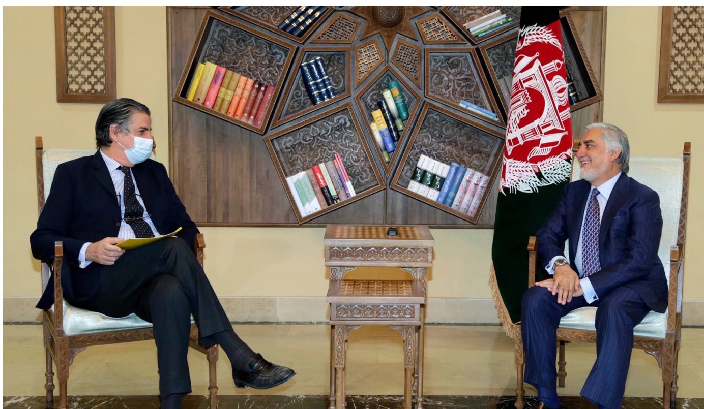
KABUL: Newly appointed NATO Senior Civil Representative Stefano Pontecorvo meeting with Abdullah Abdullah of Afghanistan.

needs to be an investment in social and psychological support for police so they can do their job properly." The demonstrations have spread overseas as major metropolitan cities including Berlin, London and Dublin have seen protests calling for justice in the death of Floyd. And in cases of instances of police violence, Dujarric reiterated the UN's stance, calling for thorough investigations.