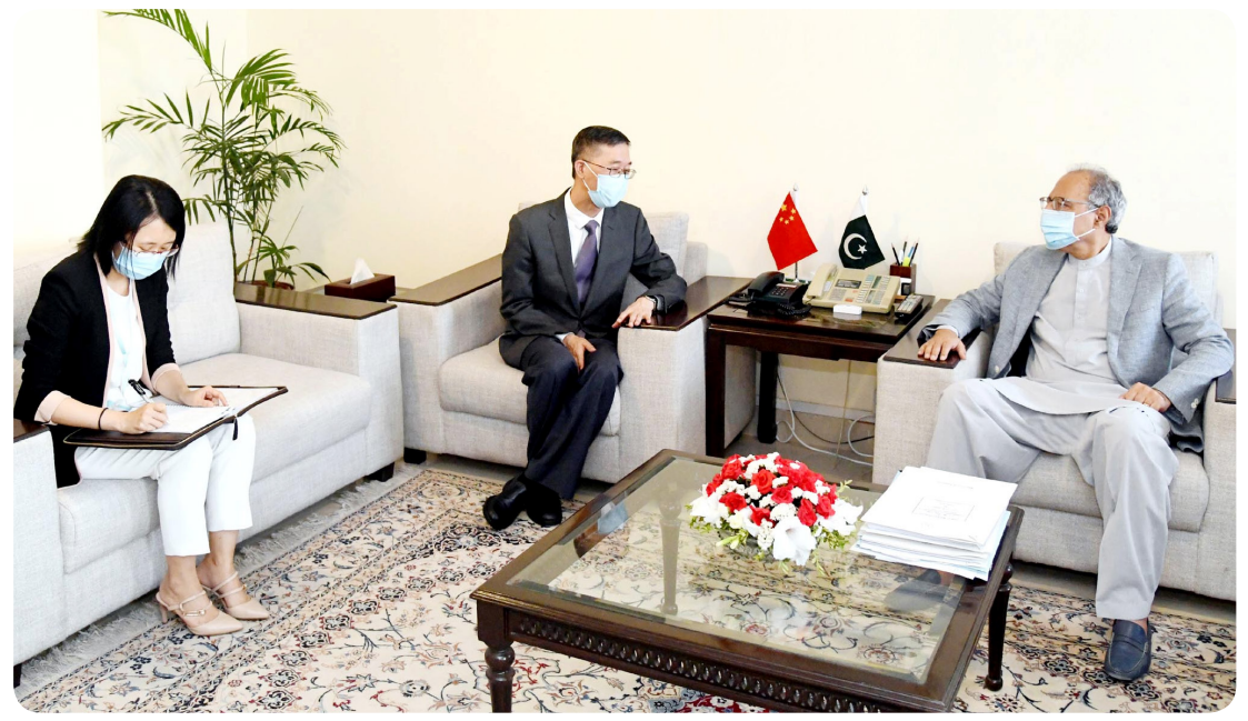
ISLAMABAD: Ambassador of China Yao Jing in a meeting with Dr. Hafeez Shaikh.

exempt from regulatory duty for CKD/SKD manufacturing. The government will keep a distinction between end-to-end manufacturing and assembling. The EDB will act as the secretariat for the manufacturing policy implementation. According to the industry and production ministry, the total volume of trade in Pakistan for mobile phones is approximately Rs40 million a year. A total of 16 companies are currently manufacturing phones in Pakistan. The local industry has expressed satisfaction at the new policy, said the notification.