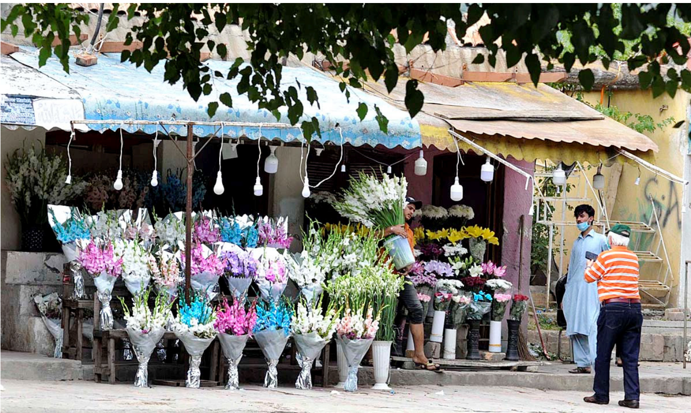
ISLAMABAD: A vendor arranging the flower bouquet to attract customer at Flower Market F-7 Market.

universities reduce their fees by 50%, Shiraz said. Following Shiraz’s tweets, several other students from all provinces expressed their concerns and have requested the HEC to consider their demands. Schools, universities and colleges were closed down by the government in late February as a precautionary measure against the novel coronavirus spread. Following this, educational institutions resorted to online classes.