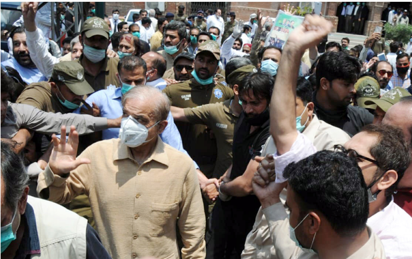
LAHORE: PML President Shahbaz Sharif waves to supporters on the occasion of his appearance before court.

with running water will remove them completely, which is key to washing away viruses. Experts agree that a hand sanitizer with over 60 percent alcohol content is effective in killing most viruses. However, the must-have alcohol can be harmful to sensitive skins and even cause damage to healthy ones. A spokesperson for Japanese chemical products company Kao Corporation has said that too much hand gel can dry out the skin and remove natural oils on the surface, increasing vulnerability to infection. — APP