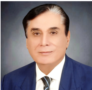
sion will resume its hearings soon after review of Lock down

were received by the Missing Persons Commission upto April 2020. During May 2020, 13 more cases were received by the commission and total numbers of cases reached to 6674. The Missing Persons Commission disposed of 21 cases in May 2020 and thus total disposal of Missing Persons upto May 31, 2020 is 4544 and balance as on May 31, 2020 is 2130. The Missing Persons Commission will resume its hearings soon after review of Lock down