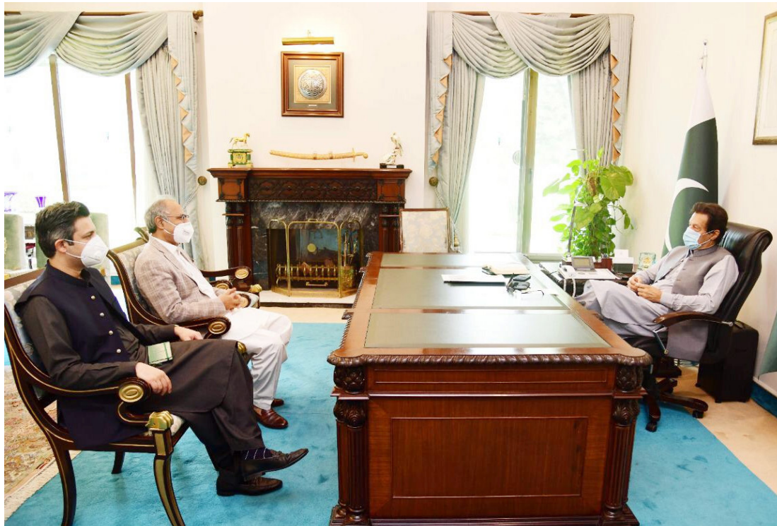
ISLAMABAD: Abdul Hafeez Sheikh and Hamad Azhar in a meeting with Prime Minister Imran Khan.

Federal government would also provide required help to the provinces. He said provinces have been provided 250 ventilators and additional beds last week. A comprehensive incentive package would be finalised soon for healthcare workers.