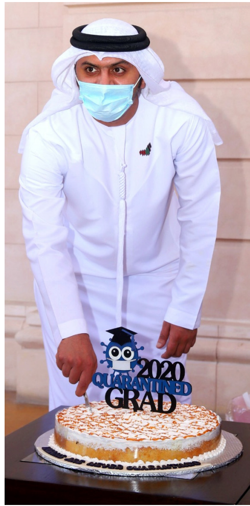
uates to stand out as a role model for others, to shine and be successful in their future pursuits,