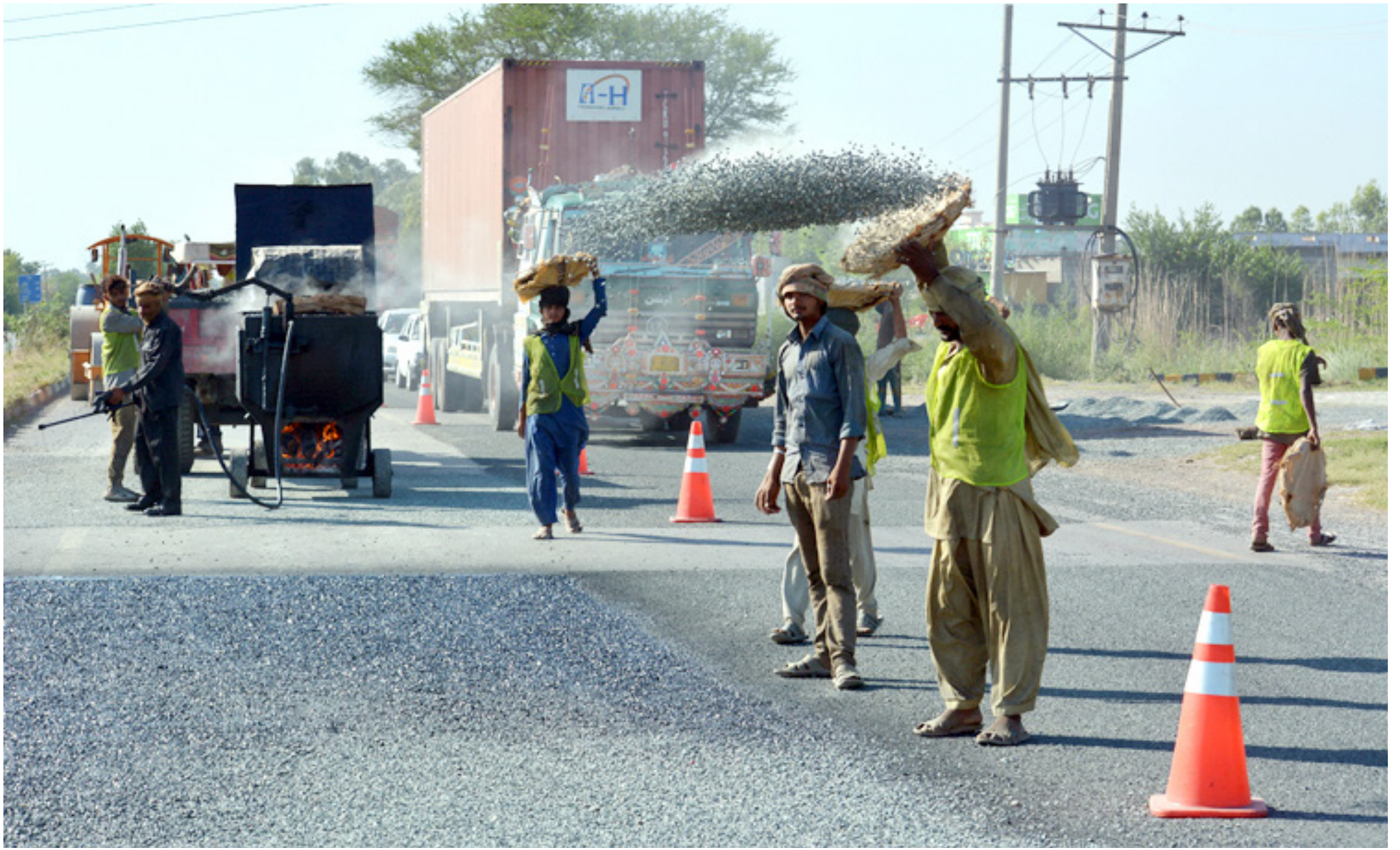
LALAMUSA: Labourers busy in carpeting road.

ISLAMABAD: Pakistan Academy of Letters (PAL) has published more than 500 books on Pakistani literature and mystic poetry translations to increase reading habits and encourage youth to read quality material. According to an official, only in year 2019 PAL has published 10 books and five quarterly magazines Adabiyat (Urdu) and bi-annual Pakistani Literature (English) and monthly newsletter academy. Magazines were also published on various topics including, "Literature" (Issue 119), "Literature" (Issue 120) Literature Pediatrician" (Issue 8-9) and "Literature Pediatrician" (Issue 10) and Fishing "Pakistani Literature" (English). — APP