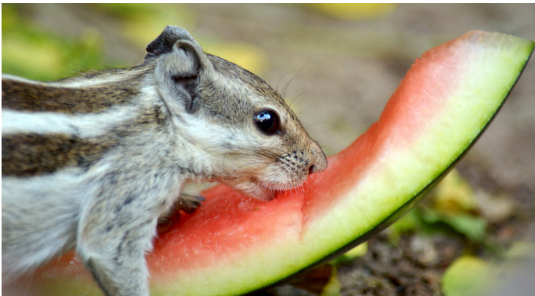
LALAMUSA: A squirrel eating water melon. — Khurshid Nadeem

XICHANG: China plans to launch the last satellite of the BeiDou Navigation Satellite System (BDS) on Tuesday to complete the construction of the global constellation. The launch window is set between 10:11 a.m. and 10:50 a.m. (Beijing Time), according to the China Satellite Navigation Office. — APP