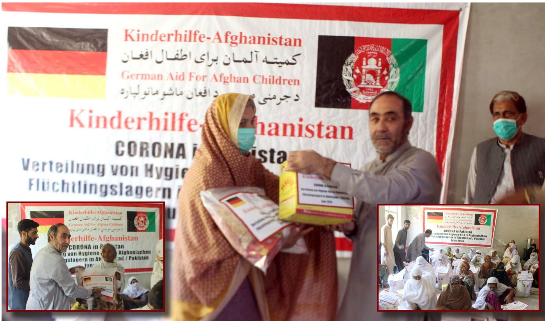
ABBOTTABAD: German aid for Afghan children being distributed in Abbottabad.

RAWALPINDI: As many as 134,445 persons have received Rs 12,000 each cash here in Rawalpindi district under Ehsaas Emergency Cash programme launched by Pakistan Tehreek-e-Insaf (PTI) government on the directives of the Prime Minister Imran Khan to provide financial assistance to the deserving families. According to a district administration spokesman, the administration has provided cash amounting to over one billion and 320 million rupees to 134,445 persons in the district under the programme. He said, 26 centers were set up for Rawalpindi district including tehsil Gujjar Khan, Taxila, Murree, Kahuta, Kallar Syedan and Kotli Sattian. He said, the poor families received cash from 26 points in Rawalpindi district while the cash was disbursed among the deserving families affected by the lockdown. - APP