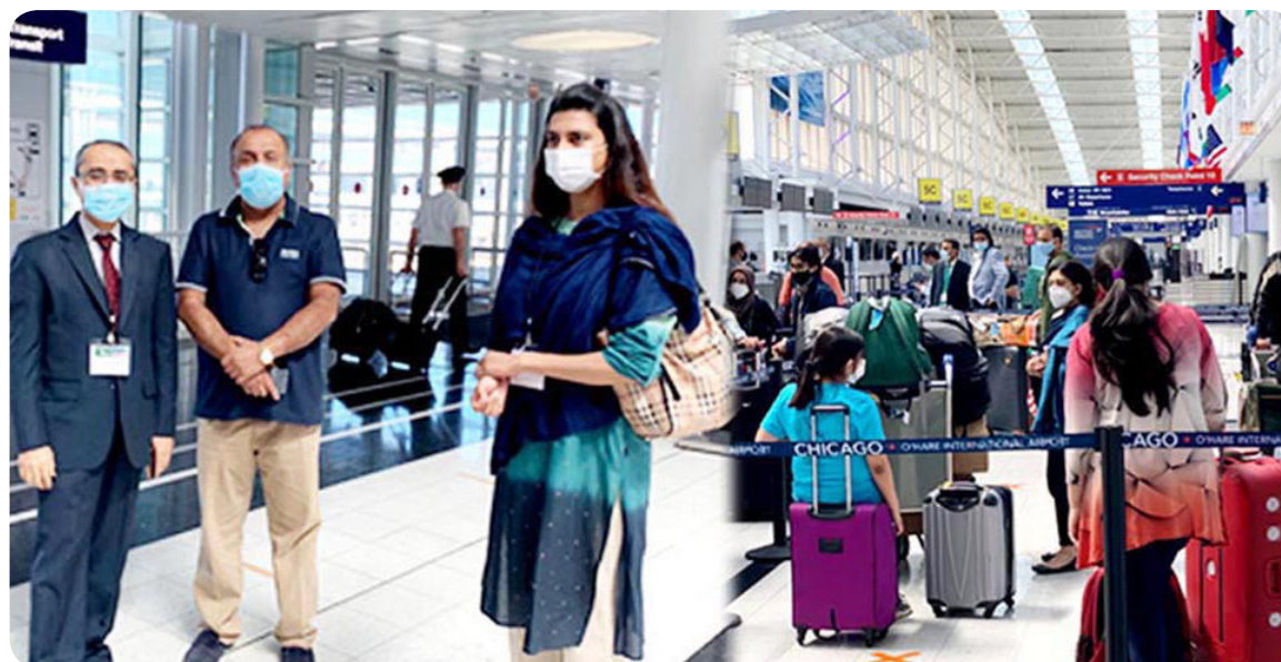
CHICAGO: A special PIA Chartered flight left for Islamabad from Chicago today, This was the sixth PIA flight to facilitate Pakistanis stranded in the US. CG Chicago.