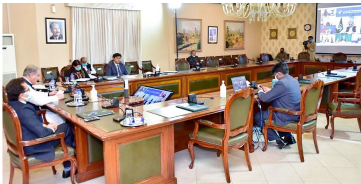
ISLAMABAD: Foreign Minister Shah Mahmood Qureshi taking part in a webinar organized by Chinese Ministry of Foreign Affairs. — DNA

We have taken part in investigation and design of almost all of the hydropower projects in Pakistan, such as Tarbela Dam, Kohala Dam, SK, Gomal Zam Dam, NJ and so on," "China's ability on water conservancy construction is built on years of practices. With our knowledge and experience, we will do our best to live up to Pakistan's trust," Yang said. The construction of dam will create 16,500 jobs and consume a huge quantity of cement and steel, which will give boost to the local industry. The main purpose of the dam is water storage and production of 4,500MW cheap and affordable electricity for meeting the country's energy requirements. — DNA