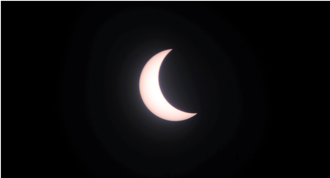
FAISALABAD: A beautiful view of solar eclipse on Sunday.

In this regard, Pakistan Navy Hydrographic Department is aptly fulfilling this international obligation, to ensure availability of updated information for mariners who traverse through the busy shipping lanes along Pakistan's coast round the year.