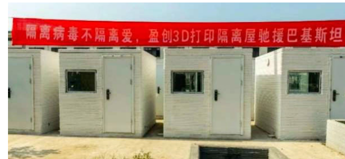
treatment, these wards can be turned into materials again for printing other new buildings, the report added.

tricity supply, they can be put into use promptly. It is learned that 3D printed isolation wards had been used in Hubei and Shandong, China during the most difficult time and achieved satisfactory feedback. The isolation ward can be transformed into hotel, park lounge, cafe, guardroom, toilet, emergency room for disaster relief, etc. Furthermore, the wards are printed from recycled materials. After crushing, sorting, grinding and high-temperature