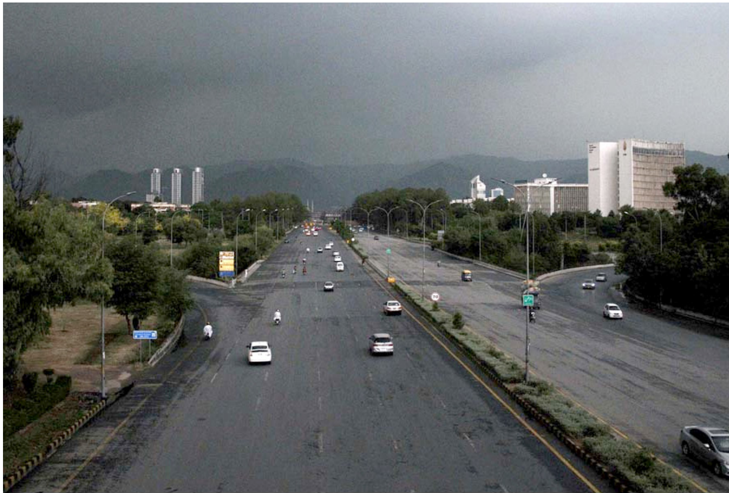
ISLAMABAD: A view of dark cloud covering the city before heavy rain in the federal capital. - APP

ISLAMABAD: The footwear exports from the country witnessed an increase of 4.29 percent during the eleven months of current financial year (2019-20) as compared to the corresponding period of last year. Pakistan exported footwear worth US $114.860 million during July-May (2019-20) against the exports of $110.140 million during July-May (2018-19), showing a growth of 4.29 percent, according to the latest data of Pakistan Bureau of Statistics (PBS). In terms of quantity, the exports of footwear also increased by 12.62 percent by going up from 11,887 metric tons to 13,388 metric tons, according to the data. - APP