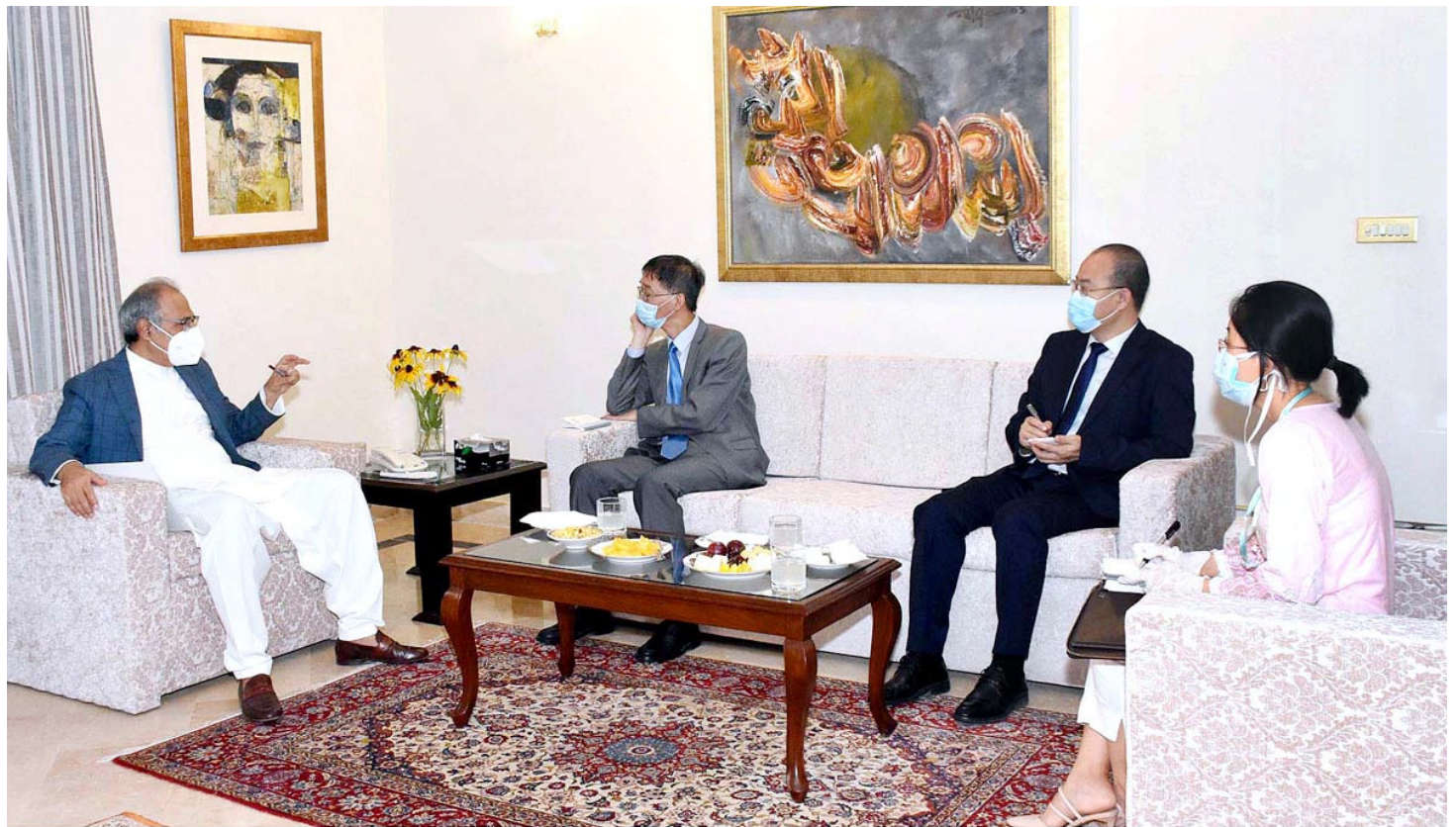
ISLAMABAD: Chinese Ambassador to Pakistan, H.E. Mr. Yao Jing, calls on Adviser to the Prime Minister on Finance and Revenue, Dr. Abdul Hafeez Shaikh.

ISLAMABAD: Advisor to the Prime Minister on Commerce, Abdul Razak Dawood here on Friday said that Pakistan is rapidly diversifying its exports into high quality and globally competitive engineering products. He was chairing an internal review meeting to discuss the finalization of Strategic Trade Policy Framework (STPF), at Commerce Division, said a press release. The Advisor Commerce stated that one of the objectives of the STPF is to achieve diversification of our export in products other than the traditional ones. He explained that through promotion of exports in new sectors, particularly the engineering and pharmaceuticals sectors, "we are going to reduce our reliance on five traditional export sectors. He added that this has also been supported in the Budget 2020-21, with reduction of import duties on raw materials and the tariff rationalization measures. Currently, the draft STPF is being reviewed by the stakeholders and their views are being incorporated in the final draft, which will be placed before the Economic Coordination Committee (ECC) of the Cabinet shortly.