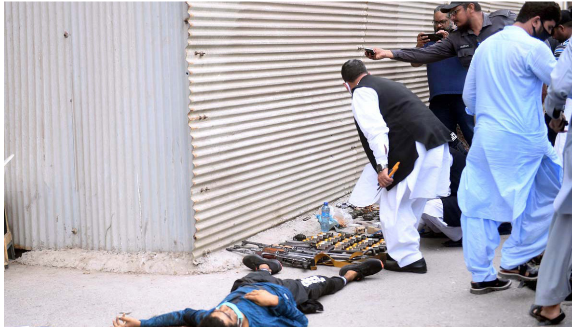
KARACHI: Policemen gather around the body of an assailant outside the Pakistan Stock Exchange building after a terrorist attack.

about issuing bogus licenses to pilots, Bilawal said he did not support fake degrees but the issue could have been handled in such a way that Pakistan's negative image across the globe could have been avoided. He also criticized the aviation authorities for putting all responsibility of plane crash in Karachi on the deceased pilots saying it was unjustified as they were not alive to respond to the allegations. He also rejected the allegation of political appointments in PIA. Bilawal also condemned terrorist attack on Karachi Stock Exchange and said that due to unemployment, issues of law and order were emerging again in the city.