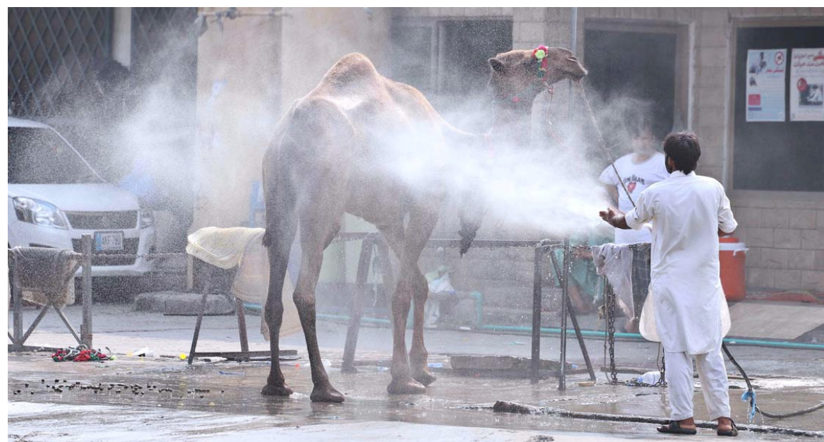
RAWALPINDI: A man washes his sacrificial camel at a service station. - APP

intelligence based operations are being conducted in all major cities including Quetta, Peshawar, Karachi, Lahore and Multan to root out the network of smugglers. As a result of these coordinated efforts and renewed vigour Pakistan Customs has made historic seizures of smuggled goods during the month of July 2020. - APP