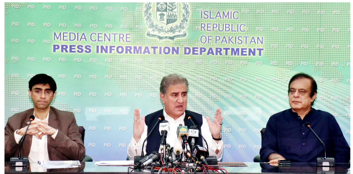
ISLAMABAD: Foreign Minister Shah Mahmood Qureshi addressing a press conference along with Federal Minister for Information and Broadcasting Senator Shibli Faraz and SAPM on national security Dr Moeed W. Yousaf. - DNA

"We have sacrificed sports like this empty ground shows. The upcoming Pakistan and England cricket series is very important. It shows that we will knock the disease for six," he commented while standing in an empty playground with no player around. He said though he was sad for not traveling whole of Pakistan, the same sacrifices were paying off with lower COVID-19 cases in Pakistan and called for extra caution on Eidul Azha. The high commissioner also announced that British Airways was resuming its flights from Pakistan what was the manifestation of Pak-UK friendship.