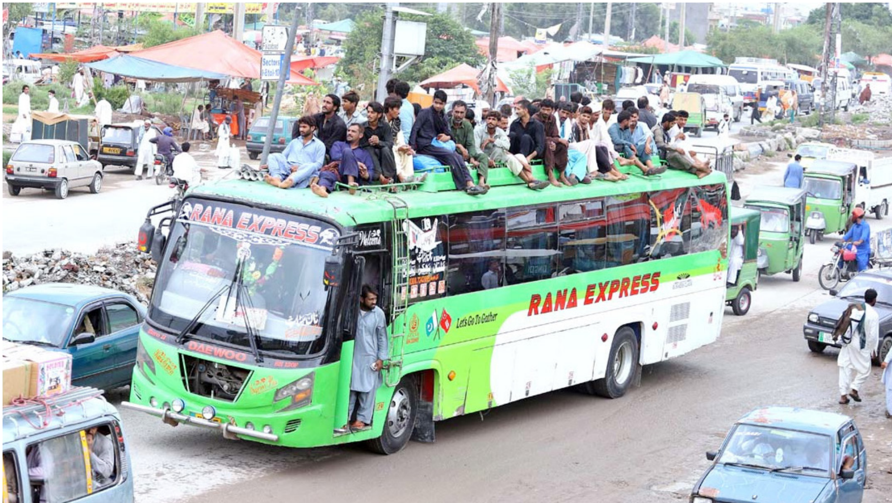
RAWALPINDI: People sitting on the roof of passenger bus to go their home towns ahead of Eid al-Adha. - APP

ISLAMABAD: Indus River System Authority (IRSA) on Friday released 253,900 cusecs water from various rim stations with inflow of 341,200 cusecs. According to the data released by IRSA, water level in the Indus River at Tarbela Dam was 1468.60 feet, which was 82.60 feet higher than its dead level 1386 feet. Water inflow in the dam was recorded as 193,700 cusecs and outflow as 125,000 cusecs. The water level in the Jhelum River at Mangla Dam was 1229.80 feet, which was 189.80 feet higher than its dead level of 1040 feet whereas the inflow and outflow of water was recorded as 33,600 cusecs and 15,000 cusecs respectively. The release of water at Kalabagh, Taunsa and Sukkur was recorded as 174,600, 169,600 and 52,600 cusecs respectively. Similarly, from the Kabul River a total of 48,900 cusecs of water was released at Nowshera and 33,200 cusecs released from the Chenab River at Marala.