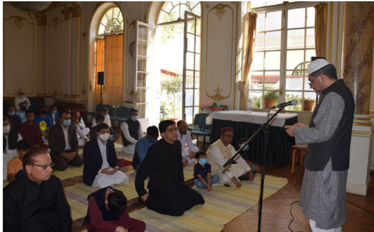
PARIS: Pakistani citizens offering Eid-ul-Azha prayer in the French capital. DNA

ISLAMABAD: Prime Minister Imran Khan has directed to devise an action plan for timely implementation of reforms strategy in the energy sector. Addressing a meeting to review ongoing reforms in the energy sector in Islamabad today, he said reforms in the energy sector are essential for stability of the economy. The Prime Minister directed to take strict action against the elements involved in creating unnecessary hurdles to consumers and doing corrupt practices in power sector. The Prime Minister was briefed on the ongoing reforms in the energy sector, power generation as per requirement of the country, modernization of transmission and distribution systems.