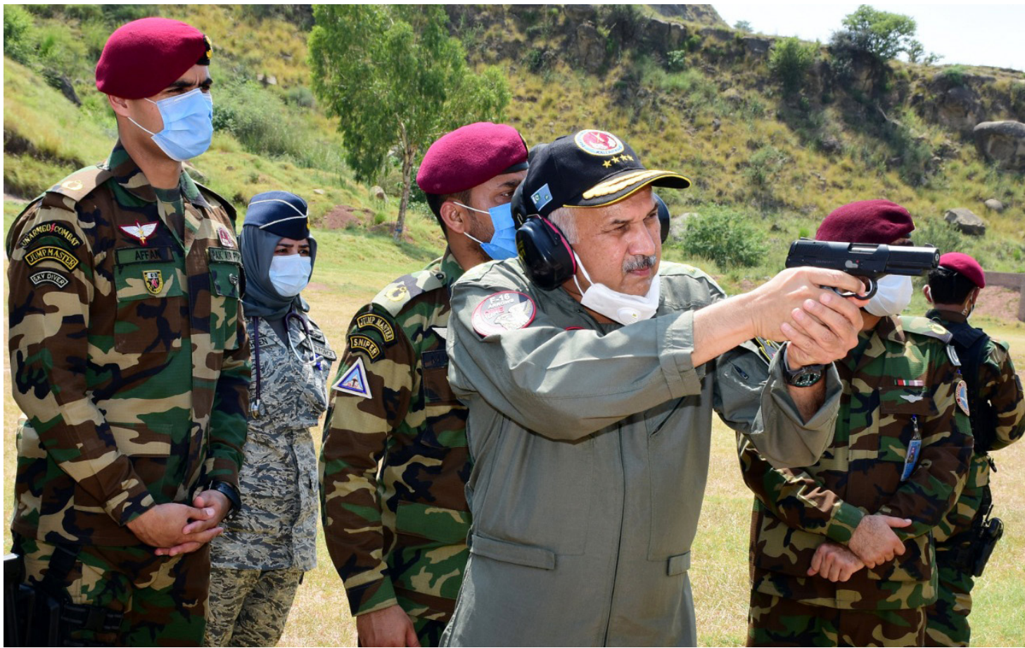
KALLAR KAHAR: Chief of Air Staff, Air Chief Marshal Mujahid Anwar Khan firing live ammunition during his visit to PAF Base Kallar Kahar.

He also planted a tree at SSW Headquarters. Interacting with the combat crew, Chief of the Air Staff expressed satisfaction over the operational preparedness of personnel and lauded their high morale and dedication.