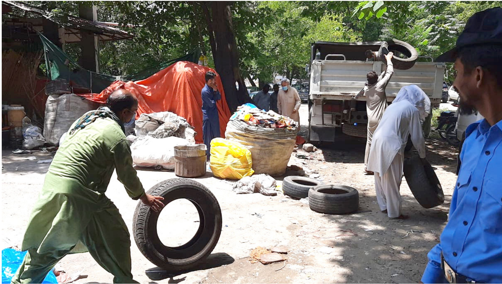
ISLAMABAD: MCI staff busy in anti-dengue measures.

ISLAMABAD: National Book Foundation (NBF) has planned to open a membership drive in first week of July under Readers Club Scheme to provide books on discounted rates. Readers Club Scheme was the most popular development scheme and through this it a member can get books on 55 percent discounted rates. The membership drive will be opened in more than 50 main cities and membership fee restricted to Rs 110. According to an official, Readers Club Scheme attracts number of book lovers who wait anxiously for opening of this scheme. The membership drive will continue for three months to facilitate books on low-priced rates. He said that to get membership there is only need of copy of National Identity Card (NIC) and 2 passport size photos. — APP