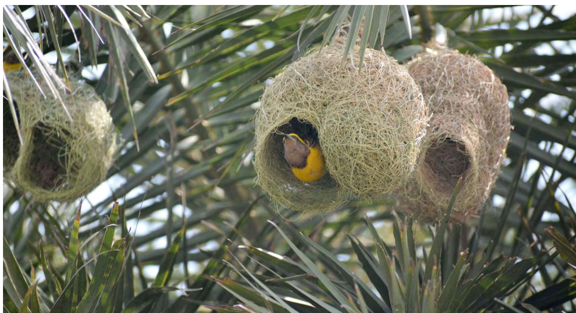
FAISALABAD: A beautiful bird preparing nest on tree of dates.