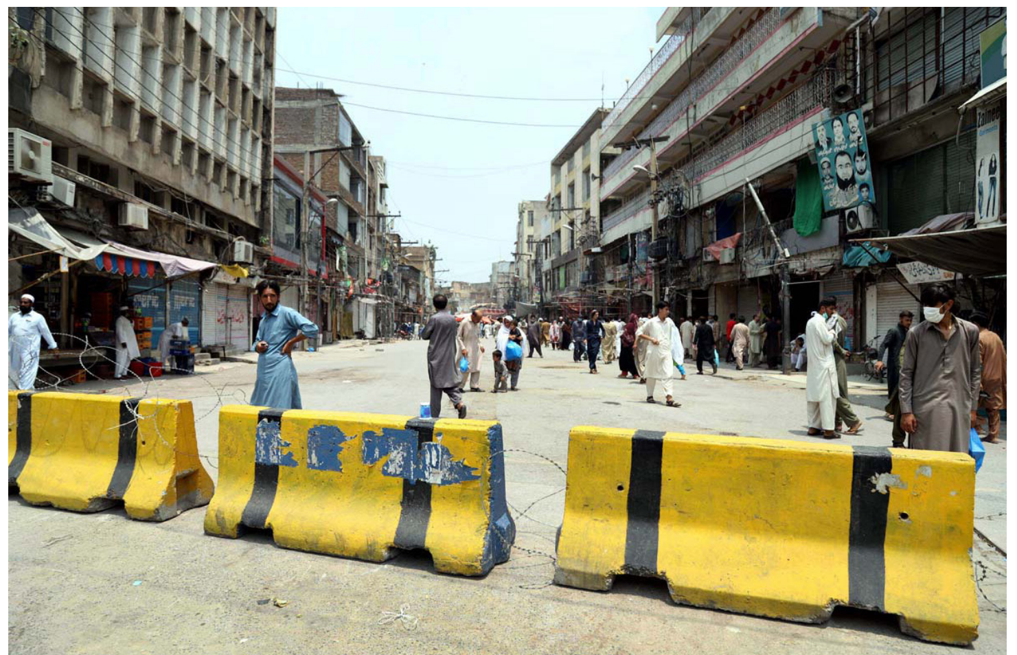
RAWALPINDI: A view of closed shops and road at Bara Market which were sealed after corona positive cases were reported.