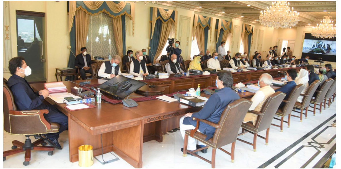
ISLAMABAD: Prime Minister Imran Khan chairs Cabinet meeting.

for Aviation Gulam Sarwar Khan has said that the licenses of 262 pilots are 'suspicious' or 'doubtful', including 141 captains of PIA, 10 captains of Serene Air and 9 captains of Air Blue. Inquiries have been completed against 128 pilots while 148 have been grounded. Five officers who issued fake licenses have also been suspended and all these recruitments were made during the last two terms.