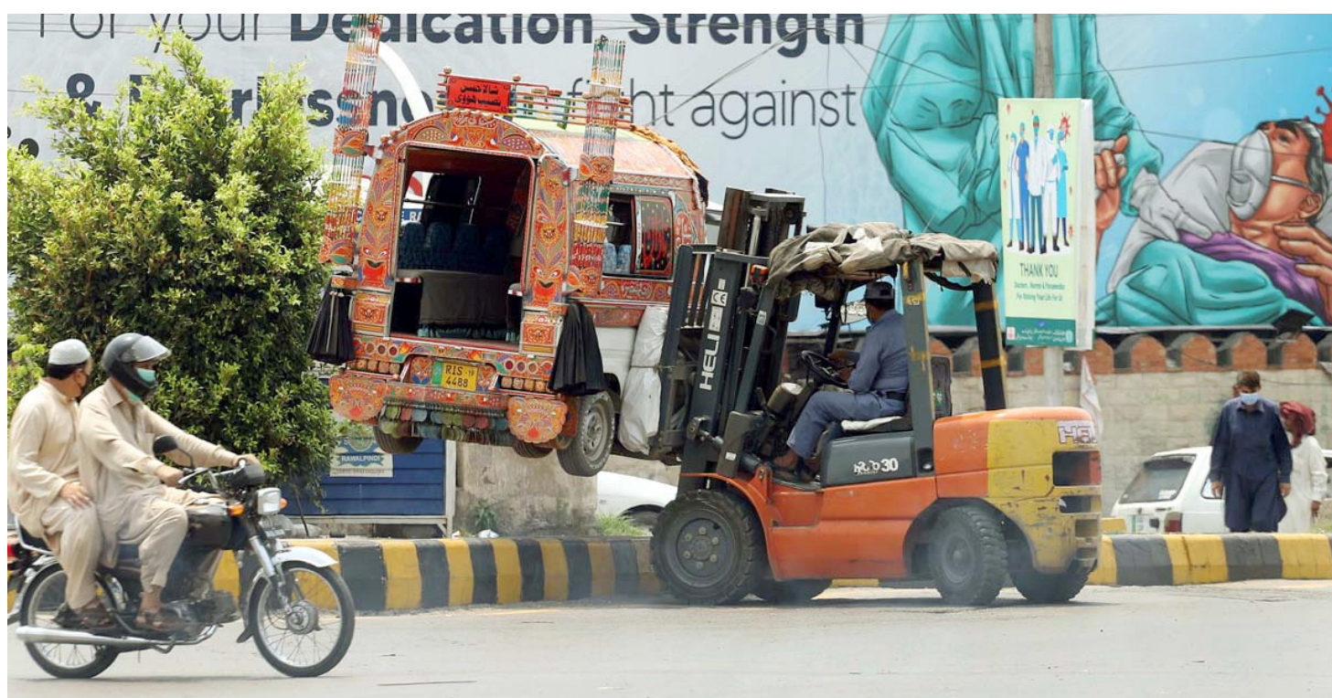
RAWALPINDI: Traffic police warden removing Suzuki wrongly parked at Katchery Chowk.