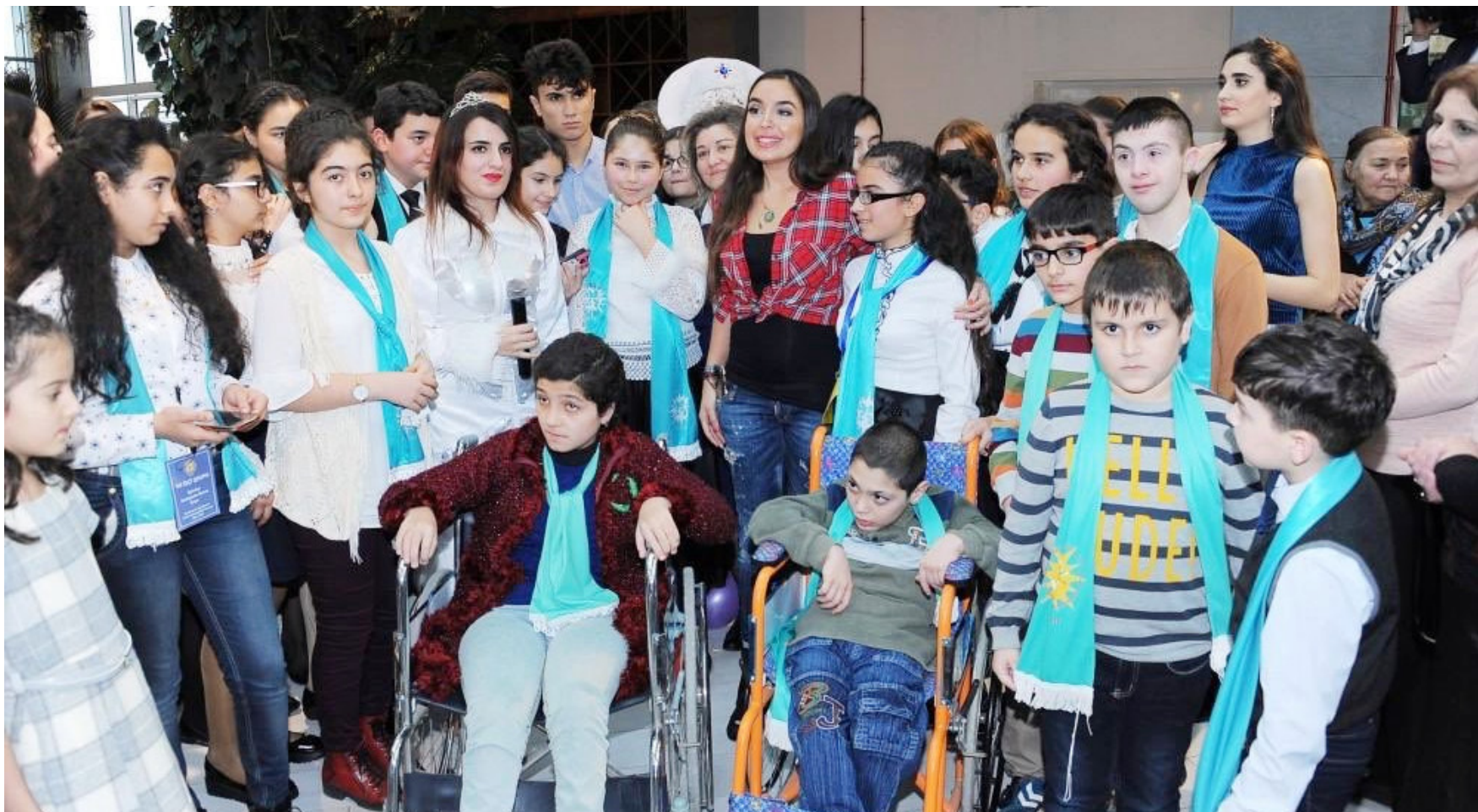
BAKU: Ms. Leyla Aliyeva founder of HA Foundation and initiator & organizer of several charitable projects not only in Azerbaijan, also outside of Flag of Azerbaijan boundaries celebrating her birthday with children.

TASHKENT: As of July 3, 10:00, the number of coronavirus infected in Uzbekistan has reached 9199 (+121) people, the Ministry of Health reports. 6034 (65%) people have fully recovered from the virus. 3138 patients are being treated in hospitals.