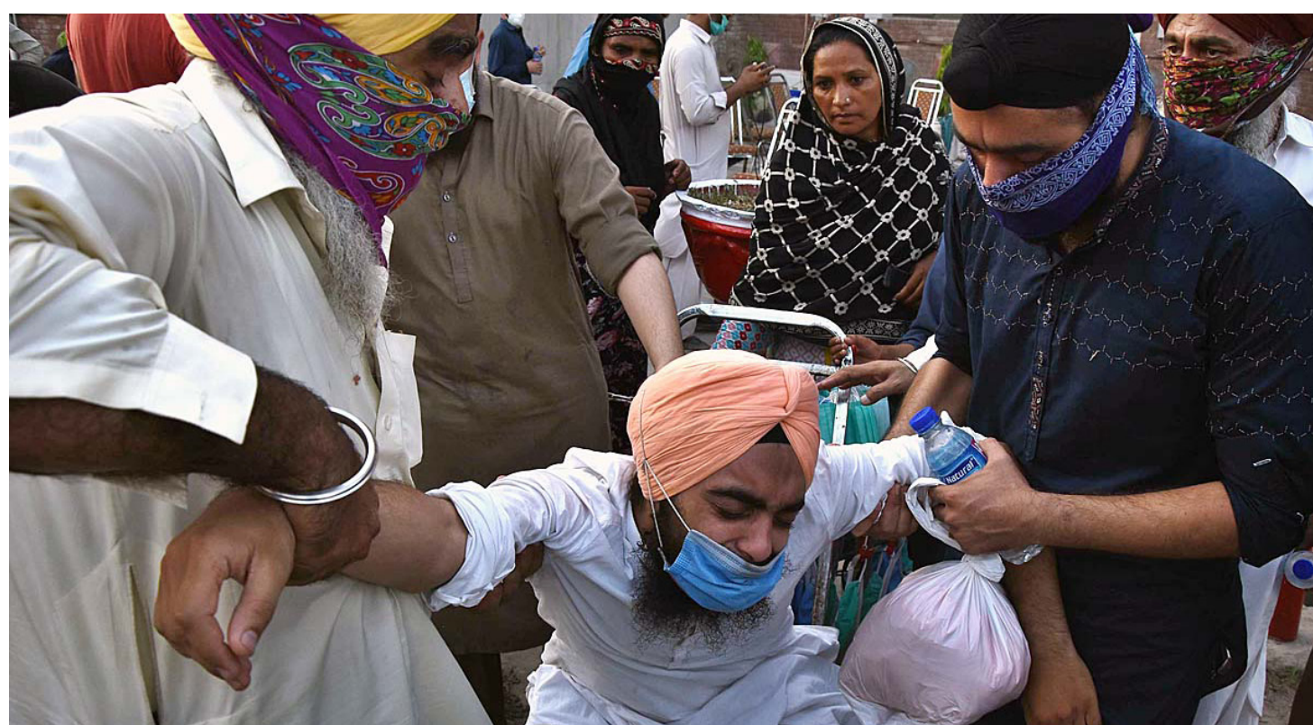
SHIEKHUPURA: Members of Sikh community mourn deaths of their nears and dears ones who lost lives in accident.

The AJK President said that the Muslim world has to unite against forces trying to create a divide amongst their ranks. He said that Islam is a religion of peace and we have to propagate the true teachings of Islam. He added that the Muslim Ummah has to realize its true potential and regain its true position in the global spectrum. President Masood Khan said that despite being the oppressed, a major chunk of the Muslim population has adopted a defensive posture about Islam, Kashmir and Palestine. "We have to be proactive and start a process of result-oriented dialogue amongst fellow Muslim nations towards the resolution of these long-standing disputes" said the President.