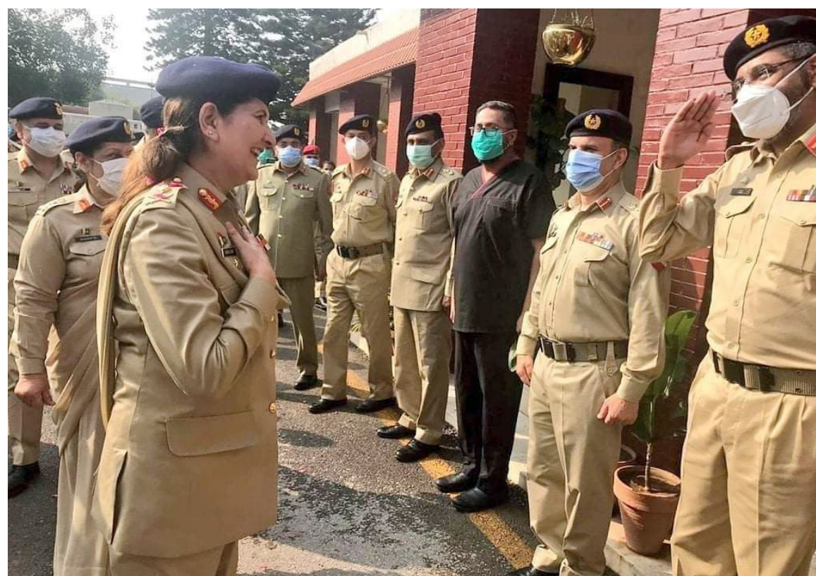
RAWALPINDI: Newly promoted Lt. General Nigar Johar meeting with staff after her promotion. - DNA

ISLAMABAD: Ehsaas Emergency Cash Programme has so far disbursed an amount of over Rs. 149.54 billion among over 12,356,000 lockdown affectees under different categories. The programme was initiated to disburse cash amount of Rs. 12,000 among those affected from the coronavirus lockdown. The payment process under different categories of the programme was continued across the country. According to the cash update received on July 3, a total of over Rs. 66.91 billion has been disbursed among over 5,527,000 deserving families in Punjab so far while around Rs. 44.84 billion has been disbursed among 3,718,000 families in Sindh. - APP