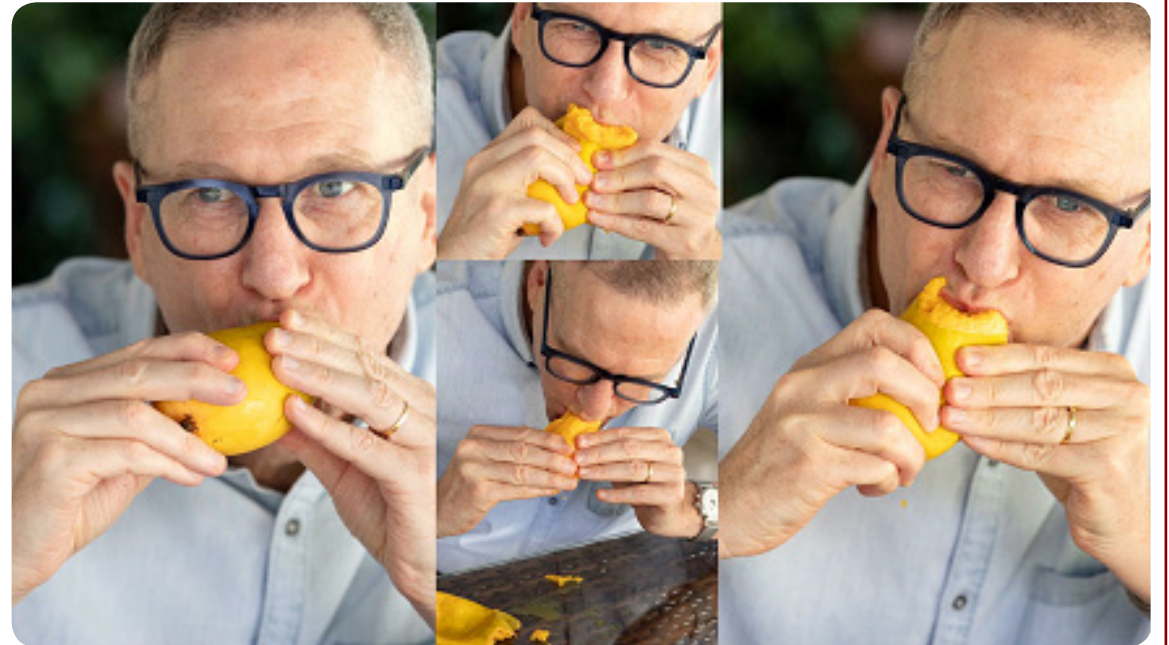
ISLAMABAD: Australian High Commissioner Geoffrey Shaw eating mangoes in Pakistani style.