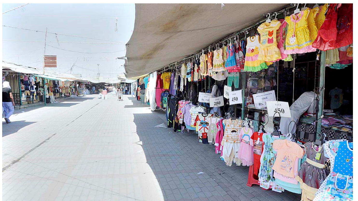
ISLAMABAD: A deserted view of weekly bazaar during lockdown as people restrict their movement for prevention of COVID-19 outbreak. — APP

ties of sanitizers and gloves for Islamabad police. The IGP said that citizens were also appreciating the role of policemen in this critical time while all SPs, SDPOs are ensuring full assistance to teams of district administration in their respective areas. The IGP thanked the representatives of the foundation and said that Islamabad police is performing role at front line to combat this daunting challenge. Islamabad Police Chief said that efforts are also being made for to protect health of policemen so that they may accomplish their responsibilities in an effective manner. — APP