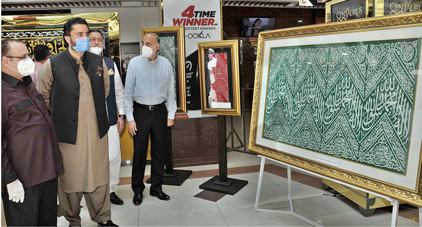
ISLAMABAD: July 03 - Chairman Parliament's Kashmir Committee and Minister of State for SAFRON and Narcotics Control, Shehryar Khan Afridi keenly viewing during exhibition of Ghilaf-e-Kaaba and other relics of religious significance at Centaurus Mall. — APP

ISLAMABAD: Indus River System Authority (IRSA) on Friday released 318,000 cusecs water from various rim stations with inflow of 330,500 cusecs. According to the data released by IRSA, water level in the Indus River at Tarbela Dam was 1461.13 feet, which was 75.13 feet higher than its dead level 1386 feet. Water inflow in the dam was recorded as 152,600 cusecs and outflow as 170,000 cusecs. The release of water at Kalabagh, Taunsa and Sukkur was recorded as 213,900, 197,900 and 51,600 cusecs respectively. — APP