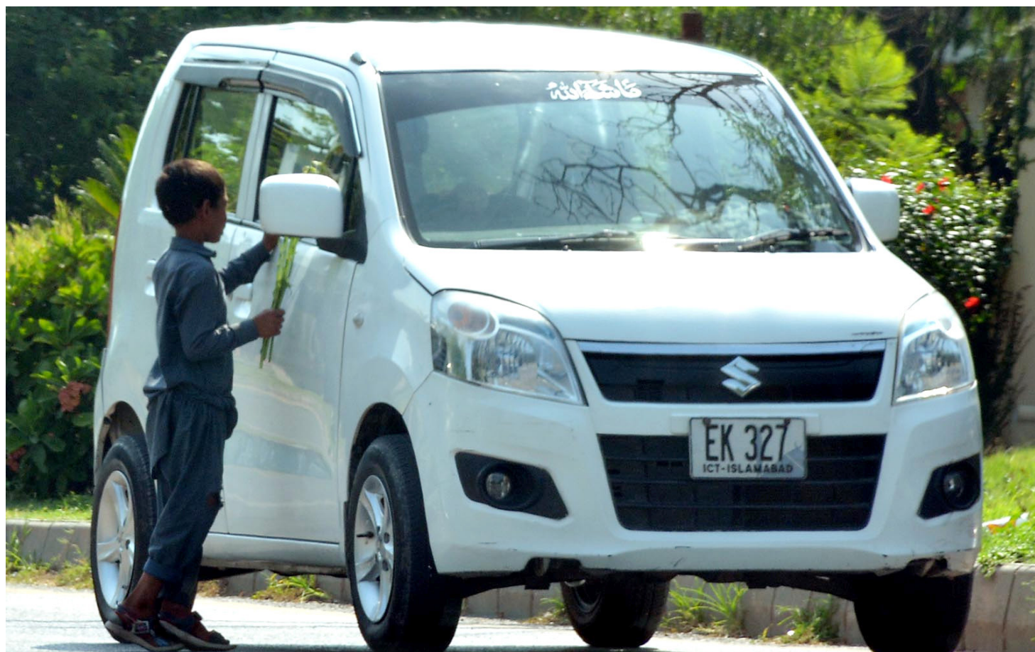
ISLAMABAD: A flower selling boy asking mercy from the passing-by vehicle driver.

marked that there is already a temple in Saidpur village in Islamabad and the government should renovate it rather than constructing a new one. The groundbreaking ceremony of the Shri Krishna temple was performed on June 23. The temple spread over four kanals is meant to include a crematorium, visitor accommodation, a community hall and parking space. The plan was reportedly approved in 2017 by the PML-N government but the construction kept being delayed. The construction, however, was challenged by many religious hardliners. Since the news of its construction was shared, the site has been attacked and vandalised four times.