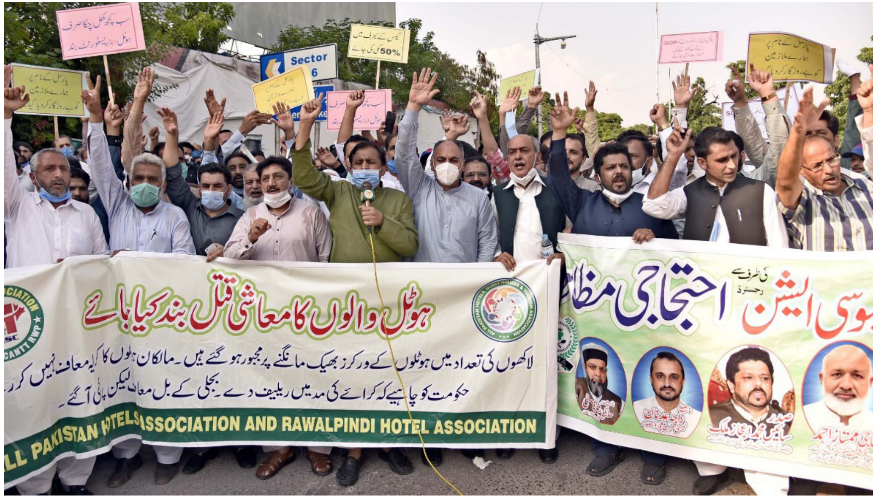
ISLAMABAD: Members of traders community holding a demonstration for opening of restaurants in Islamabad. — DNA

ISLAMABAD: Art group Theatre wallay has opened their space called The Farm for art activities with strict SOPs after being shut down for three months due to COVID-19. According to management, a limited number of people, maximum 20 visitors will be allowed with proper implementation of social distancing and standard operating procedures (SOPs). Pre-registration will be mandatory for attending the events while all performances will be held in outdoor courtyard space keeping physical distance and WHO suggested guidelines. No one will be allowed to enter the space without masks which need to be worn all the time while any group of more than 4 people will not be allowed the entry. A maximum of 20 visitors will be allowed for any particular activity or performance and sanitizers and hand-washing stations will be provided and encouraged. — APP