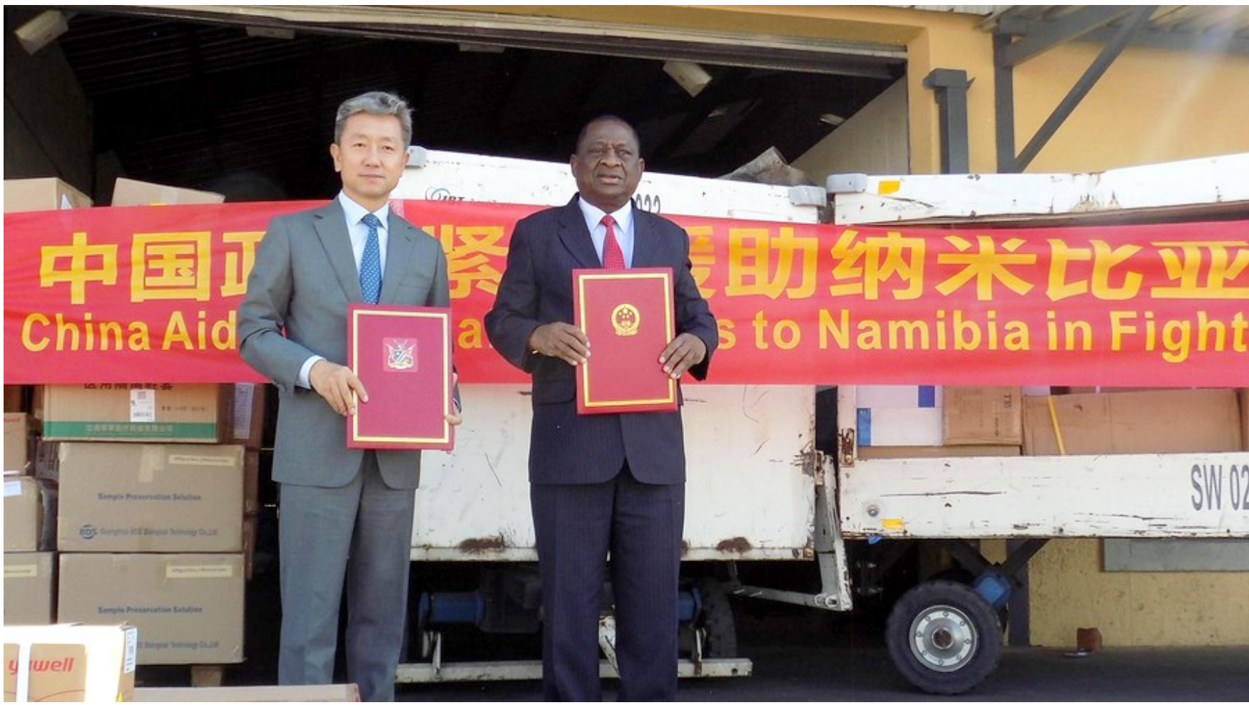
NAMIBIA: China has donated COVID-19 related supplies worth about 2.35 mln USD to Namibia to assist the country in fighting the virus, an official from the Chinese Embassy in Namibi. – DNA

HONG KONG: Chinese social media app Tik Tok has revealed on Tuesday that it is stopping operations in Hong Kong owing to a new security law in the region, as other technology companies stop processing government requests for user data in the region. The short form video app owned by China-based ByteDance has made the decision to exit the region following China's establishment of a sweeping new national security law for the semi-autonomous city. "In light of recent events, we've decided to stop operations of the Tik Tok app in Hong Kong," a Tik Tok spokesman said in response to a Reuters question about its commitment to the market. Tik Tok has also said previously that it would not comply with any requests made by the Chinese government to censor content or for access to Tik Tok's user data, nor has it ever been asked to do so. The Hong Kong region is a small, loss-making market for the company, one source familiar with the matter said. Last August, Tik Tok reported it had attracted 150,000 users in Hong Kong. Globally, Tik Tok has been downloaded more than 2 billion times through the Apple and Google app stores after the first quarter this year, according to analytics firm Sensor Tower.