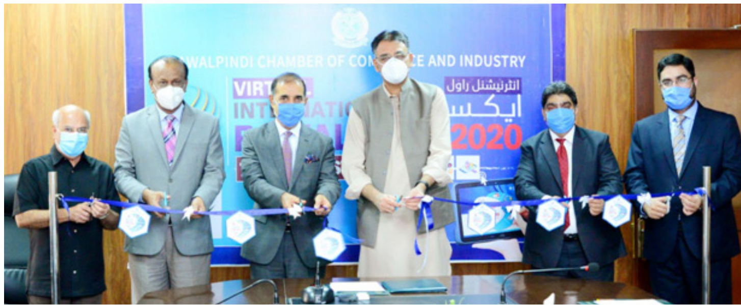
ISLAMABAD: Federal Planning Minister Asad Umar inaugurating virtual Rawal Expo.