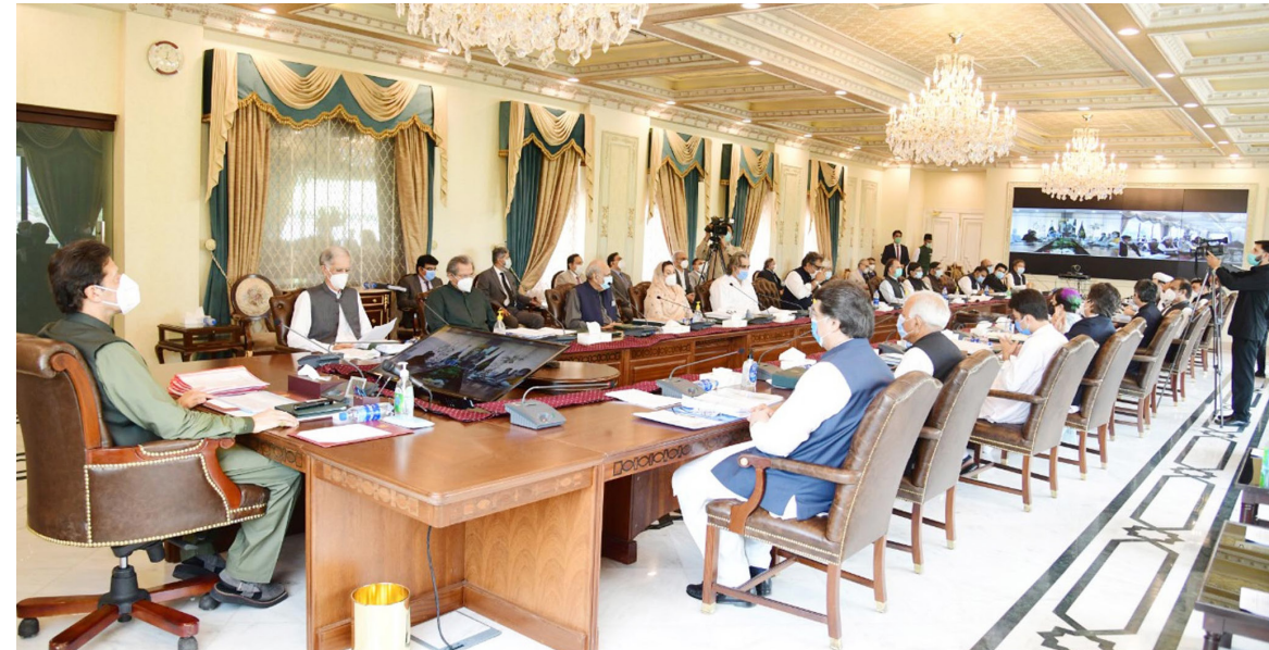
ISLAMABAD: Prime Minister Imran Khan chair meeting of the Federal Cabinet. – DNA

"However, I think this policy is 100 percent correct. It effectively controlled the spread of the virus and ensured that everyone was in a safe state. I think that is what it means to fight the epidemic," said