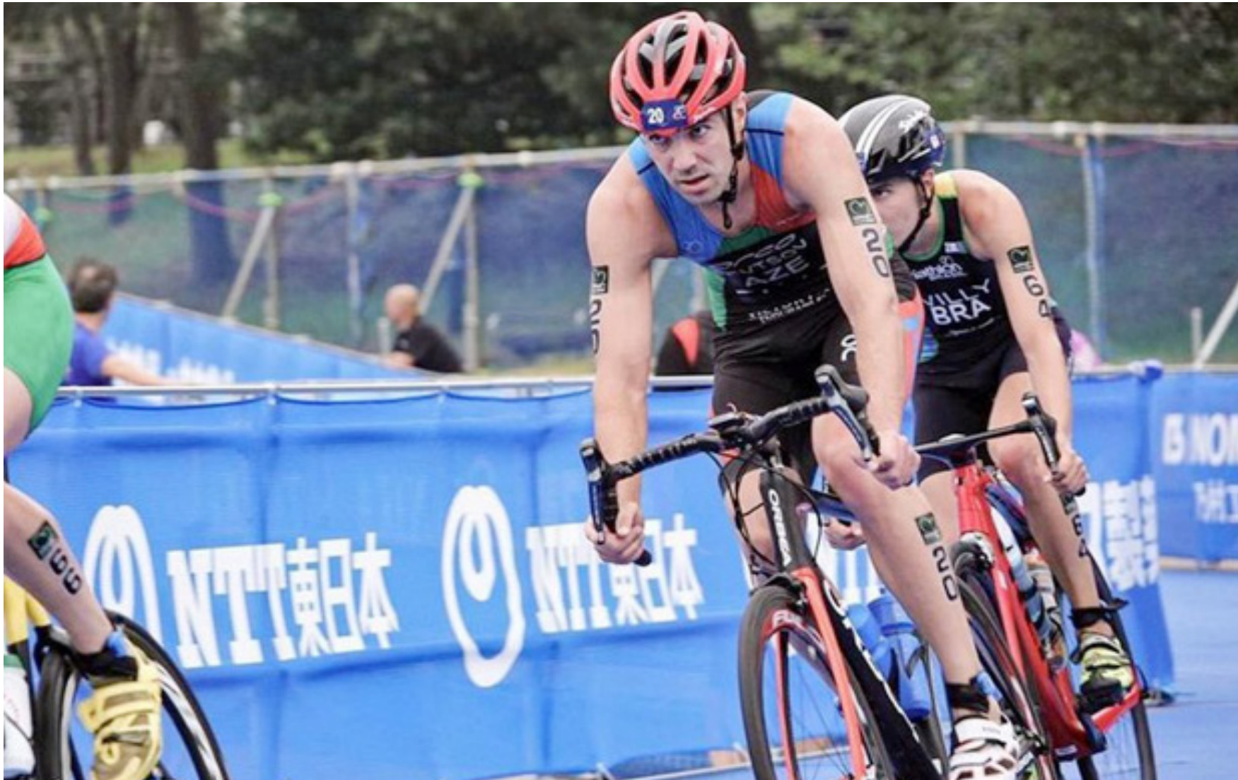
BAKU: Azerbaijan athletes taking part in a cycling competition.

He said the Chinese side would work for promoting infrastructure development and also promote people livelihood, industries and agriculture cooperation and turn this corridor into a demonstration project of high quality Belt and Road Initiative development to promote benefits to the two peoples and countries. According to reports, in the last 10 days, Pakistan has signed agreements with the Chinese companies that would produce 1800 MW clean and cheap electricity in the country. These projects are likely to help generating over 8,000 employment opportunities.