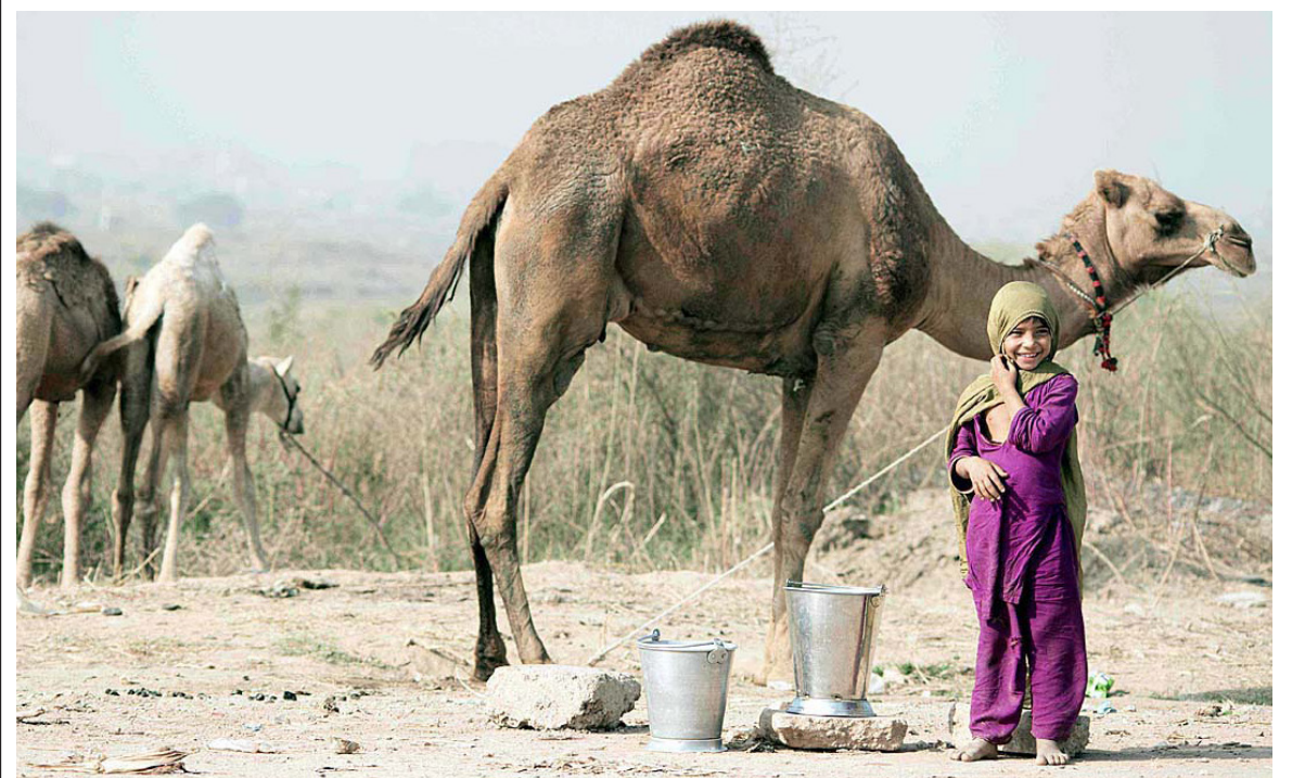
RAWALPINDI: A nomad girl standing beside her camel waiting for customers to sell milk in the outskirts of the city. — APP

to ensure implementation of prescribed guidelines and Standard Operating Procedures (SOPs) issued by district government to combat further spread of COVID-19 pandemic. The Civil Defence personnel are also supplementing the local administration in conducting surveillance of suspected and confirmed COVID-19 cases besides working for distribution of edible among the destitute people. They have been working as rapid response teams, he added. — APP