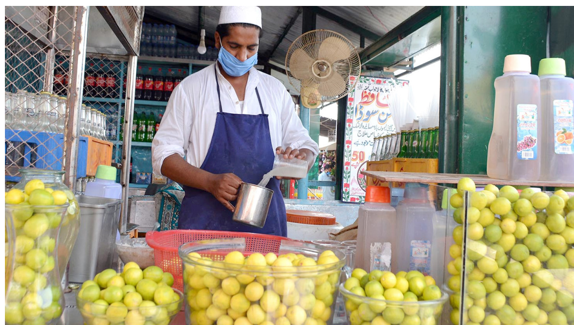
ISLAMABAD: A vendor busy in preparing summer drink (lemon soda) for customer at his stall.