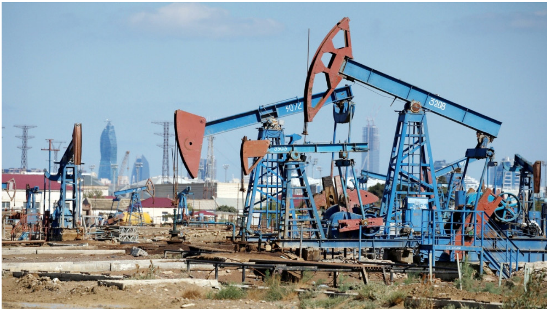
BAKU: A view of oil field in Azerbaijan. Azerbaijani oil is selling for $44.46 in market.

Officials reported 124 new cases in the territory on Tuesday, bringing the total to nearly 5,200, and the government has dispatched dozens of health workers from the mainland to reinforce hospital staff. — APP