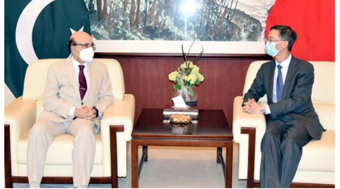
ISLAMABAD: President of AJK Sardar Masood Khan and Ambassador of China Yao Jing in a meeting.

go hungry, the prime minister said, "We decided that the government needed to transfer cash to the informal part of the labour. Those who were registered, we asked the employers to keep them employed. But the ones who were not, we helped them through Ehsaas programme." "Never in the country's history was so much money transferred to so many people in a short time," he remarked. "This saved us from some of the worst aspects of the crisis. Unlike in India, where they imposed a curfew which pushed people into deeper poverty." The prime minister continued, "No one is sure when the coronavirus will end."