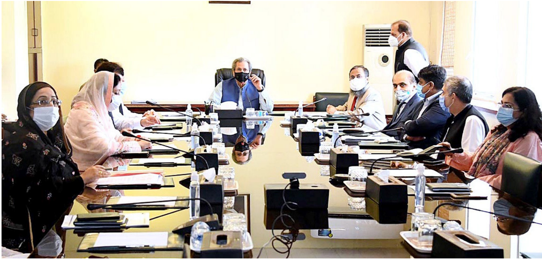
ISLAMABAD: Federal Minister for Education and Professional Training, Shafqat Mahmood chairing the 18th meeting of Inter Provincial Education Ministers Conference to discuss prospects of opening educational institutes in the country.

ISLAMABAD: Pakistan's Information Technology (IT) and IT-enabled Services (ITeS) export remittances comprising of computer services and call center services surged to US $1.11 billion at growth rate of 20.75% over the first 11 months of Financial Year 2019-20 (July-May), in comparison to US $917.875 million during the same period in Financial Year 2018-19. According to performance report of Pakistan Software Export Board (PSEB), an organization under Ministry of IT and Telecommunication IT Industry has been a star in Pakistan's economy and has achieved positive year on year growth as a result of strong government support, skilled entrepreneurs and a talented workforce. The Ministry of IT is taking all possible steps to ensure sustainable growth of Pakistan's IT Industry and to ensure close coordination with the IT industry and associated stakeholders. The generous incentives from the government, and various projects to enhance capacity and capability of the IT Industry have resulted in strong industry growth rates. Incentives to the industry include zero income tax on IT & ITeS exports till June 2025, tax breaks for PSEB registered IT start-ups for 3 years, up to 100% foreign ownership of IT & ITeS companies, up to 100% repatriation of profits for foreign IT & ITeS investors, tax holiday for venture capital funds till 2024 among other incentives.