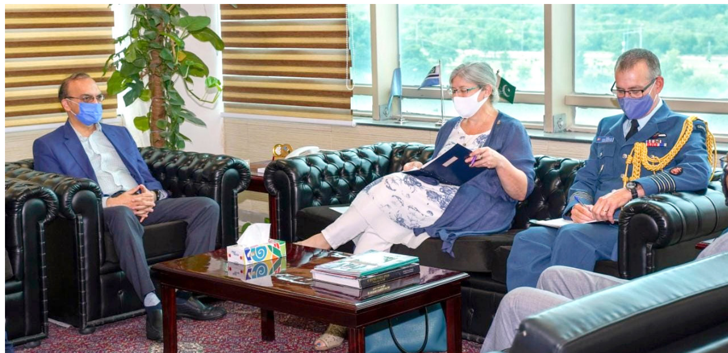
ISLAMABAD: Canadian High Commissioner along with Defence Advisor called on Secretary Aviation at his office. Matters pertaining to Civil Aviation were discussed in the meeting. Secretary Aviation emphasized the importance of constructive engagement b/w aviation sectors of both countries.

ACCRA: President of Ghana, H.E. Nana Akufo-Addo, who is the Chairperson of COMSATS, has isolated himself after coming into contact with an associate who tested positive for the coronavirus. It has been officially announced by the Government of Ghana that President will begin a 14-day precautionary self-isolation measure in compliance with COVID-19 protocols. The statement said that the President has tested negative for COVID-19.