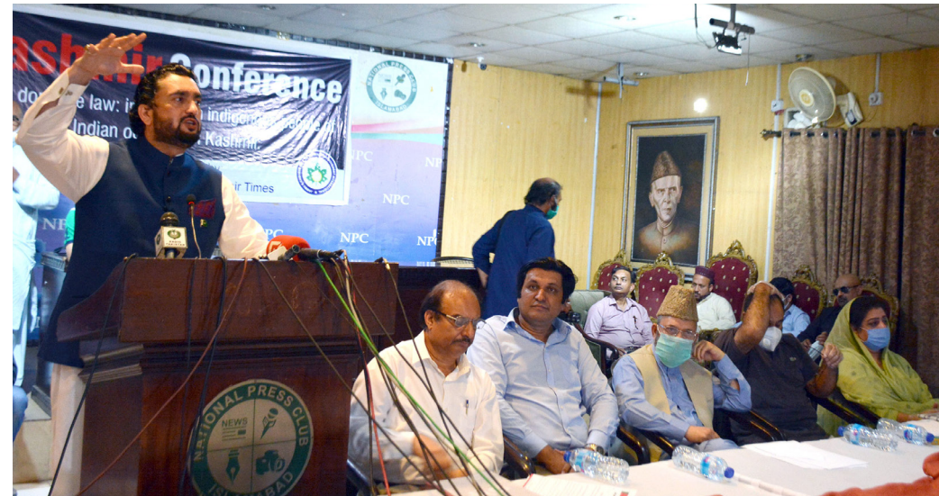
ISLAMABAD: Federal Minister Shehryar Khan Afridi addressing during Kashmir Conference organized by Jammu and Kashmir Self-Determination Movement International (JKSDMI) at NPC.

ISLAMABAD: Chairman of Parliament's Special Committee on Kashmir Shehryar Khan Afridi on Wednesday said that India's unilateral action of annexing Indian Occupied Jammu & Kashmir (IOJK) was in blatant violation of United Nations charter and it may trigger a new conflict in the region. Addressing a seminar on New Domicile Law in the IOJK, Shehryar Afridi said that India's unilateral action of annexing IOJK through military force had already triggered a new border conflict in Ladakh and this may jeopardize the regional stability. "India's actions are tantamount to jeopardizing the world peace as China, Pakistan and India, the three countries who have a claim on Kashmir, are nuclear-capable countries. India can't get away with Kashmir occupation," he added. He said that the Indian occupation of Kashmir had sent a mes-