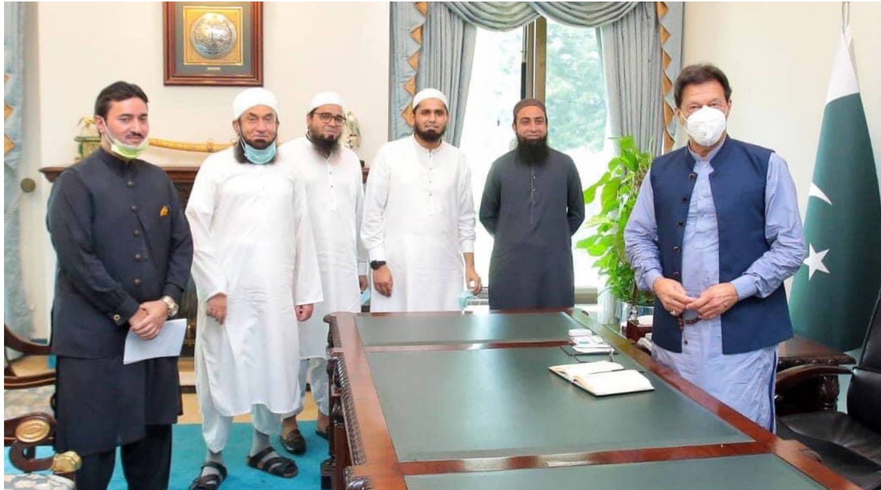
ISLAMABAD: Maulana Tariq Jamil meeting with Prime Minister Imran Khan.