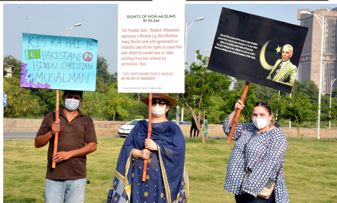
ISLAMABAD: Members of civil society hold a protest in favor of their demands outside NPC. — DNA

(ILAP), which provided the PPE, had asked the IMC to ensure wearing of the PPE by force or return the kits. Some of the workers were compelled to use the safety kits but they became unconscious on wearing it during the duty hours, he noted. The officer said about 40 per cent staff of the sanitation department comprised of women who had never expressed willingness to utilize the PPE. Out of the complete safety kit, which included gloves, protective suits, masks and face shields, he said the staff had been using only head caps. Some of the suits had huge sizes or not fit to wear, he added. — APP