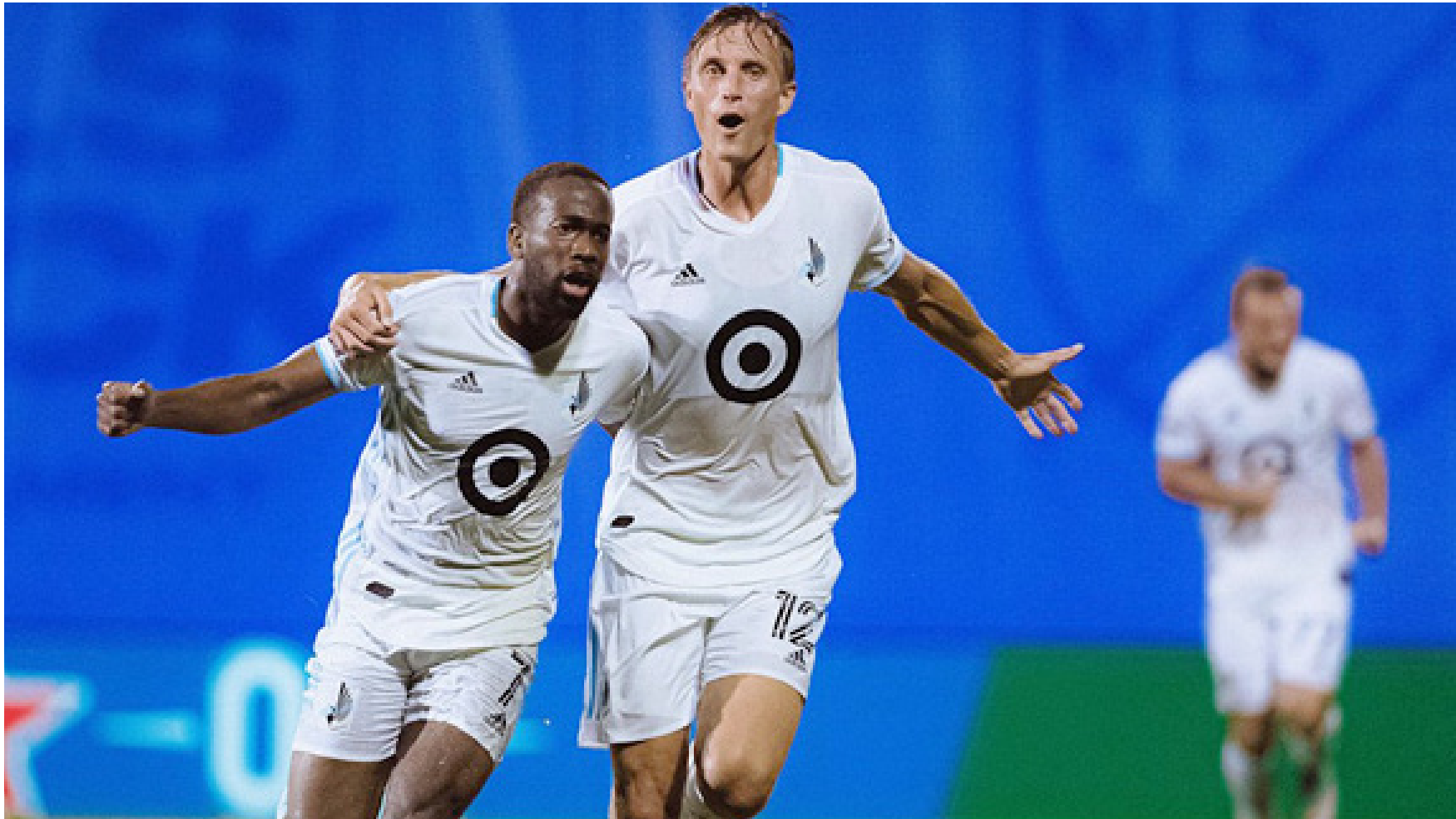
KANSAS: Minnesota United FC players celebrating a goal against Sporting KC in a Major League Soccer game.

MADRID: Hundreds of thousands of Catalonia residents were ordered back into lockdown on Sunday as coronavirus cases spiked in the Spanish region and new figures showed infections accelerating in many other parts of the world. Since the start of July, nearly 2.5 million new infections have been reported, a record level since the first outbreak of the disease in China last year, according to an AFP tally. In just a month-and-a-half the number of cases worldwide has doubled, according to the count based on official figures. The government of Catalonia region told residents in and around the north-eastern town of Lerida to go back into home confinement. "The people must stay at home," regional health official Alba Verges said. The area, with a population of more than 200,000, had already been ordered isolated from the rest of the region last weekend. It marks the first time that Spaniards have been kept in their homes since the hard-hit country exited confinement on June 21.