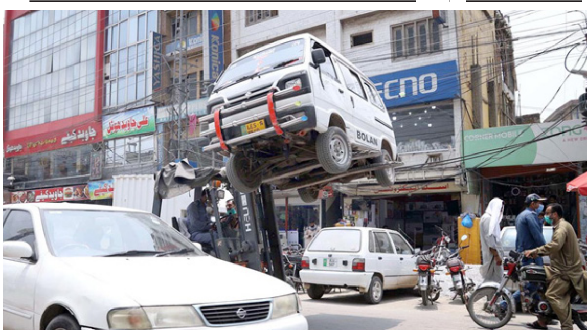
RAWALPINDI: A traffic police warden lifting a wrongly parked Carry car at Raja Bazaar.

Those persons whose parents or spouses are eligible but died can file an appeal through sending application with mentioning name and CNIC of the deceased and name of proposed deserving member of family and his or her CNIC number to the address: Dr. Sania Nishtar, Special Assistant to Prime Minister on Social Protection and Poverty Alleviation, F Block, Pak Secretariat, Islamabad.