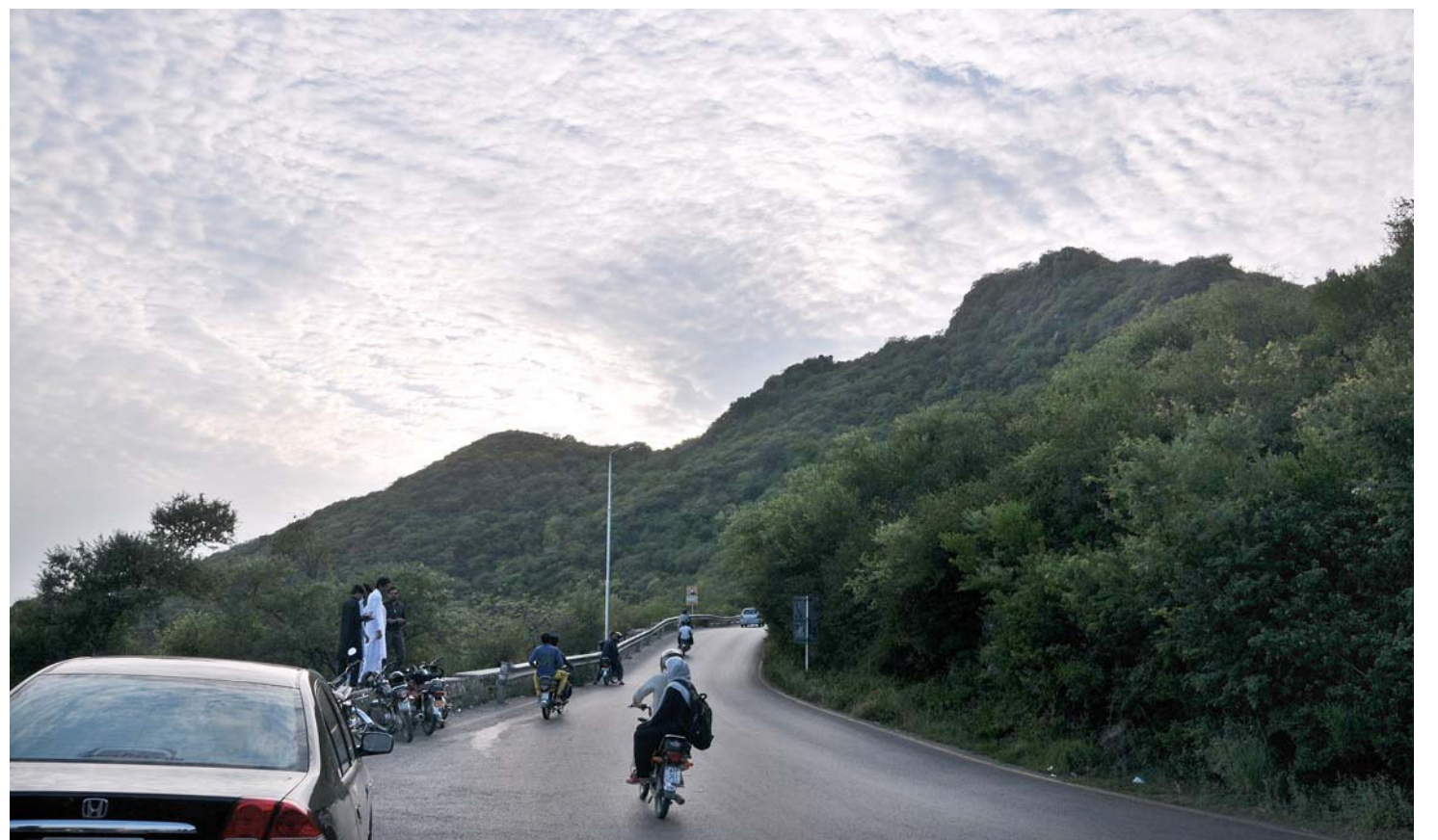
ISLAMABAD: An attractive view of clouds hovering over Margalla hilla in the federal capital.