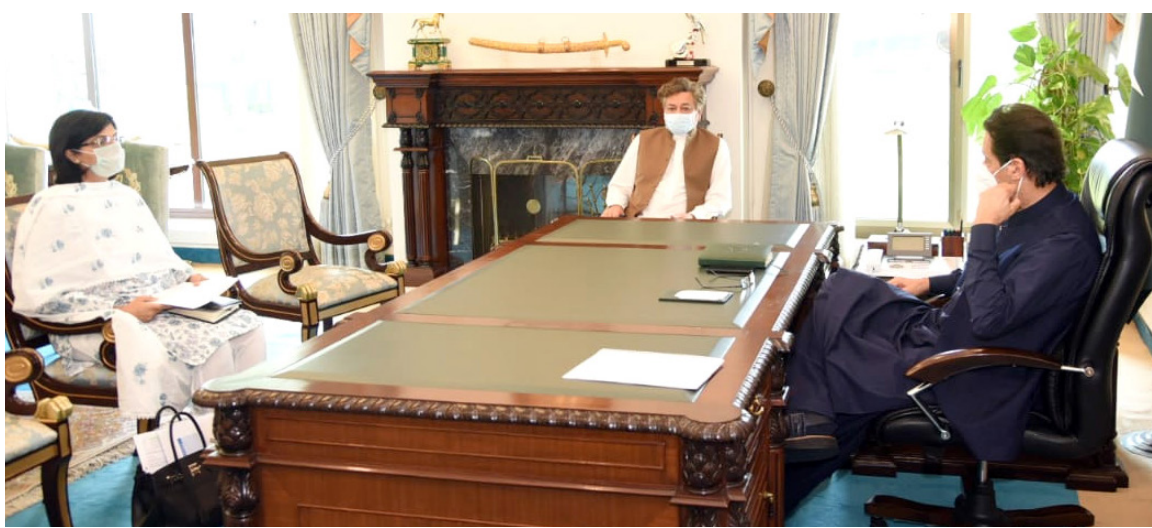
ISLAMABAD: Dr. Sania Nishtar in a meeting with Prime Minister Imran Khan.

the road with anti-China banners to make the protest look bigger and as their own. The protestors relied on the sound system of Iranian protestors who were chanting slogans against the Iran government and demanding return of the Shah of Iran's family to power. The BJP protestors supported slogans of Iranians dissidents for an hour and then broke away to stand at the doorsteps of the Chinese embassy where the numbers count stood at 16.