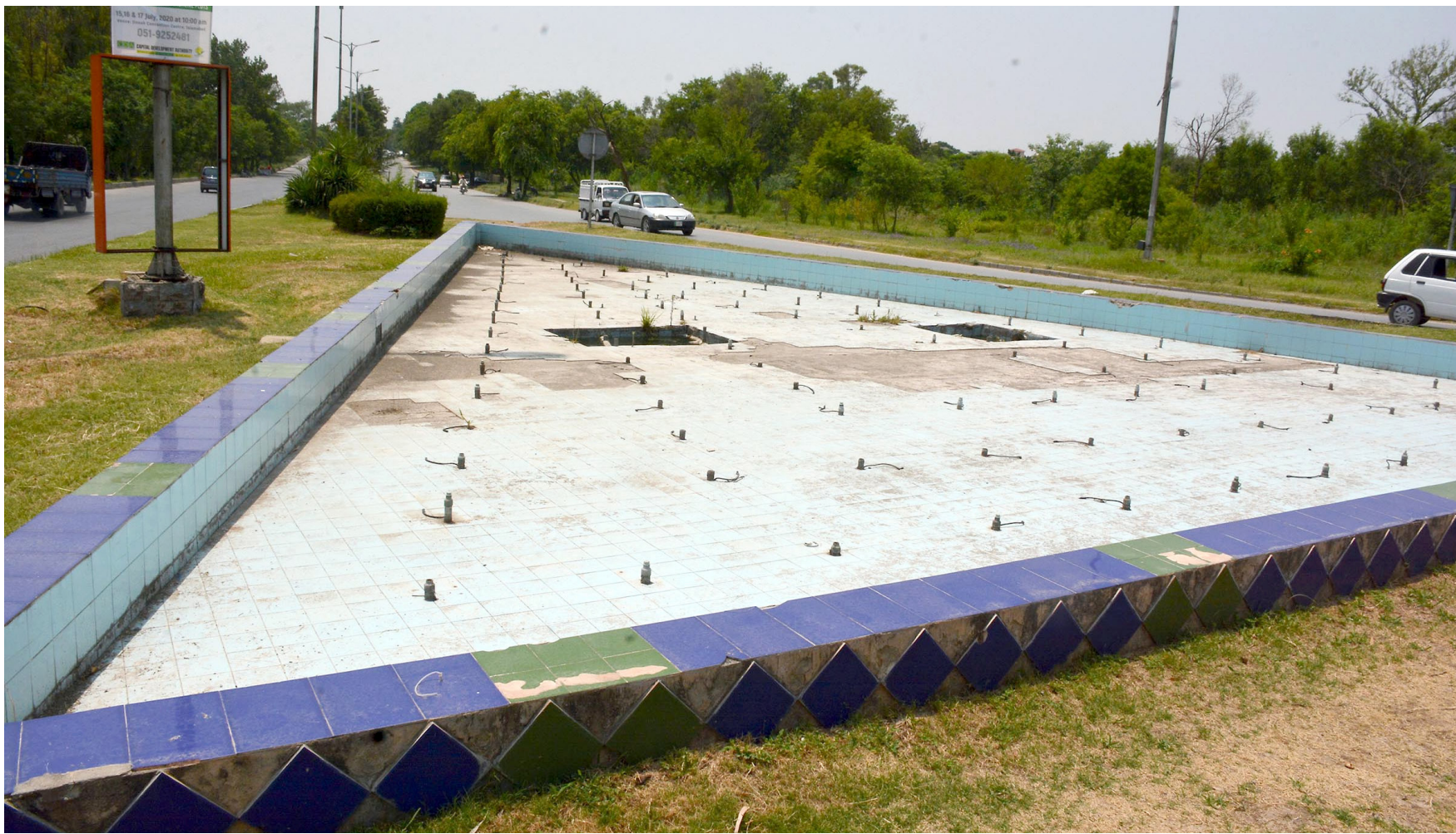
ISLAMABAD: A view of damaged and out of order fountain at F-10 Chowk that needs the attention of concerned authorities.

The water level in the Jhelum River at Mangla Dam was 1224.95 feet, which was 184.95 feet higher than its dead level of 1040 feet whereas the inflow and outflow of water was recorded as 38,000 cusecs and 25,000 cusecs respectively. The release of water at Kalabagh, Taunsa and Sukkur was recorded as 226,800, 188,400 and 57,700 cusecs respectively. — APP