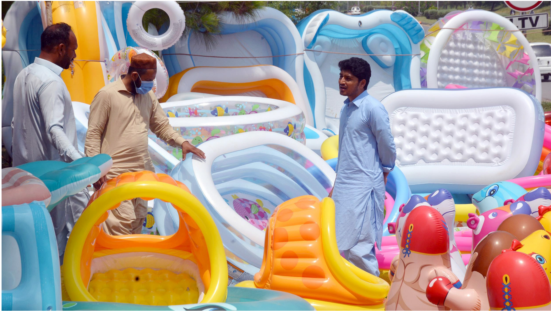
ISLAMABAD: People busy in purchasing plastic bath tubs during hot weather in capital city. — DNA

LAHORE: Pakistan has launched its first underground water reservoir system to store water from seasonal rains and reduce flooding in Lahore, a city of over 11 million people. The project, titled "Monsoon Underground Water Reservoir", took three months to be completed at Lahore's Lawrence Garden. Built at the cost of Rs. 149 million, the water tank can hold up to 1.5 million gallons of water after a heavy downpour. It is modelled after reservoirs in Japan and the United States, which offer an effective use of water resources and disaster prevention especially in metropolitan areas. The city's Water and Sanitation Agency (WASA), a government body responsible for the planning and maintenance of water supply and sewerage, identified 22 trouble spots in Lahore. After a monsoon shower, these areas, mostly low lying, would be submerged, forcing residents to wade into water-logged streets.