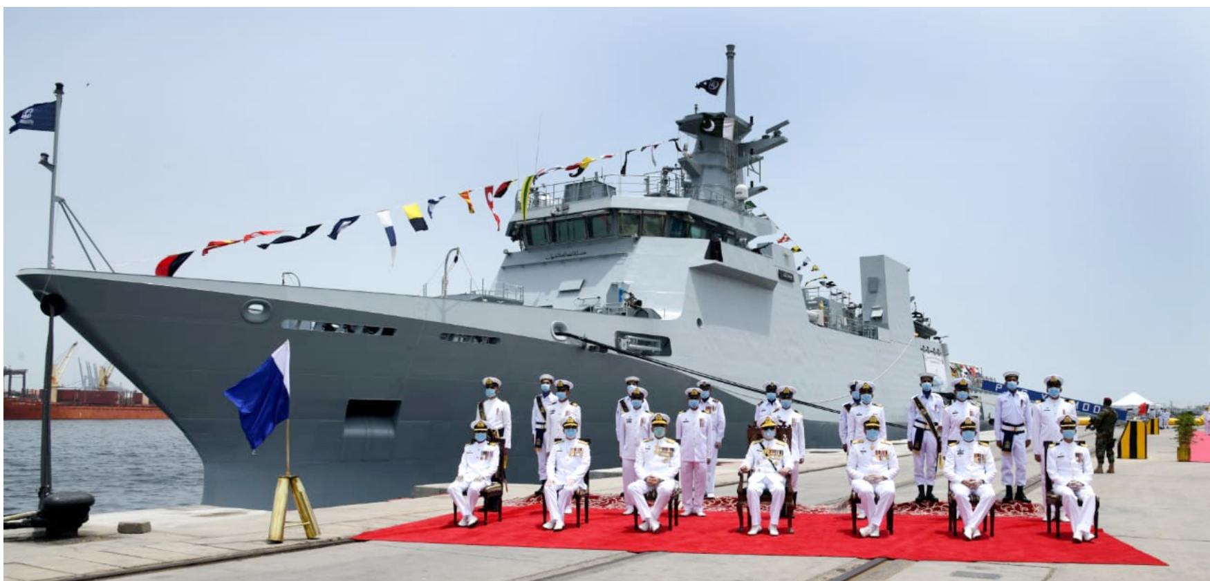
KARACHI: Chief of the Naval Staff Admiral Zafar Mahmood Abbasi in a group photo with crew of PNS Yarmook after induction ceremony.

JEDDAH: Houthi militias in Yemen finally backed down on Sunday over access to a stricken oil storage vessel to prevent it from leaking more than a million barrels of crude into the Red Sea. Engineers from a UN inspection team are now expected to board the FSO Safer in the next few days to assess the vessel's condition and carry out emergency repairs. The 45-year-old Safer has been moored 7 km off the coast of Yemen since 1988. It is stationary, with no engine or means of propulsion. The vessel fell into the hands of the Iran-backed Houthis in March 2015, when they took control of the coast around the port city of Hodeidah. The militants have refused for more than 5 years to allow international engineers to board the Safer to carry out essential repairs, and as the vessel's condition deteriorates there are fears that the 1.4 million barrels of oil it contains will start to seep out.