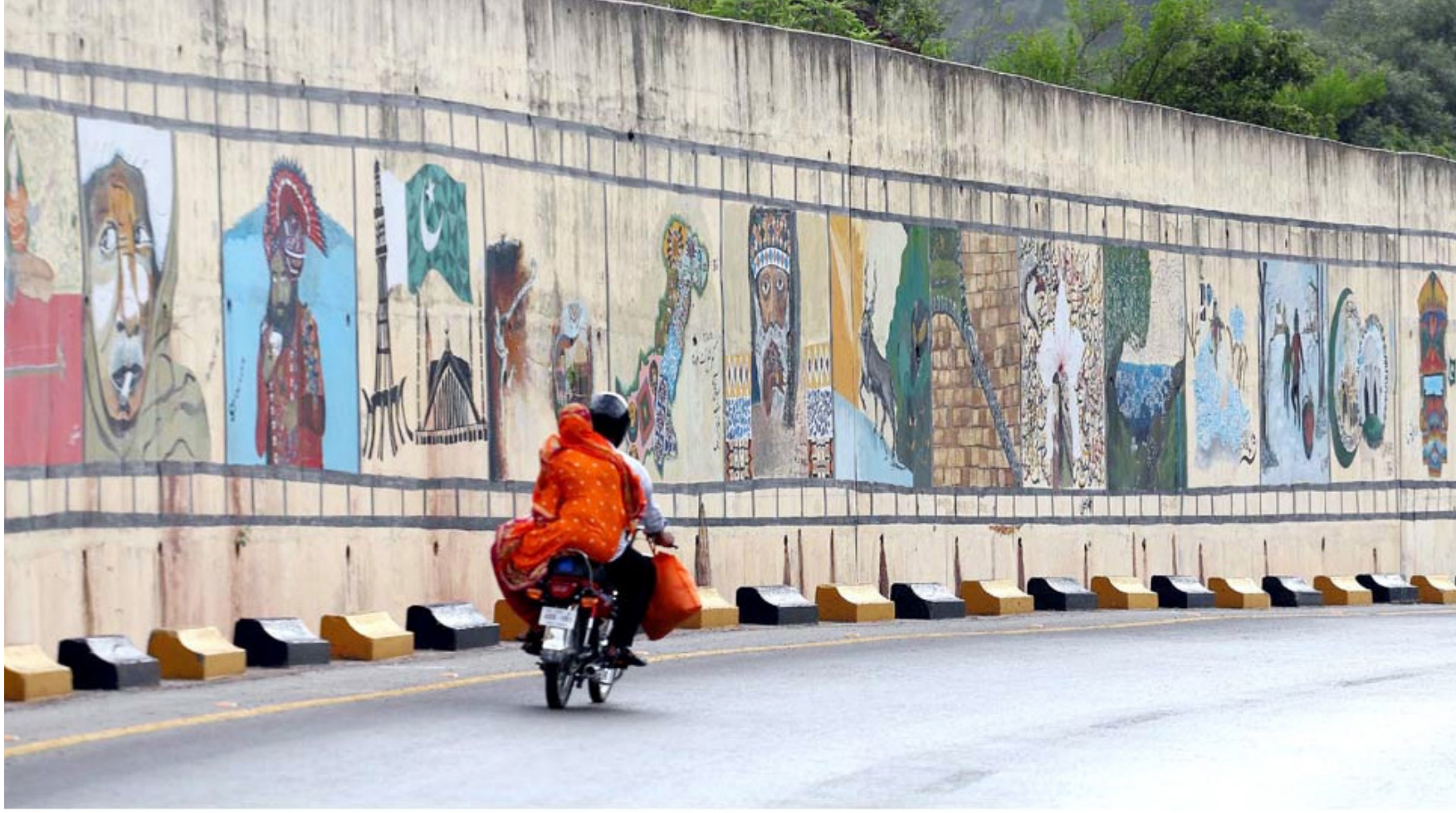
ISLAMABAD: A view of artworks on the wall of Murree motorway near Angoori area in the outskirts of federal capital.

502 VIPs fined over traffic violations ISLAMABAD: Islamabad Traffic Police (ITP) has imposed fine on 502 VIPs for committing traffic rules violations on major thoroughfares of the federal capital during ongoing year. The present management was committed to transform the ITP into public-friendly force by eliminating the VIP culture, a senior officer told APP while sharing the six month progress report on Monday. The fined VIPs included 24 police officers, 47 media persons, 63 politicians, 39 judiciary and celebrities each, 71 diplomats and 131 bureaucrats. As per details 315,436 fine tickets worth Rs. 85,667,700 were issued to road users over different traffic rules violations during the same period. He claimed that federal capital has witnessed 35 percent decline in fatal accidents while 16 percent non-fatal accidents were occurred in 2020 as compared to the previous year of 2019. The IGP said that ITP was a role model for all other departments and appealed the citizens for their cooperation and follow traffic rules.