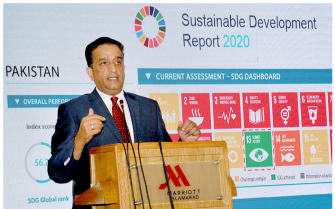
ISLAMABAD: Adviser to the Prime Minister on Climate Change, Malik Amin Aslam addresses participants of the event "Sustainable Development Report 2020 - Pakistan's Landmark Achievement of Sustainable Development Goal 13: 'Climate Action'".

Ideally, the business should have operational history of at least 3 years and revenue (sales) of at least PKR 5 million in the last 12 months. In exceptional cases, a business with an operational history of less than 3 years may also be considered provided it is generating sufficient revenues and demonstrates high potential for scalability and growth.