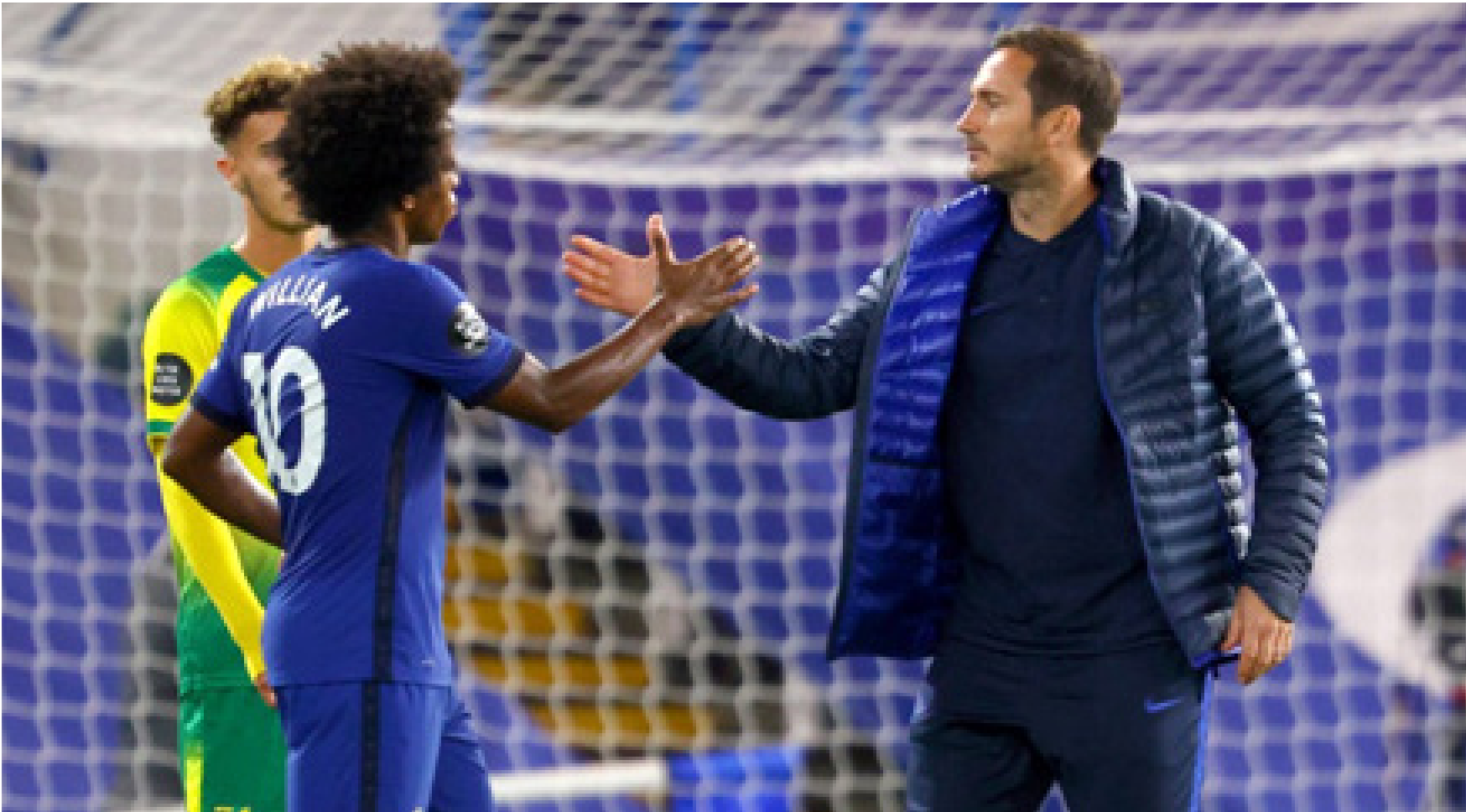
LONDON: Chelsea manager Frank Lampard appreciating his players after they managed a win over Norwich City to keep their Premier League top four hopes alive.

BAMAKO: Gunmen on motorcycles killed seven people in attacks on two villages in central Mali, an area plagued by jihadist attacks and intercommunal violence, a local mayor said Wednesday.