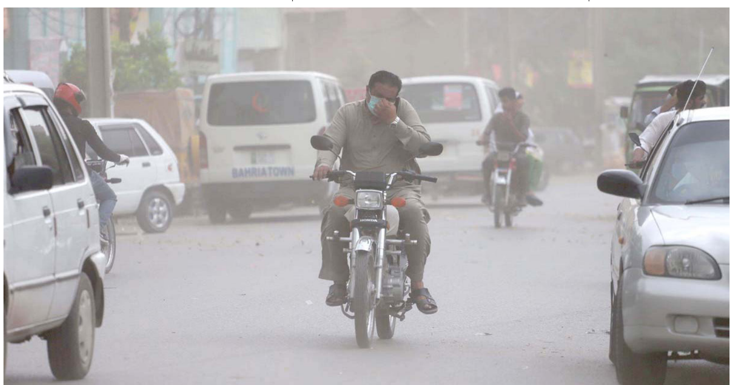
RAWALPINDI: Motorcyclist on the way struggling to move forward during wind storm in the city.