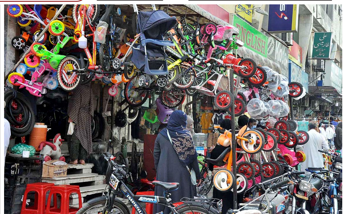
ISLAMABAD: A vendor displaying bicycles to attract customers at his roadside shop.

The Vice Chancellor (VC) briefed the President about the role and achievements of the Institute. He informed that the Institute offered graduate and undergraduate degree programmes in specialized engineering and space-related disciplines. He said that the IST continued its classes uninterrupted during the Corona Pandemic by providing online education to the students. The VC apprised the participants about the research activities of the institute and said that IST was equipped with state-of-the-art equipment that was compatible with international standards. The President asked the management of the institute to increase its outreach to the remote areas of the country and particularly focus on Balochistan, AJK and Gilgit-Baltistan.