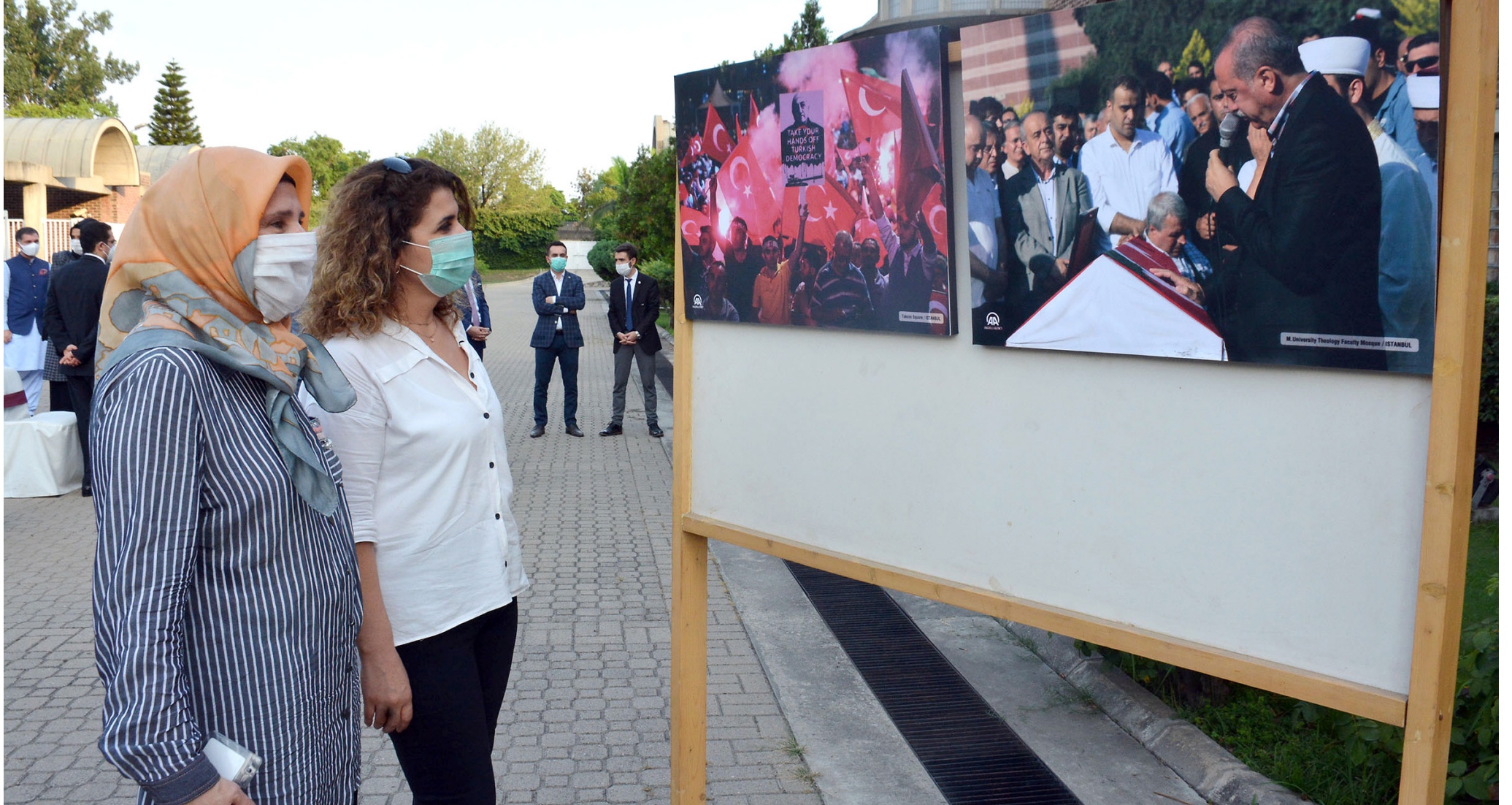
ISLAMABAD: Guests taking interest in various pictures highlighting valiant struggle of Turkish people against a handful of miscreants who tried to topple the elected government on July 15.