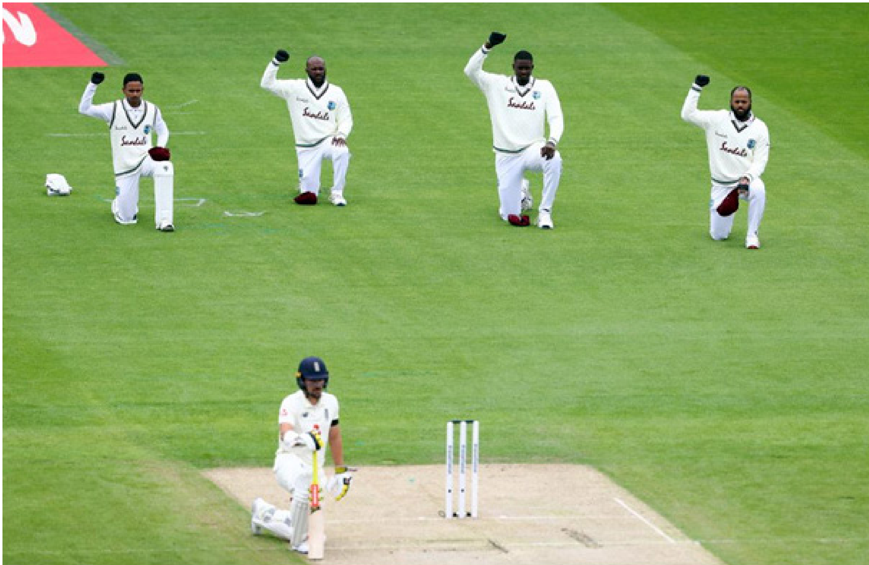
OLD TRAFFORD: England and Windies cricket players show their support for the Black Lives Matter movement by taking a knee before the start of the 2nd Test match at the Emirates Old Trafford.

"We still have a long way to go in the fight to combat child poverty in this country but receiving recognition from your city means we are heading in the right direction and that means a lot. Thank you to The University of Manchester."