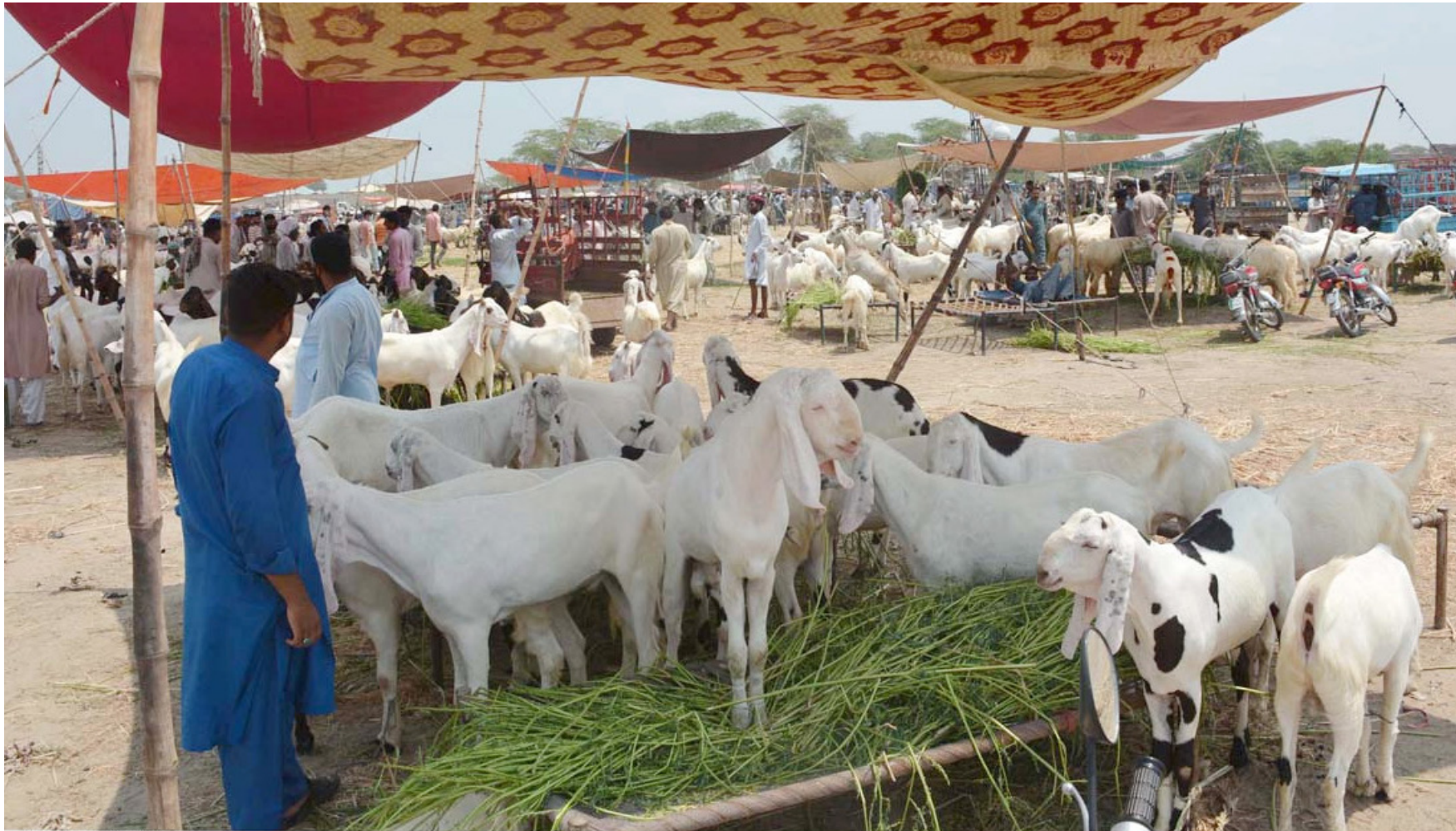
FAISALABAD: Vendors displaying sacrificial animals to attract the customers at Animal Market in connection with upcoming Eid Ul Azha. — APP

ISLAMABAD: The National Command and Operation Centre (NCOC) on Thursday said wearing masks and compliance of standard operating procedures (SOPs) by the public were only measures to contain COVID-19 outbreak in the country. The NCOC meeting chaired by Federal Minister for Planning, Development and Special Initiatives Asad Umar took stock of SOPs through digital analysis and cattle markets' management and emphasized the need to ensure compliance of safety guidelines. Speaking on the occasion, Asad Umar said public health and safety was the government's top priority and any sort of complacency in following safety protocols would increase the risk of disease spread on Eid-ul-Azha. — APP