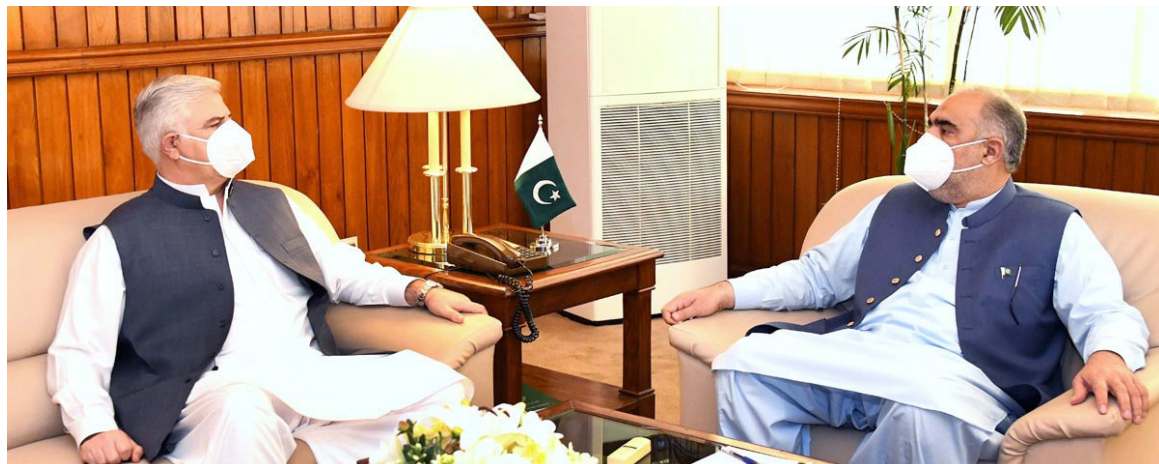
ISLAMABAD: Chief Minister KPK Mehmoed Khan called on Speaker National Assembly Asad Qaiser at Parliament House. — APP

The Vice Chancellors underlined the measures taken to promote e-learning and online classes through LMS. They appreciated the HEC's role in making the transition easier. However, they also pointed out the hardships universities are confronted with, especially in terms of payment of salaries and meeting other expenses as a result of the recent cut to the HEC funding.