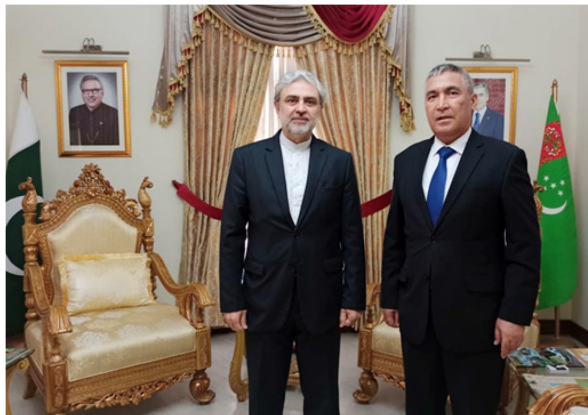
ISLAMABAD: Ambassador of Turkmenistan met with Ambassador of Iran Ali Hosseini. — DNA

He informed the lawmakers that out of 2000 cameras installed in the city under safe city project by the previous government, 1700 cameras were out of order. He said that present government rectified faults in the 1700 cameras and also replaced faulty cable at various places. He said that a contract had been signed to monitor functionality of the cameras, adding a report about working of cameras was submitted to high-ups on daily basis. — APP