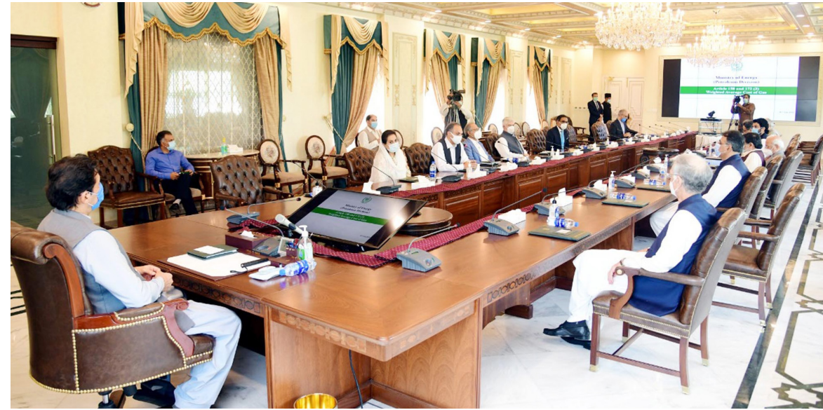
ISLAMABAD: Prime Minister Imran Khan chairing a high level meeting to review K Electric affairs.

the topmost priorities of the PTI-led federal government. Criticising the two major opposition parties, he said opposition should not interfere in the efforts to move Pakistan forward as Pakistan is now heading towards development with Prime Minister Imran Khan's leadership, who with his team was currently dealing with important issues including coronavirus. He said in order to make all national institutions profitable, it was necessary to expedite administrative reforms as well as ensure efficient utilization of all available resources in a transparent manner. He said Prime Minister Imran Khan was keeping a close watch on everyone, and anyone involved in corruption will not be spared. He said the PTI was representative of the people of Pakistan and other side of the coin opposition known as corrupt practices. PTI government had successfully launched the biggest-ever financial assistance programme for deserving people in the history of Pakistan, as its fruits would reach the common people very soon, he said.